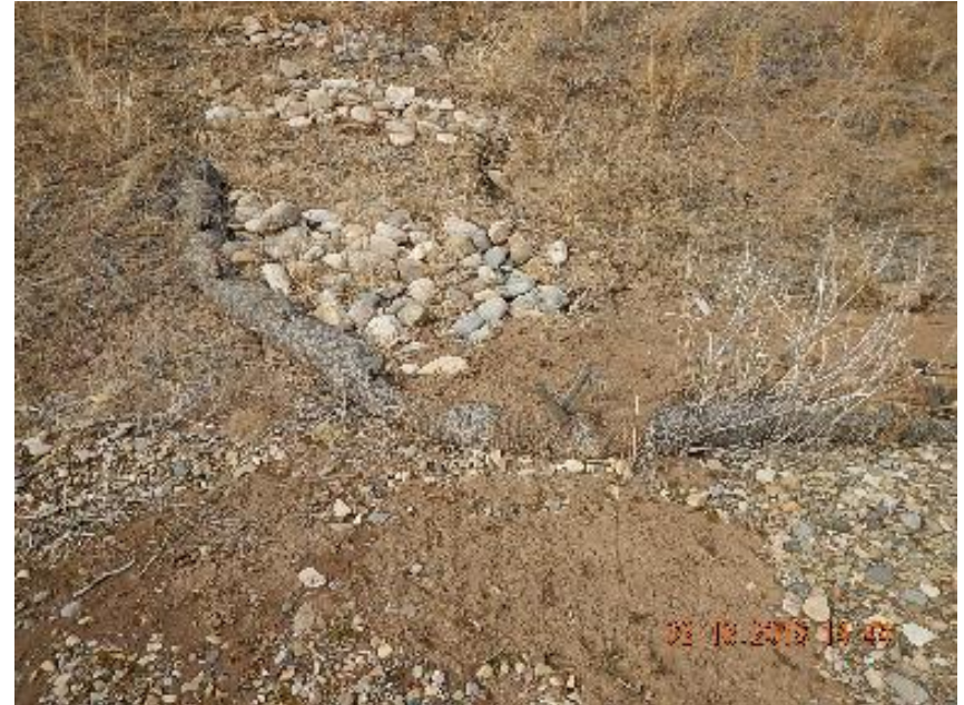
Photo 10: Waddle failing due to sediment filling up backside allowing stormwater and sediment to flow onto location.