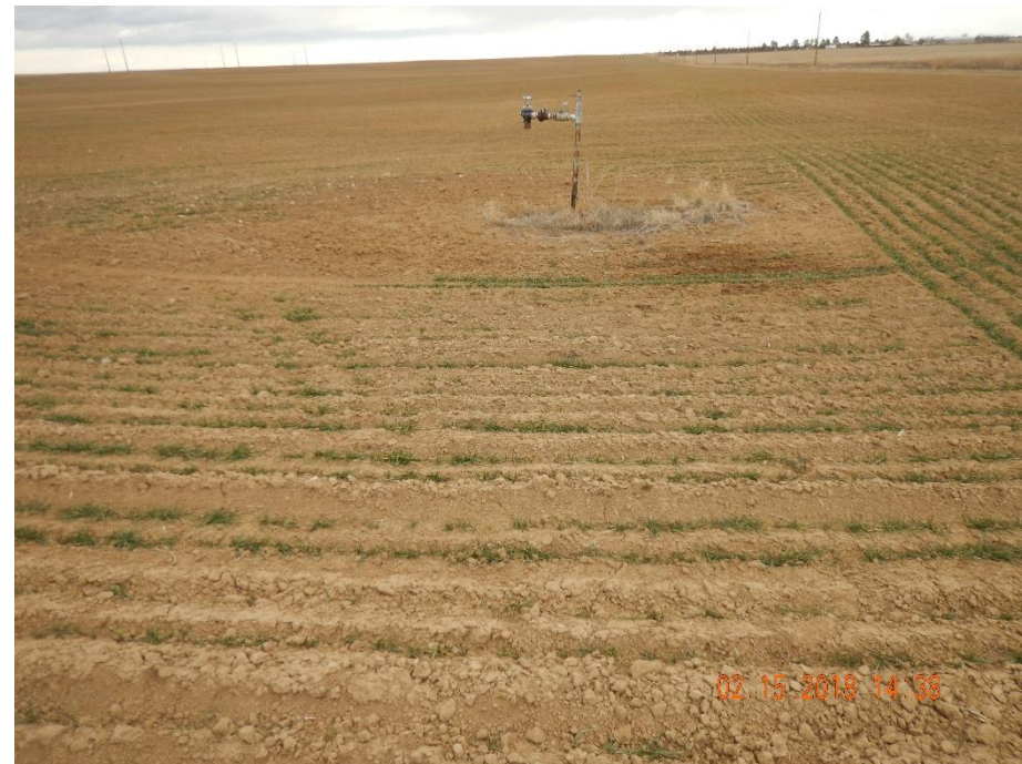
Photo 6: Photo taken from the south end of the former tank battery facility, facing north. Photo shows riser remaining at the battery location. Previous inspections required operator to remove riser in accordance to 1004.a; corrective action has not been addressed. Photo also shows riser equipment appears to be interfering with surface owners agricultural activities.