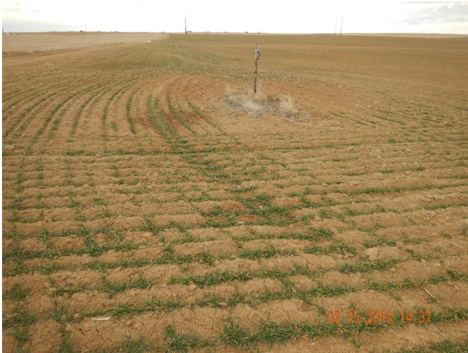
Photo 5: Photo taken from the east end of the former tank battery facility, facing west. Photo shows riser remaining at the battery location. Previous inspections required operator to remove riser in accordance to 1004.a; corrective action has not been addressed. Photo also shows riser equipment appears to be interfering with surface owners agricultural activities.