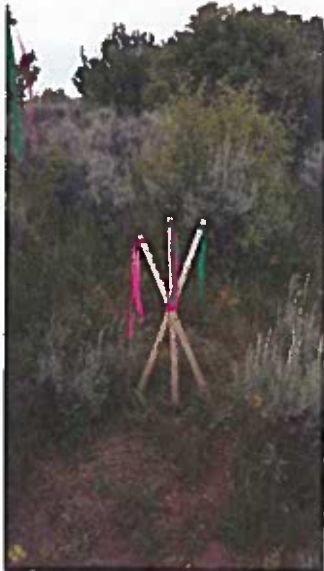
REFERENCE AREA LOOKING NORTH 6/28/2016