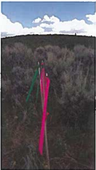
REFERENCE AREA LOOKING EAST 6/28/2016