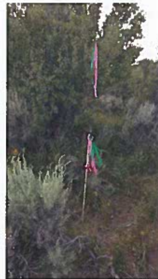
REFERENCE AREA LOOKING WEST 6/28/2016

REFERENCE AREA CENTER STAKE (DO NOT DISTURB) LATITUDE (NAD 83) NORTH 39.450781 DEG. LONGITUDE (NAD 83) WEST 108.193953 DEG.