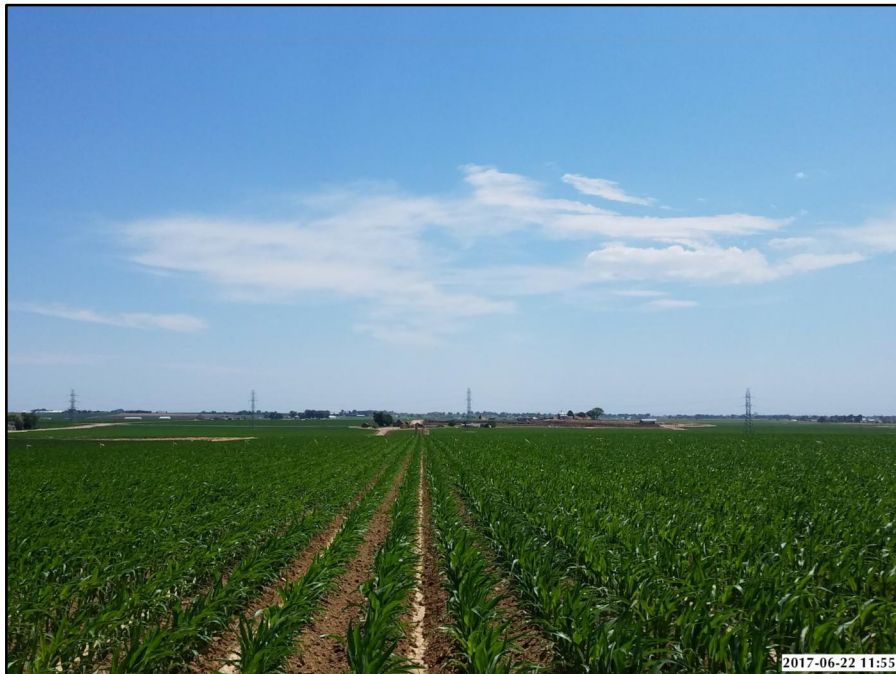
PICTURE OF LINCOLN STATE 3-18 PAD WELL PAD LOCATION - CAMERA ANGLE EAST