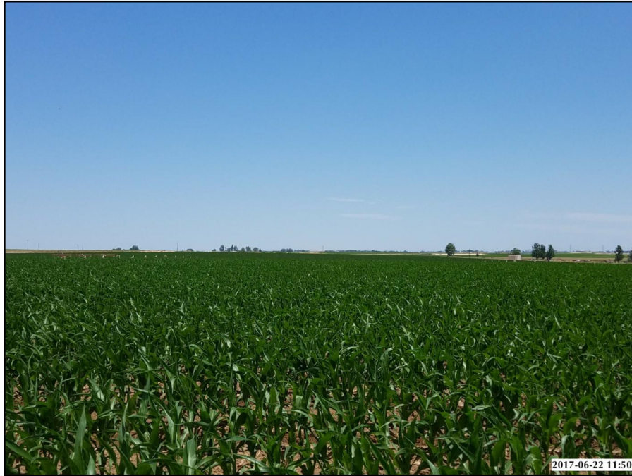
PICTURE OF LINCOLN STATE 3-18 PAD WELL PAD LOCATION - CAMERA ANGLE NORTH