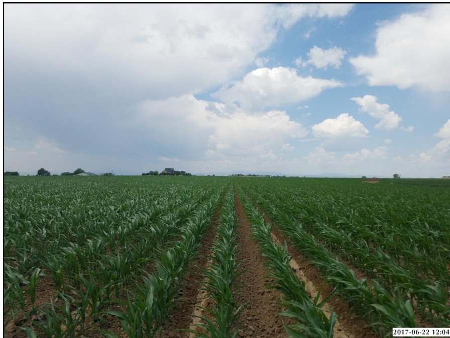
PICTURE OF LINCOLN STATE 3-18 PAD WELL PAD LOCATION - CAMERA ANGLE WEST