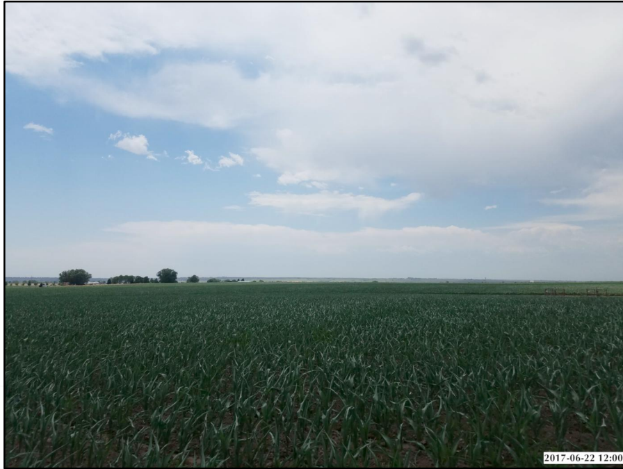
PICTURE OF LINCOLN STATE 3-18 PAD WELL PAD LOCATION - CAMERA ANGLE SOUTH