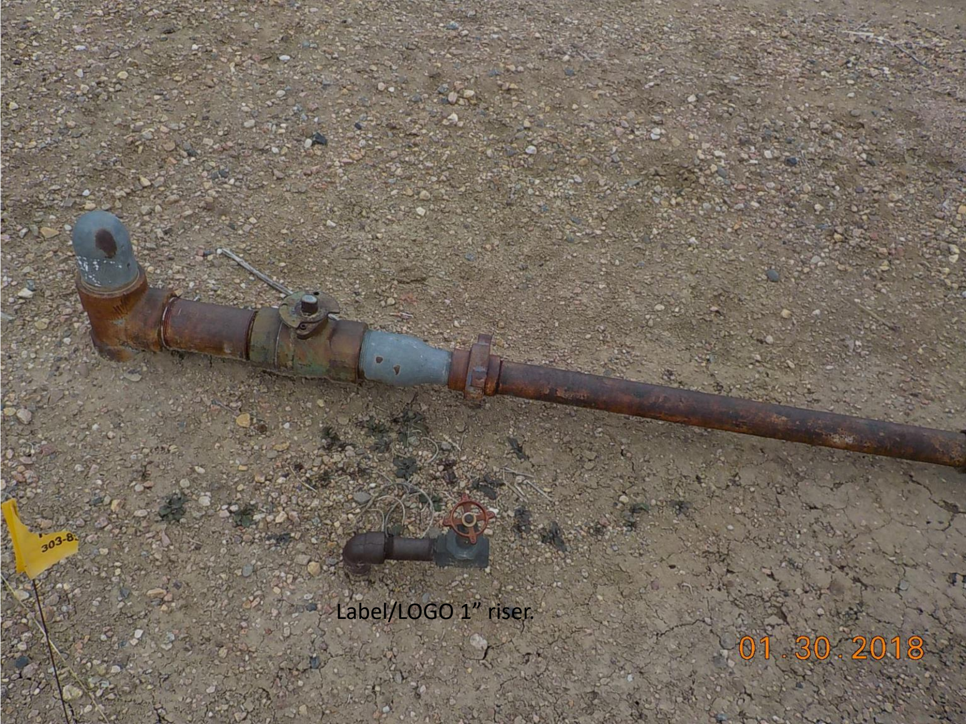
Label/LOGO 1" riser.