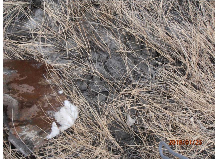
Photo 2 – Photo of dried drilling fluid at soil sample location SS-1.