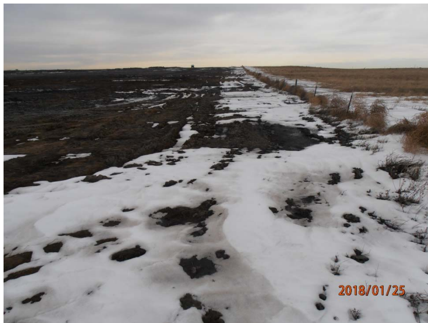
Photo 5 – Photo from southwest corner of Sandy Hill Land Application area looking east down property line. Winick property is on southside of fence line in the right of the picture.