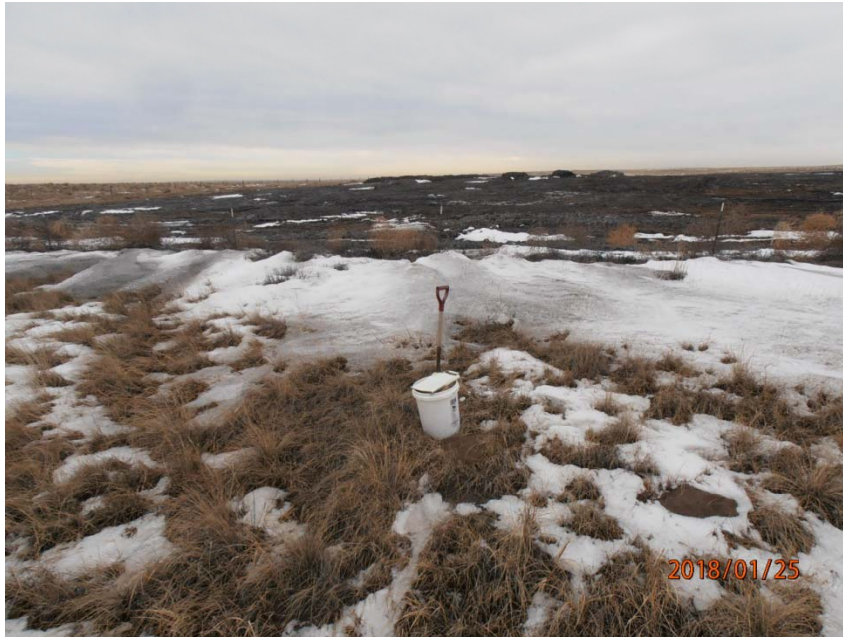
Photo 1 – Photo of soil sample location SS-1, looking north. Soil Sample SS-1 location Lat/Lon = 40.37533 / -104.23270