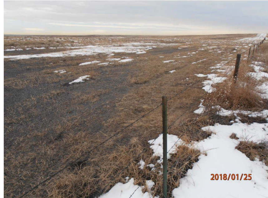
Photo 17 - Photo looking northwest across fence at dried drilling mud of spill onto State Land Board land. Spill was reported by Operator and assigned Spill ID #452946.