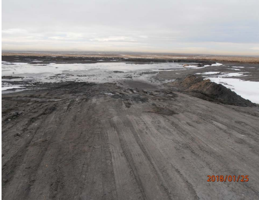
Photo 10 – Photo of ponded drilling fluid on land application site, taken from Lat/Lon 40.37827,-104.23025 looking west-northwest.