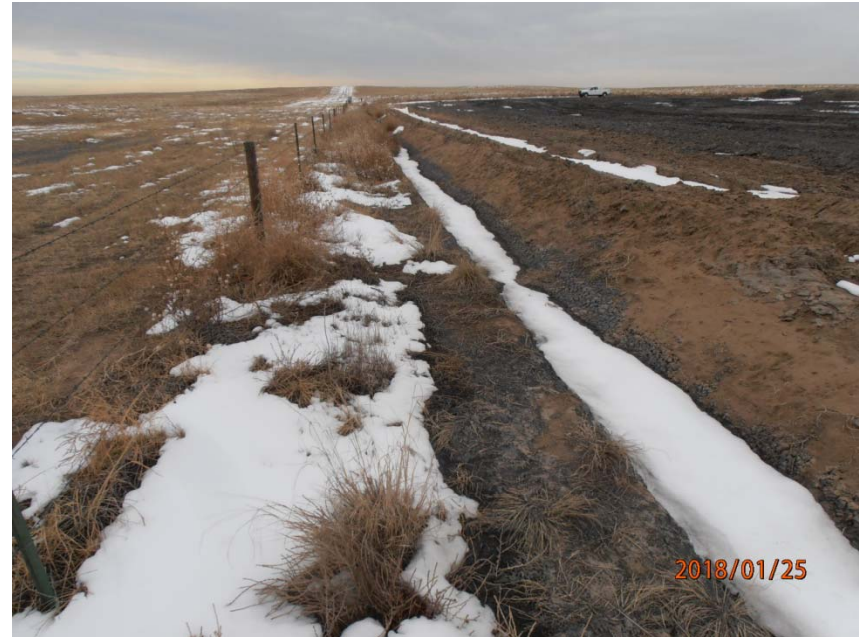
Photo 19 - Looking north on Sandy Hill Land Application western boundary where spill onto State Land Board land occurred.