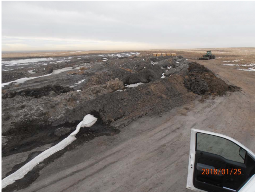
Photo 8 – One of two areas of staged drill cuttings, looking north.