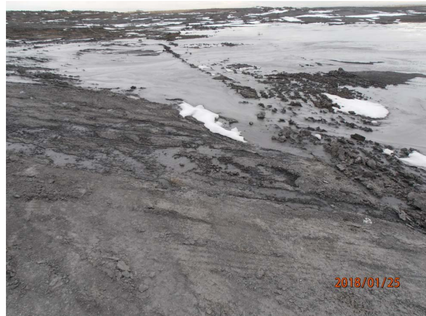
Photo 13 – Photo near edge of pond where drilling fluids are dumped.