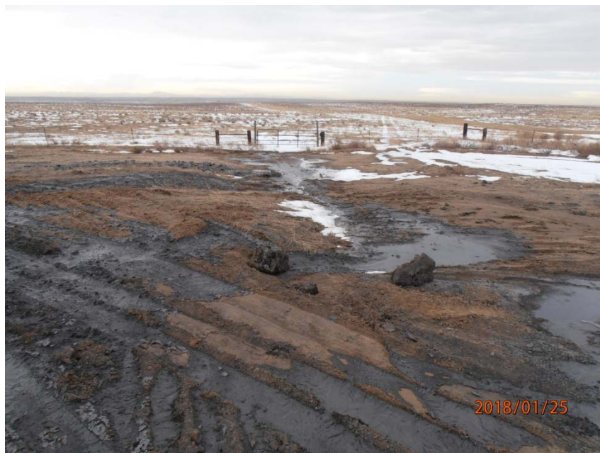
Photo 14 – Drilling fluids and stormwater mixing with waste runoff in northwest corner of Sandy Hill Land Application area. Gate accesses State Land Board land to the west.