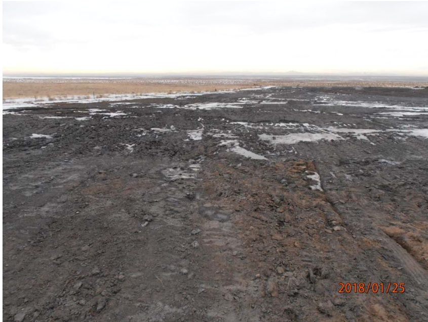
Photo 7 – Photo from rise on Sandy Hill Land Application area looking west toward southwest corner of land application area.