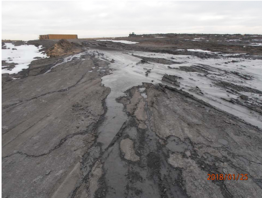
Photo 12 – Photo of area where drilling fluids are drained to flow into pond.