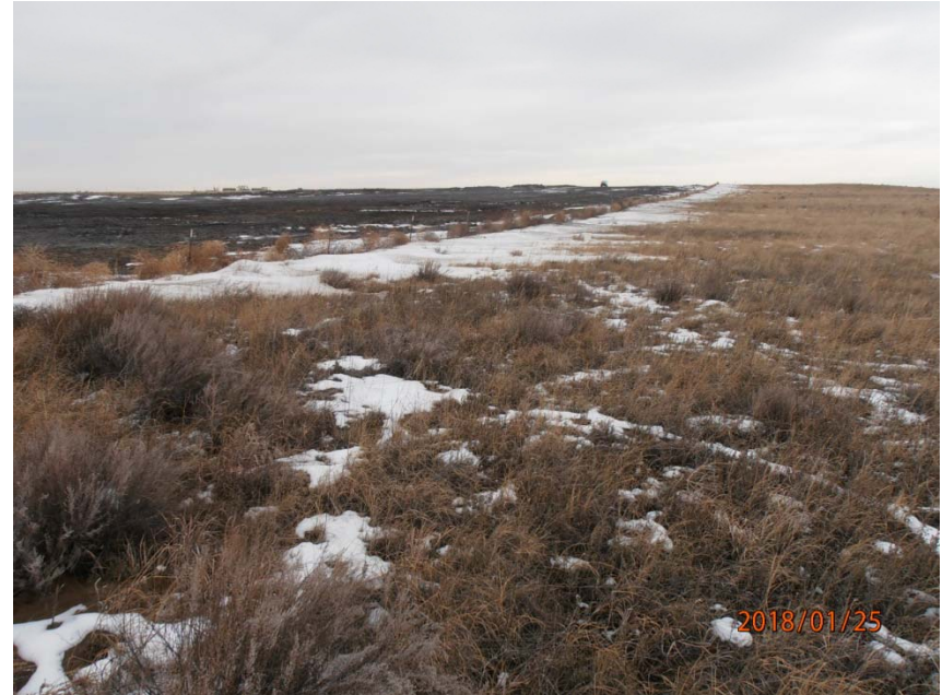
Photo 4 – Photo from northwest corner of Winick property looking east down property line. Sandy Hill Land Application area is north of property. Area of Winick property beneath snowdrift has been impacted by the migration of drilling fluid.