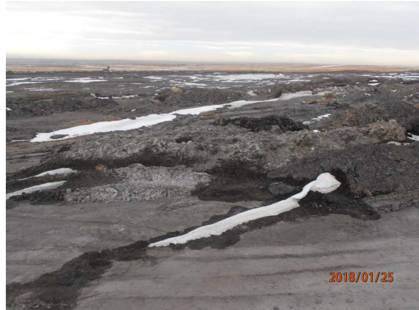
Photo 9 – One of two areas of staged drill cuttings, looking west.