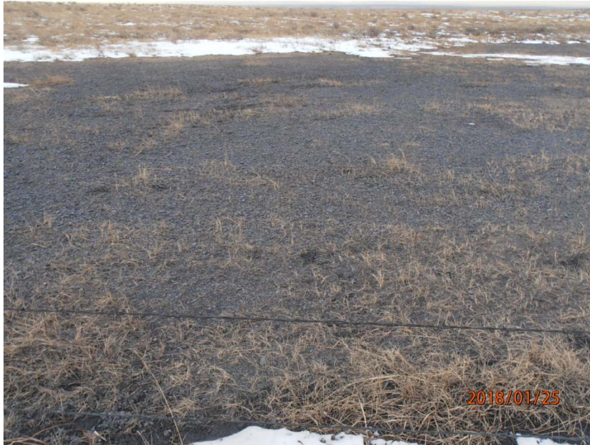
Photo 16 – Photo looking west across fence at dried drilling mud of spill onto State Land Board land. Spill was reported by Operator and assigned Spill ID #452946.