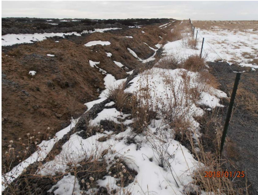
Photo 18 – Looking south on Sandy Hill Land Application western boundary where spill onto State Land Board land occurred.