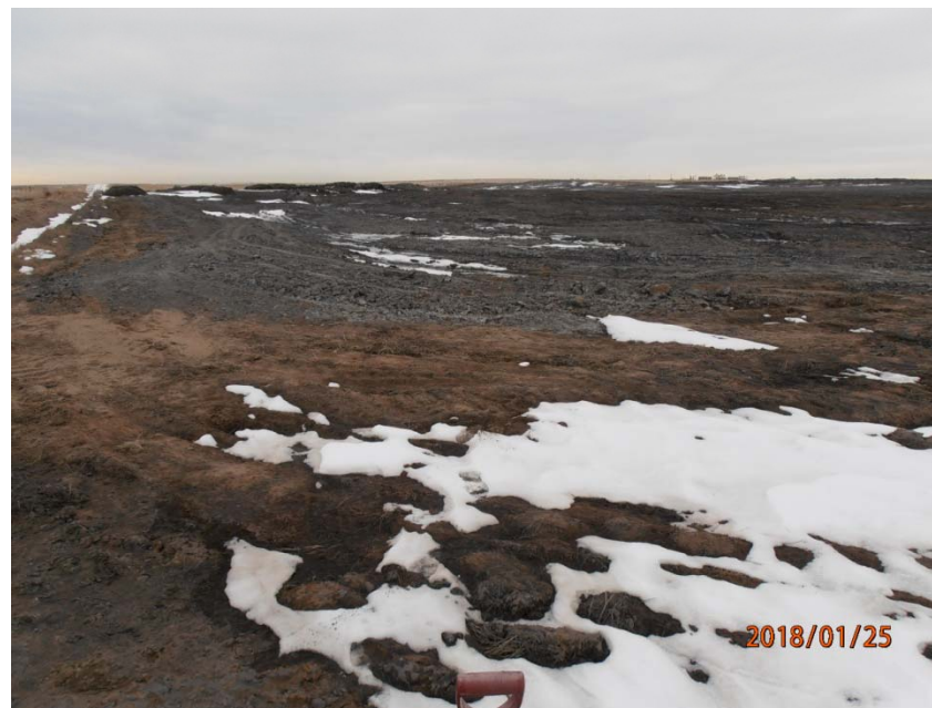
Photo 6 – Photo from southwest corner of Sand Hill Land Application area looking north down western property line.