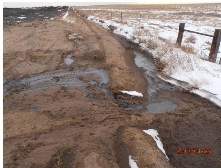
Photo 15 – Drilling fluids and stormwater mixed with waste runoff into ditch at northwest corner of Sandy Hill Land Application area, looking south. State Land Board land is across the fence to the west.