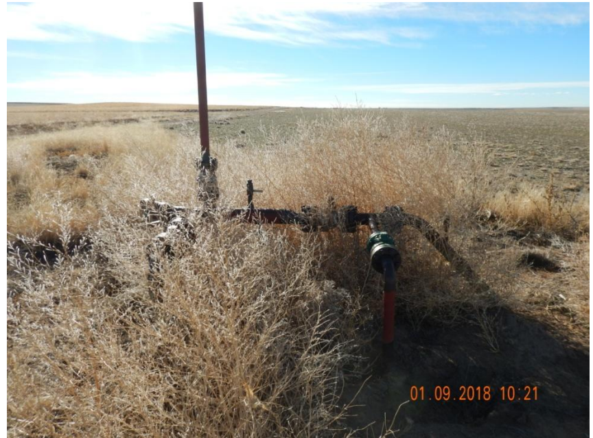
Photo 8. Photo taken between the well location and battery location, facing South. Operator has failed to remove equipment within 3-months of plugging the well.