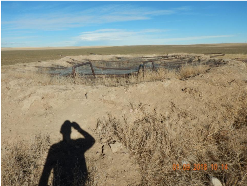
Photo 1. Photo taken from the pit at the battery location, facing North. Operator has failed to backfill pit per Rule 1004.a.