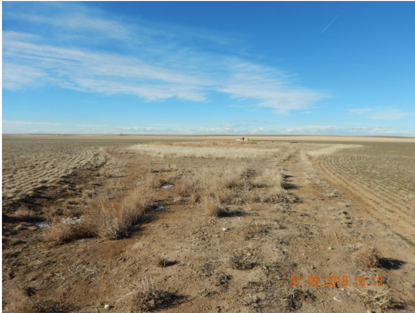
Photo 5. Photo taken from the eastern battery location, facing West. See comments under Photo 4.