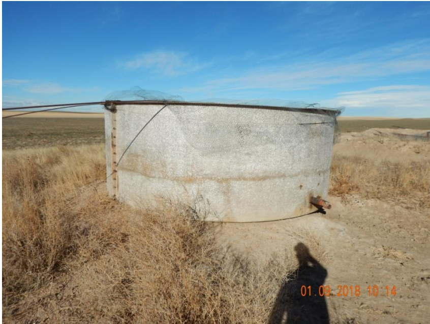
Photo 3. Photo taken from the battery location, facing Northwest. See comments under Photo 2.