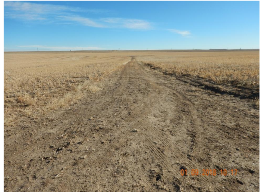
Photo 6. Photo taken from the access road to the well location, facing East. See comments under Photo 4.