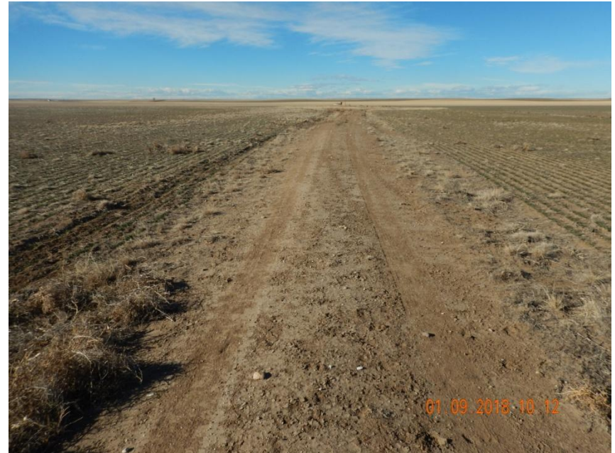
Photo 4. Photo taken from the access road to the battery location, facing West. Operator has failed to perform reclamation activities within 3-months of plugging the well on cropland.