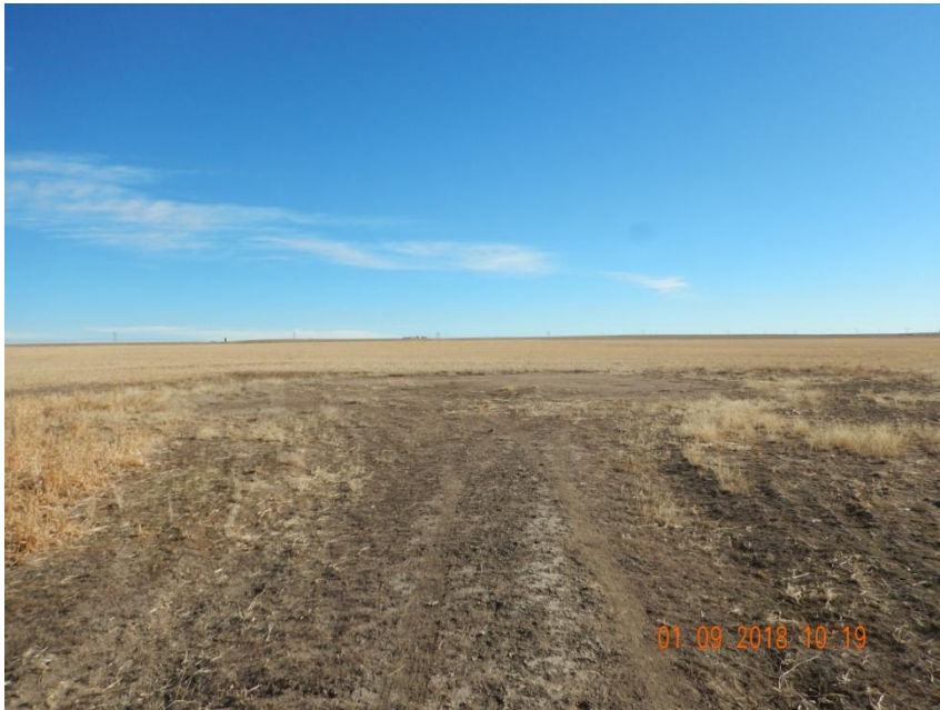
Photo 7. Photo taken from the well location, facing East. See comments under Photo 4.