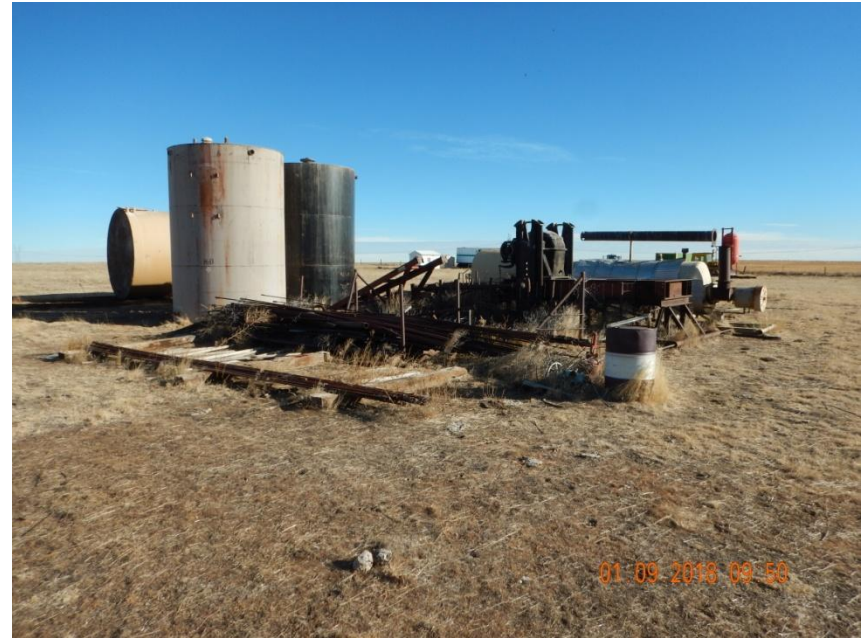
Photo 6. Photo taken from battery location, facing East. See comments under Photo 3.