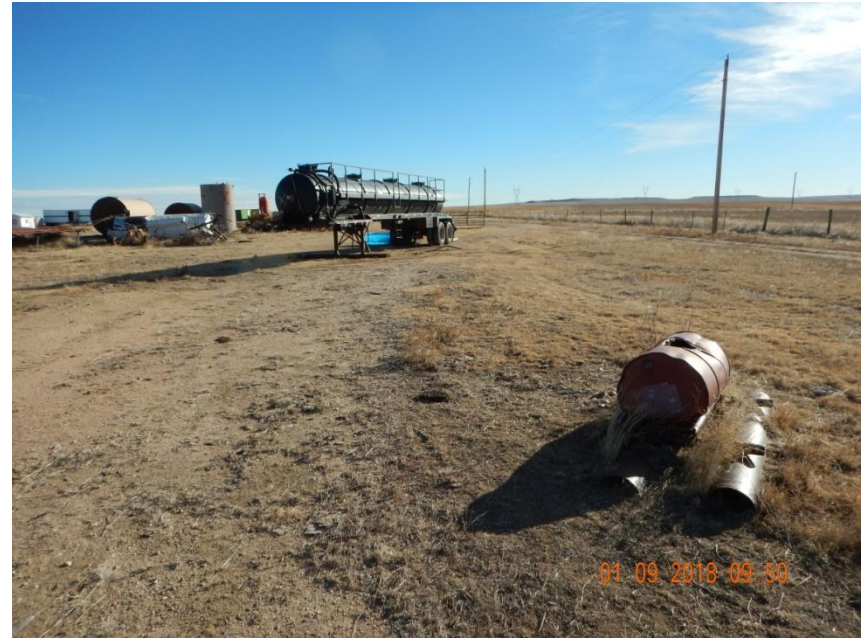
Photo 4. Photo taken from battery location, facing East. See comments under Photo 3.