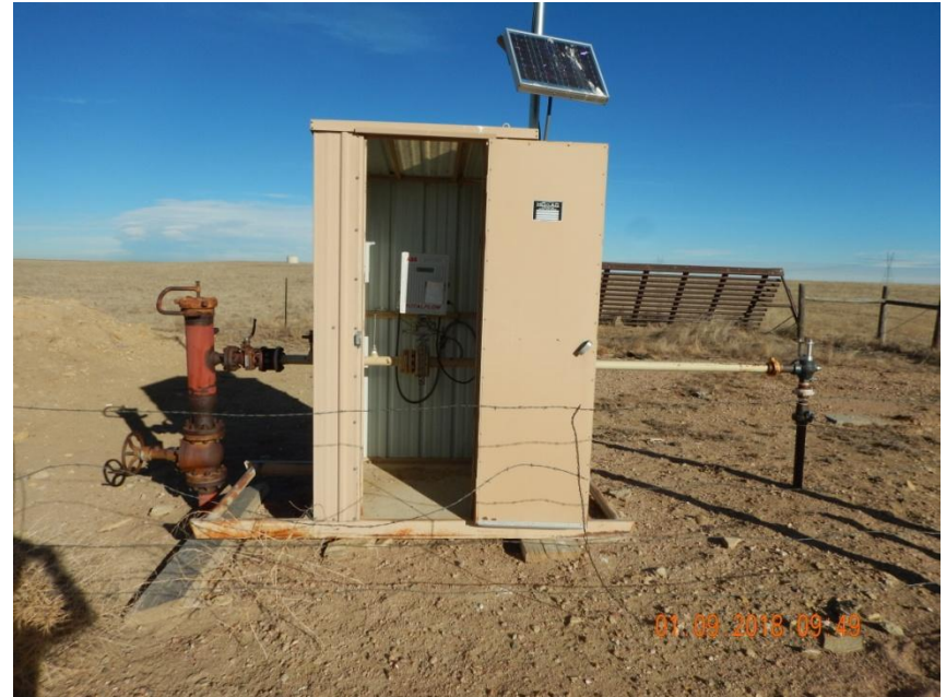
Photo 2. Photo taken from the battery location, facing North. Operator has failed to remove equipment within 3-months of plugging the well.