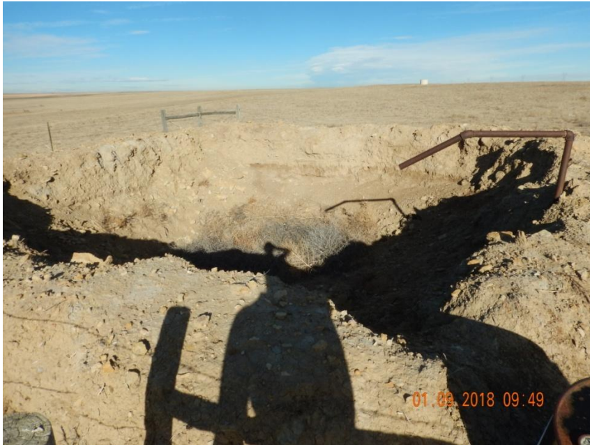
Photo 1. Photo taken from the pit at the battery location, facing North. Operator has failed to backfill pit per Rule 1004. Operator has failed to comply with Rule 902.d.