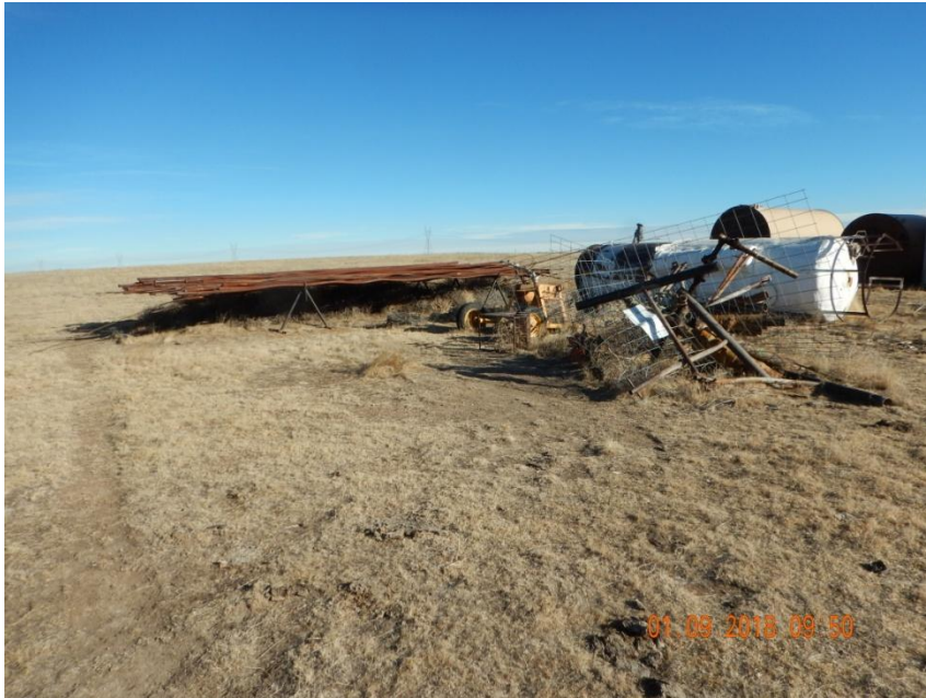
Photo 5. Photo taken from battery location, facing East. See comments under Photo 3.