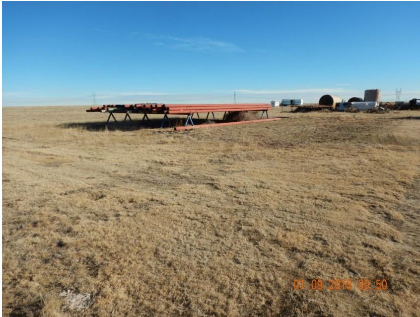
Photo 3. Photo taken from battery location, facing East. Operator has failed to remove unused equipment.