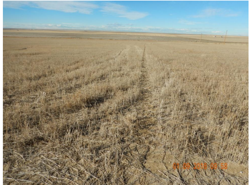
Photo 4. Reference cropland photo taken north of the well location, facing West.