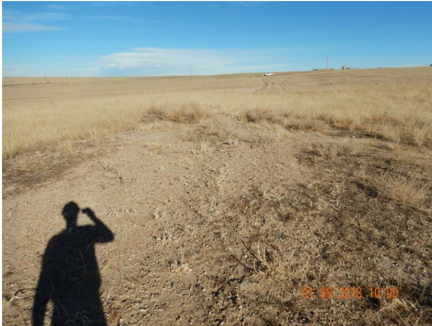
Photo 3. Photo taken from the well location, facing North. See comments under Photo 2.