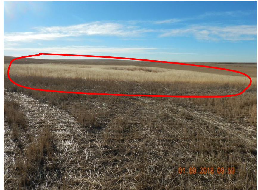
Photo 2. Photo taken north of the well location, facing South. Well location with gravel remains in place.