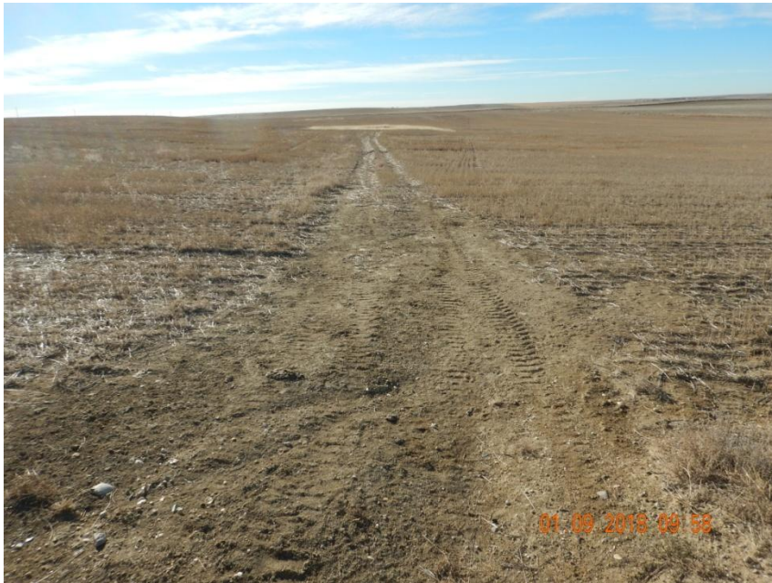
Photo 1. Photo taken from the access road to the well location, facing South. Operator has failed to perform reclamation activities within 3-months of plugging the well on cropland. Access road with gravel remains in place.