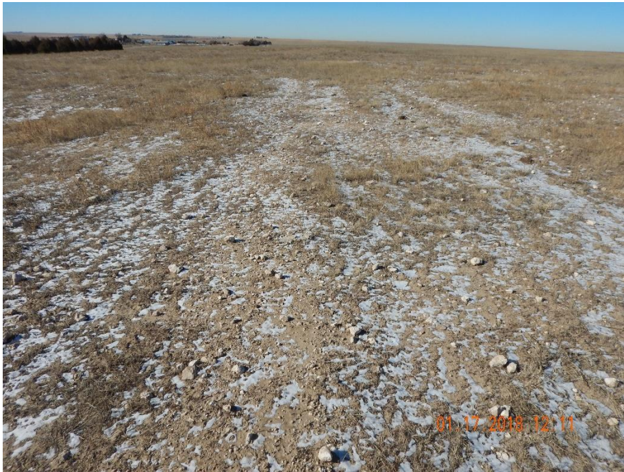
Photo 5: Photo taken from the southeast end of the former pit/facilities location, facing west. Photo shows large areas of the location remain predominantly bare and exposed soil. Unable to find evidence that additional reclamation activities have been conducted per corrective actions.