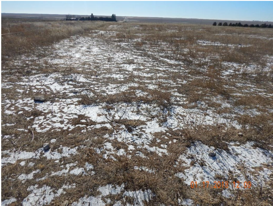
Photo 1: Photo taken from the north end of the former pit and facilities location, facing south. Photo shows large areas of the location remain predominantly bare and exposed soil. Unable to find evidence that additional reclamation activities have been conducted per corrective actions.