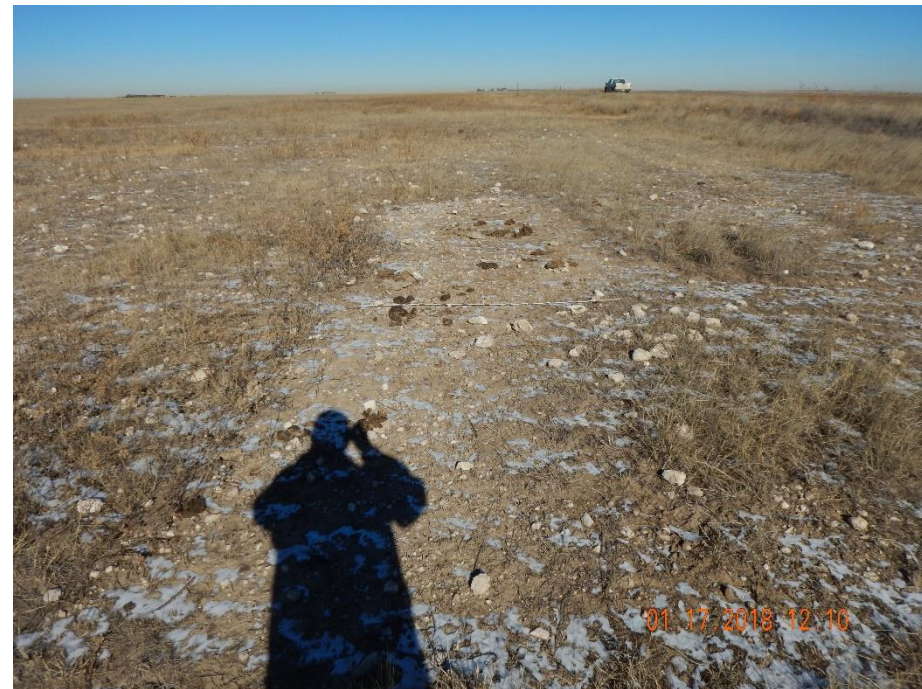
Photo 4: Photo taken from the southeast end of the former pit/facilities location. Photo shows large areas of the location remain predominantly bare and exposed soil. Unable to find evidence that additional reclamation activities have been conducted per corrective actions.