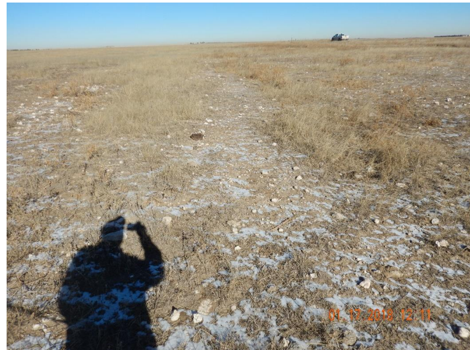
Photo 8: Photo taken from the southwest end of the former pit and facilities location, facing north. Photo shows large areas of the location remain predominantly bare and exposed soil. Unable to find evidence that additional reclamation activities have been conducted per corrective actions.