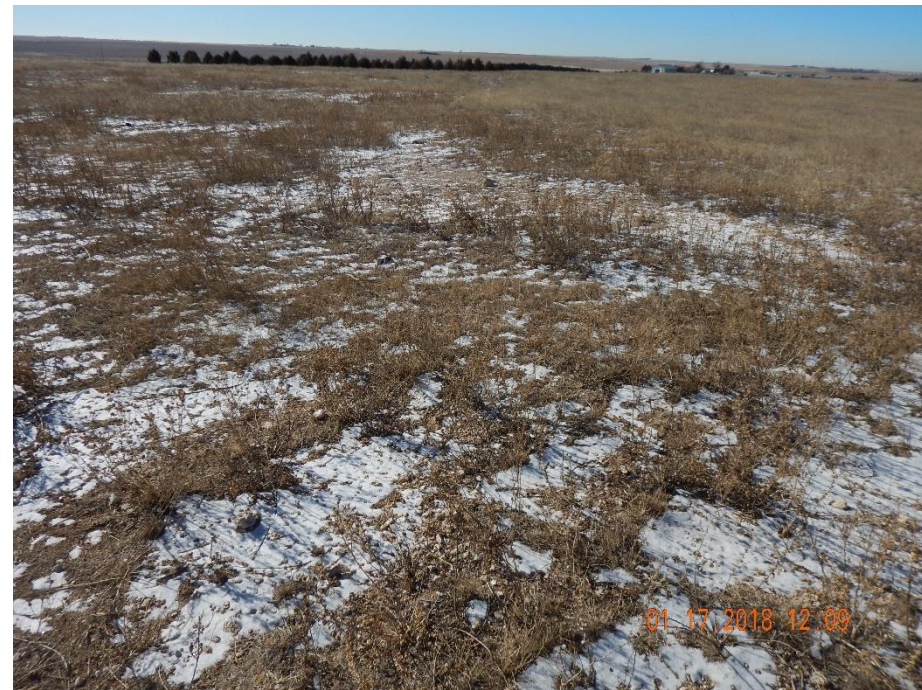
Photo 2: Photo taken from the north end of the former pit and facilities location, facing southwest. Photo shows large areas of the location remain predominantly bare and exposed soil. Unable to find evidence that additional reclamation activities have been conducted per corrective actions.