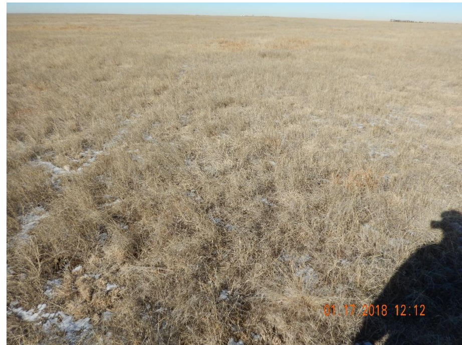
Photo 10: Photo taken from the adjacent reference area to compare vegetative growth and establishment to the disturbance area. Vegetation seen here predominantly sand dropseed, sideoats and blue grama, western wheatgrass, etc...