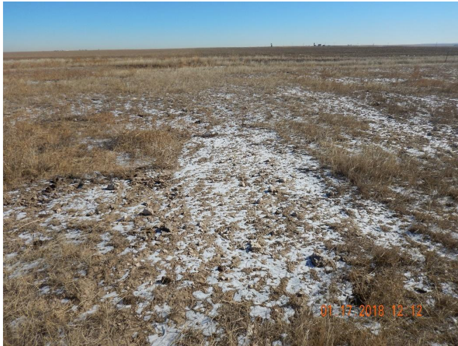
Photo 9: Photo taken from the west end of the former pit and facilities location, facing east. Photo shows large areas of the location remain predominantly bare and exposed soil. Unable to find evidence that additional reclamation activities have been conducted per corrective actions.