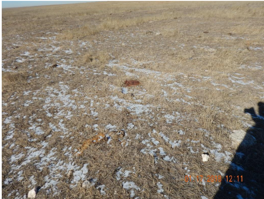
Photo 7: Previous inspection documented debris remaining on the location. Photo shows debris identified in previous inspection has not been removed. Debris appears to be a partially buried barrel.