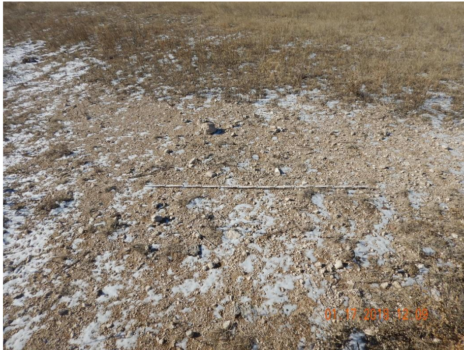
Photo 3: Photo taken from the east end of the former pit/facilities location. Photo shows large areas of the location remain predominantly bare and exposed soil. Unable to find evidence that additional reclamation activities have been conducted per corrective actions. 6 foot measuring stick for reference.