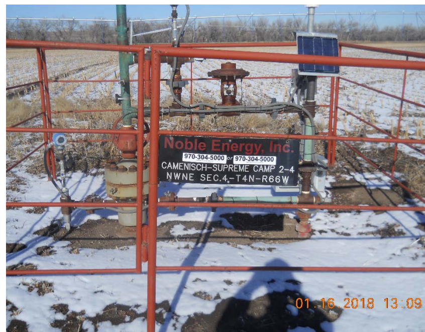
Wellhead looking north. Emergency contact information has been updated