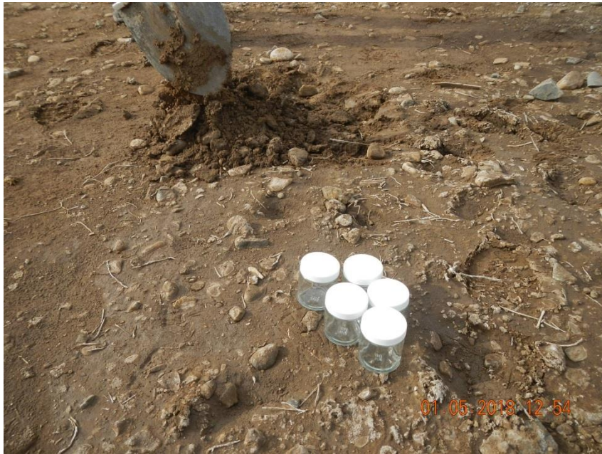
Location of sample collection point, 37.08489/-107.40588.