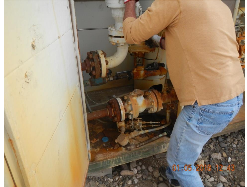
Petrox representative repairing produced water line in separator shack.