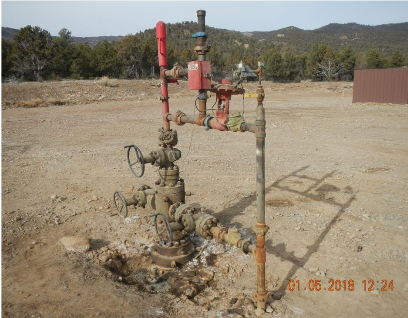
Lark 33-5 #21-4 well head.