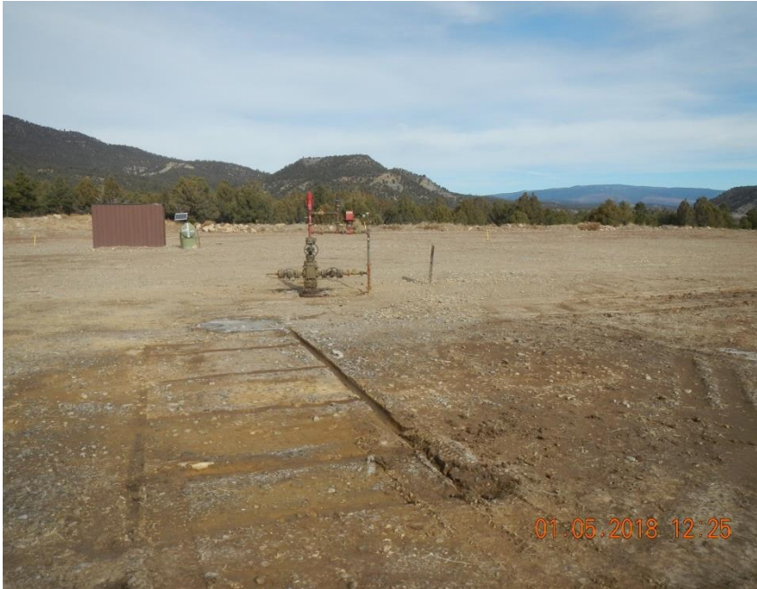
Proximity of release in relation to well head.