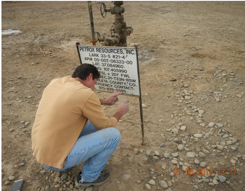
Petrox representative temporarily correcting contact information on well sign.