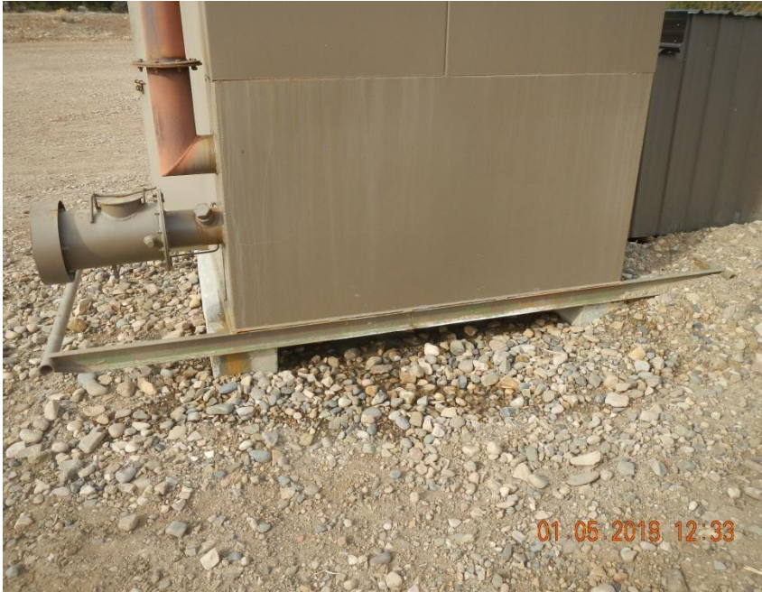
Produced water leaking from separator shack.