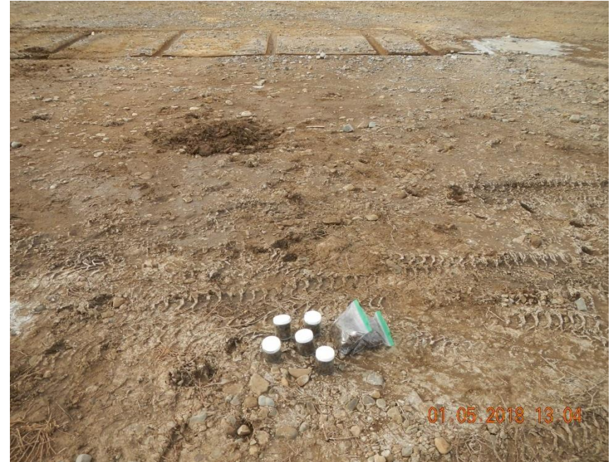
5 – 4 oz. jars and two ziploc bags of impacted material collected by Petrox representative.