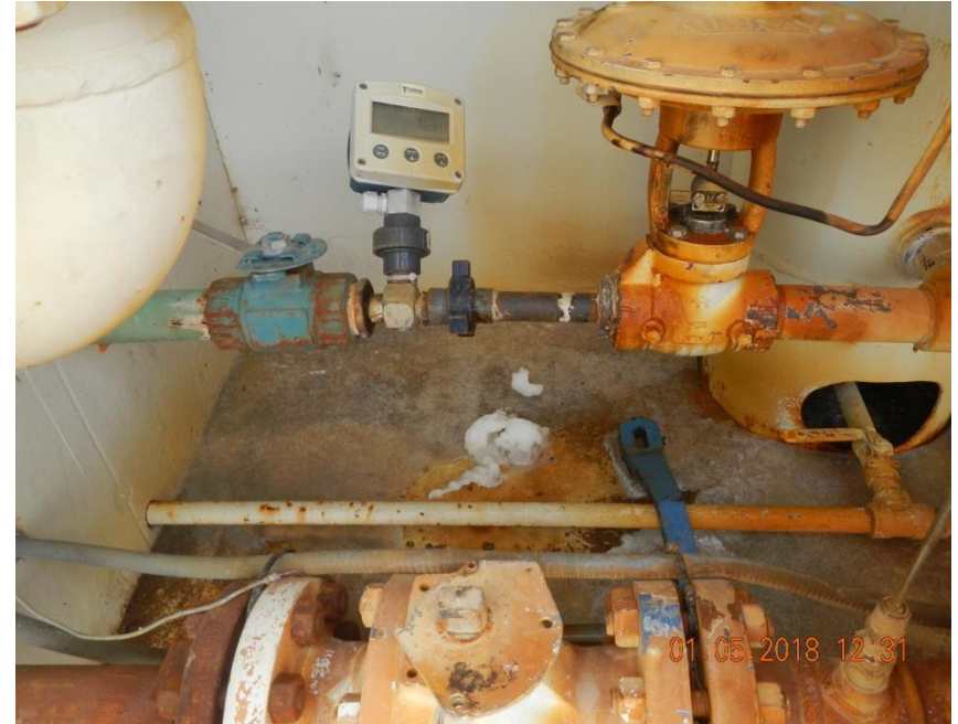
Produced water line leak observed in separator shack.