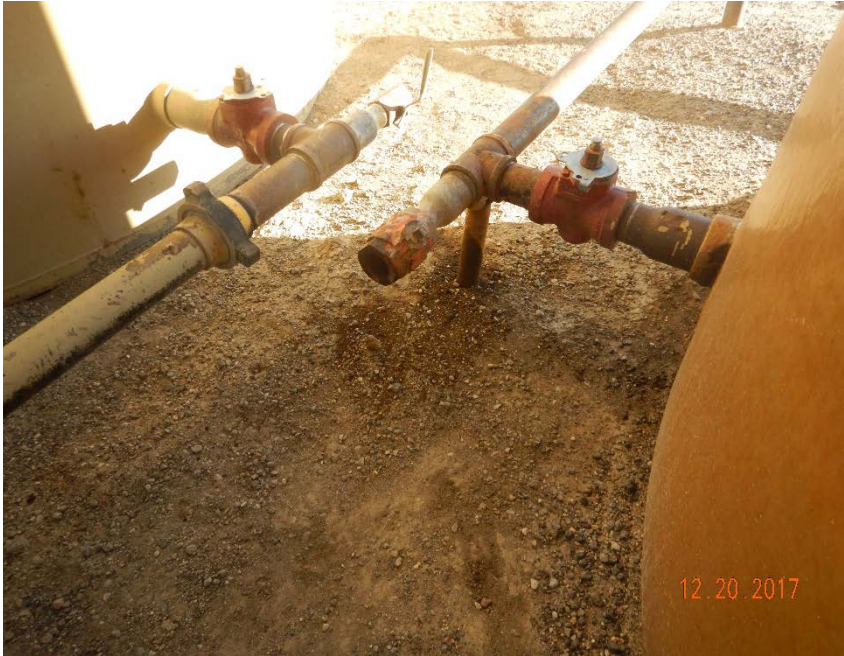
Photo #9 – Improved conditions on north side of produced water AST.