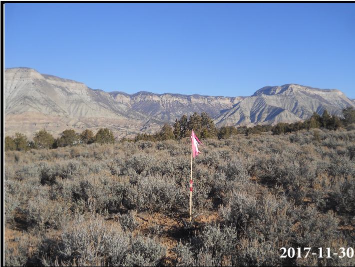
BMC L Looking North