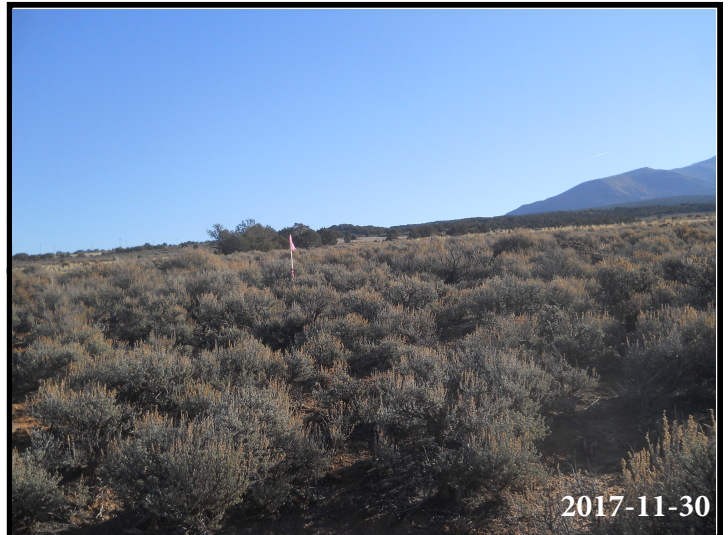
BMC L Looking East