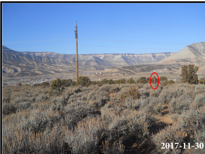
BMC L Looking West