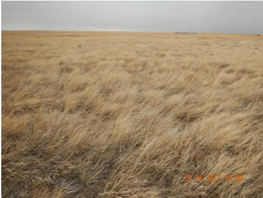
Photo 4. Photo taken from the approximate center of location, facing East. See comments under Photo 2.