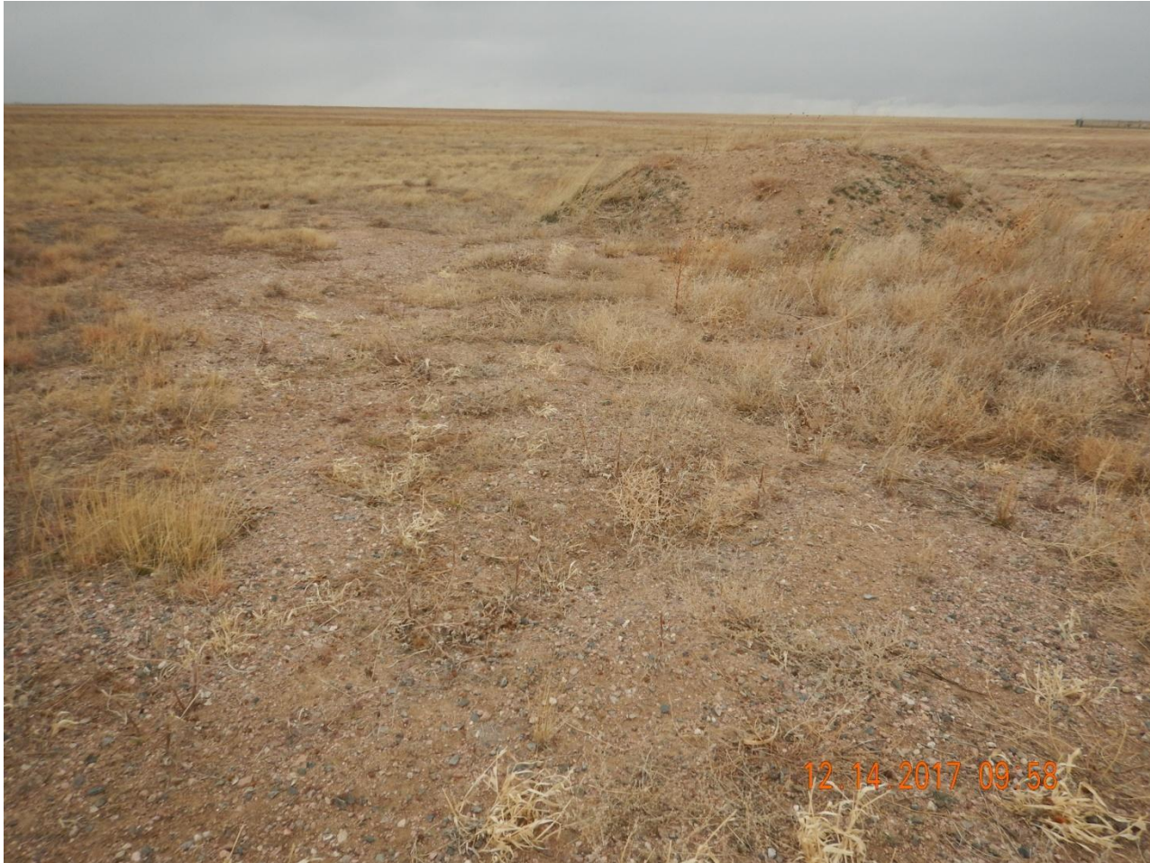
Photo 1. Photo taken from the entrance of the location, facing North. Approach and gravel pile left behind which has not been reclaimed per Rule 1004 standards.