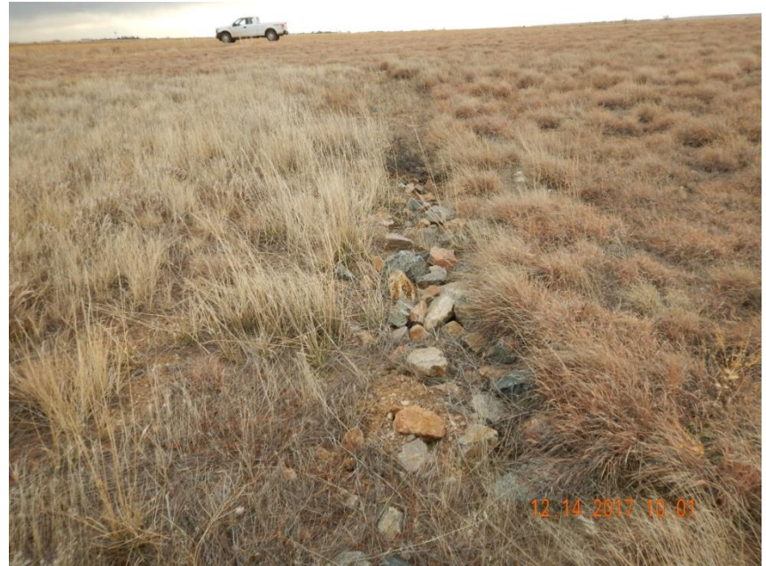
Photo 5. Photo taken from the southwest location, facing South. Operator needs to remove excessive rip-rap material that may have been used as stormwater BMPs.