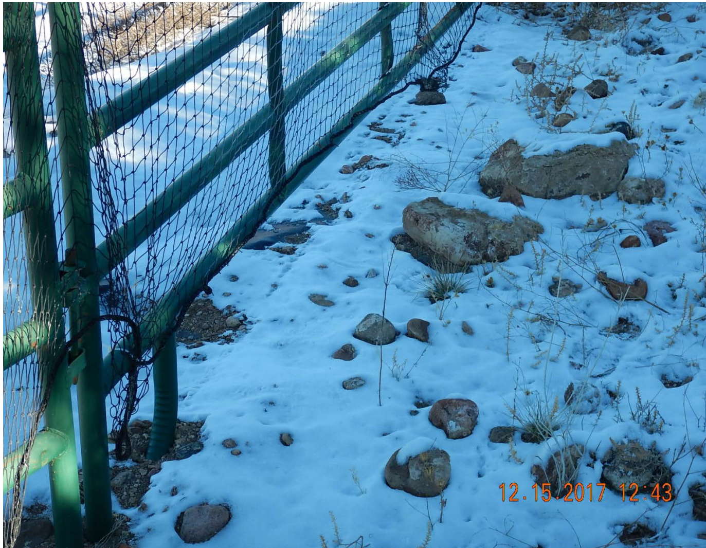
Netting on east side of pit allows wildlife access