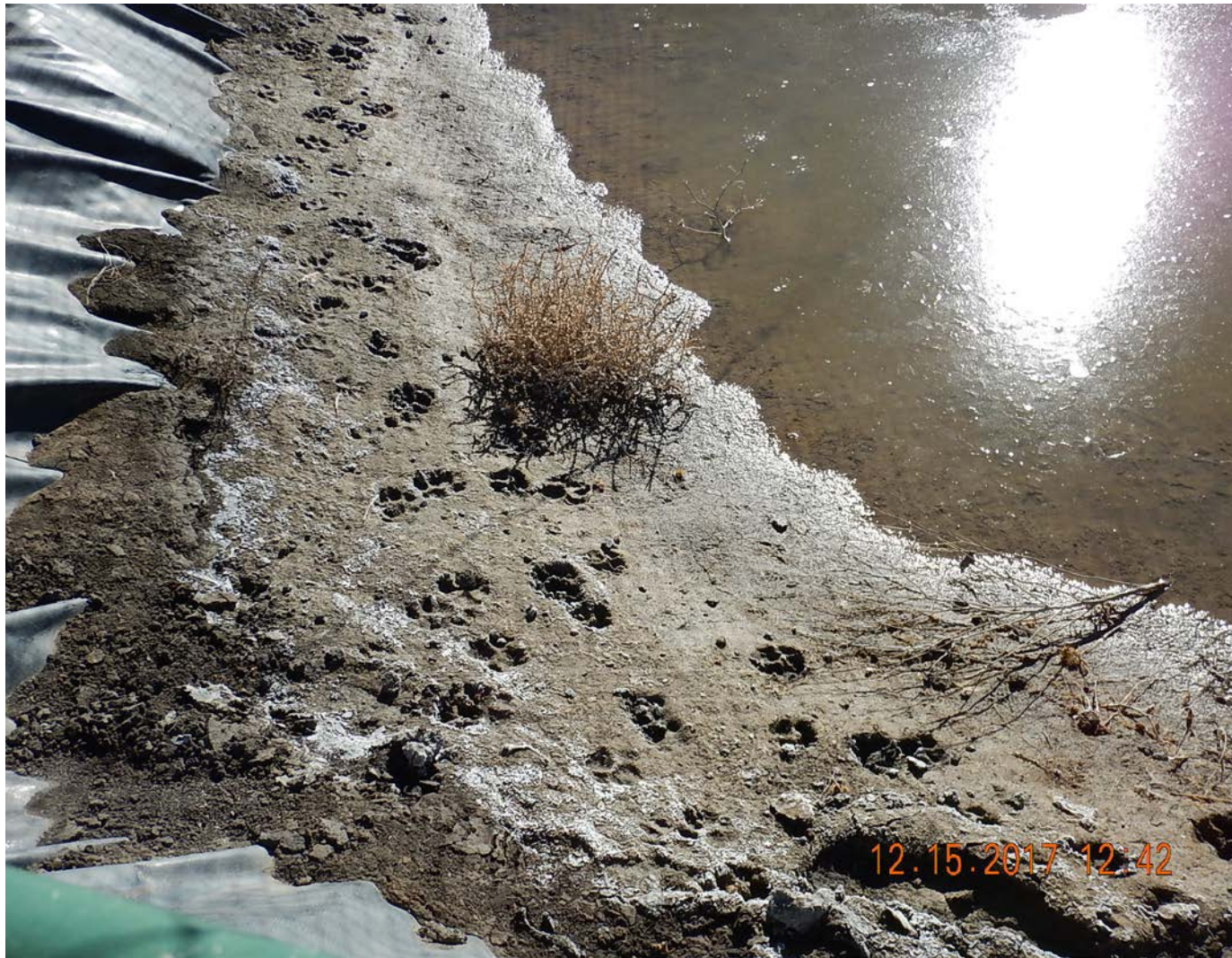
Animal tracks inside pit.