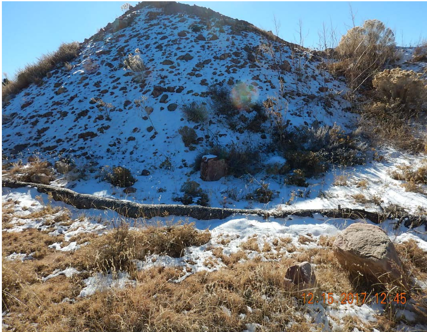
Stormwater BMP's on north side of well pad.