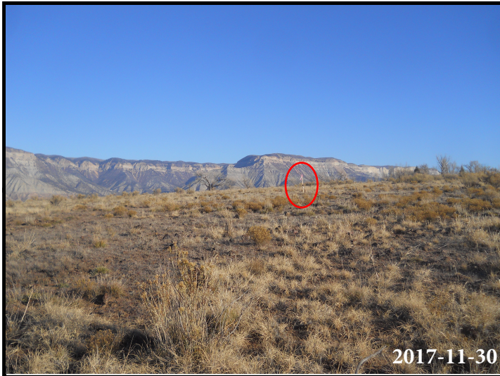
BMC F Looking North