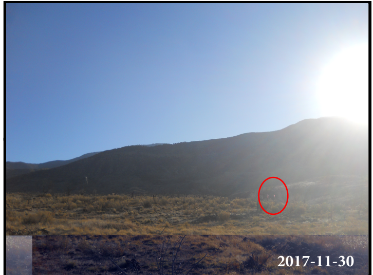
BMC F Looking East