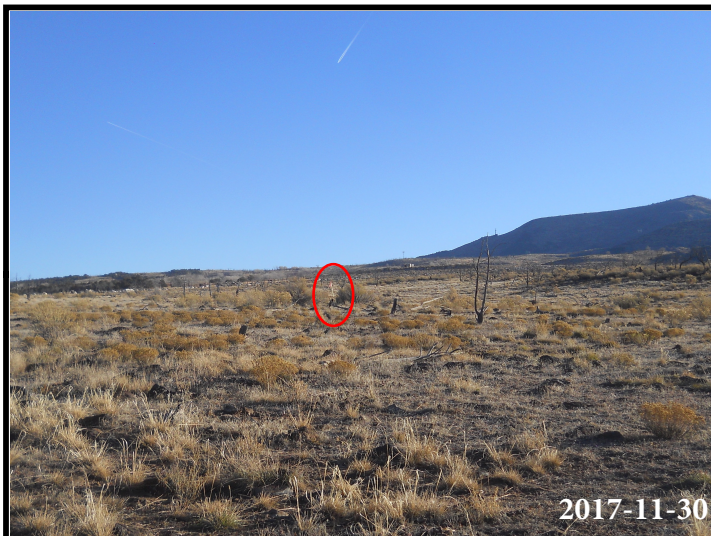
BMC F Looking West