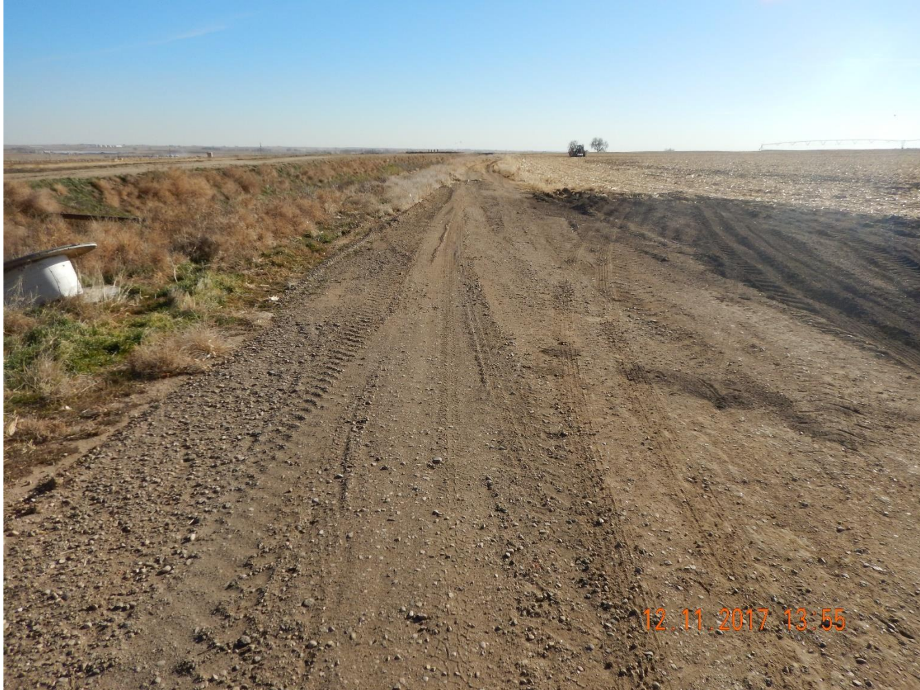
Photo 3: Photo taken from the northeast end of the former tank battery facility, facing south. Photo shows access road leading to the well location has not been reclaimed.