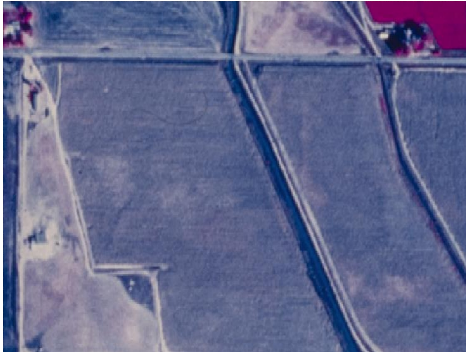
Photo 4: 1984 USGA aerial imagery. Well was SPUD 1986. Photo shows location prior to oil and gas activities. Photo shows access road and battery location did not pre-exist oil and gas activities.