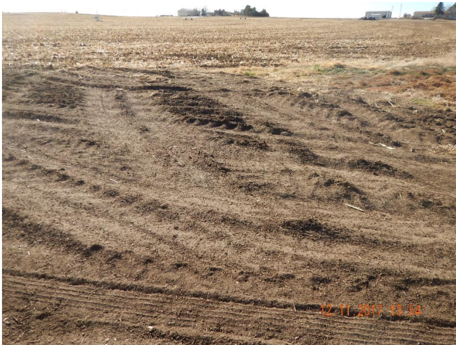
Photo 1: Photo taken from the northeast end of the former tank battery facility, facing west. Photo shows additional reclamation activities have been conducted at the battery.