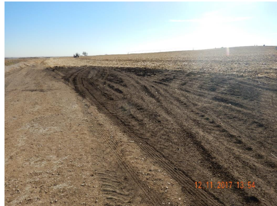
Photo 2: Photo taken from the northeast end of the former tank battery facility, facing southwest. Photo shows additional reclamation activities have been conducted at the battery.