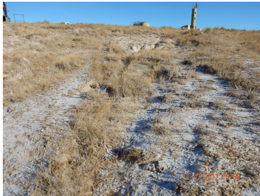
Photo 4: Photo taken from the south of the location (to the east of the produced water pit). See comments under photo 1