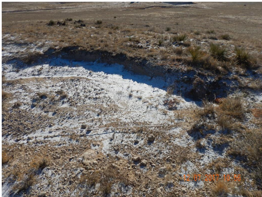
Photo 3: Photo taken from the south end of the location, facing south. See comments under photo 1.