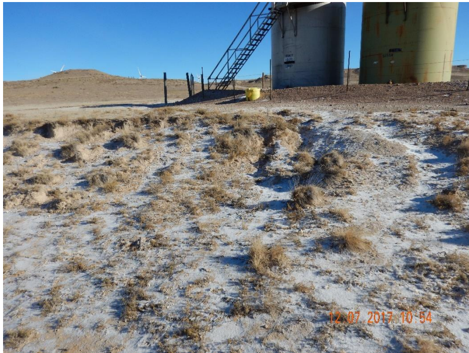
Photo 1: Photo taken from the location, facing northeast. Photo shows areas of erosion degradation. Erosion has not been repaired or stabilized and no BMPs have been installed or maintained per corrective actions.