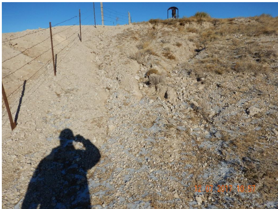
Photo 5: Photo taken from the south of the location (to the east of the produced water pit). See comments under photo 1