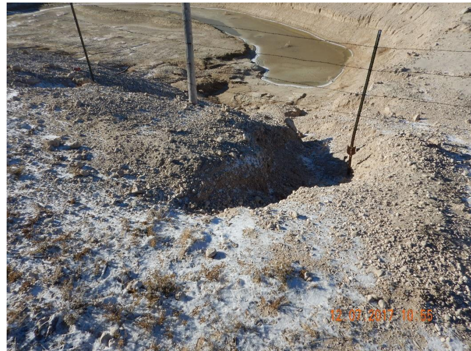
Photo 2: Photo taken from the east end of the produced water pit. See comments under photo 1.