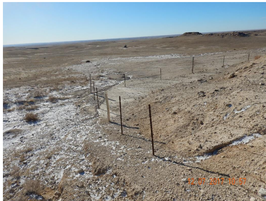
Photo 6: Photo taken from the southeast end of the produced water pit, facing south. Photo shows areas of erosion degradation on the adjacent lands due to runoff and salt kill. Photo shows no remediation activities appear to have been conducted, and no stabilization and stormwater BMPs have been installed or maintained per the corrective actions.