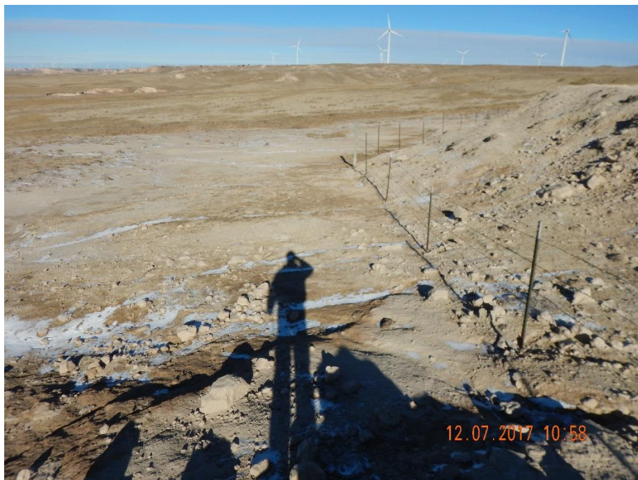
Photo 7: Photo taken from the southwest end of the produced water pit, facing north. See comments under photo 6