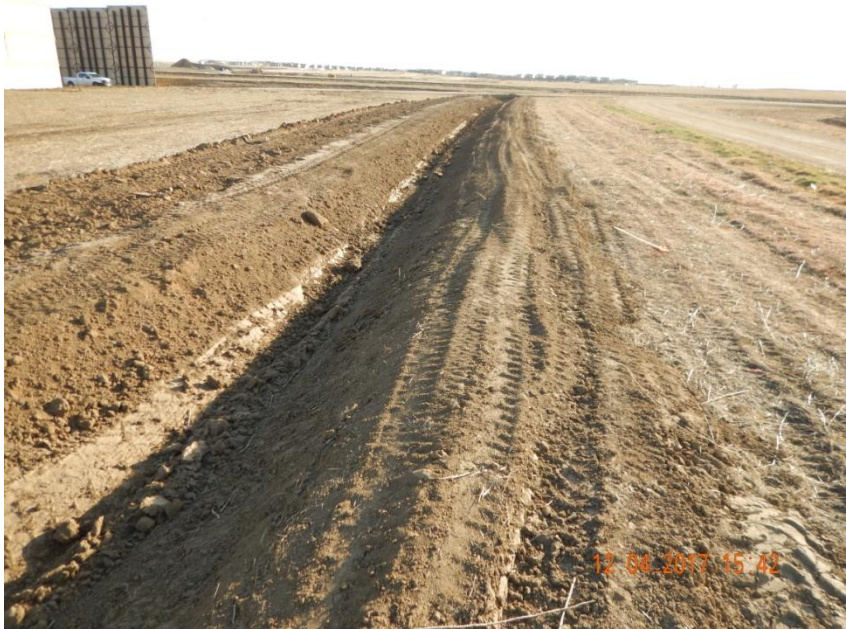
Photo 11. Photo taken from the western location of the east pad, facing South. See comments under Photo 2.