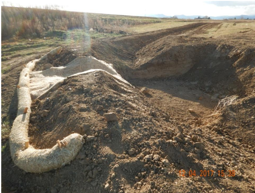
Photo 5. Photo taken from the southeast location of the east pad, facing West. Sediment trap installed with a stabilized outlet device.