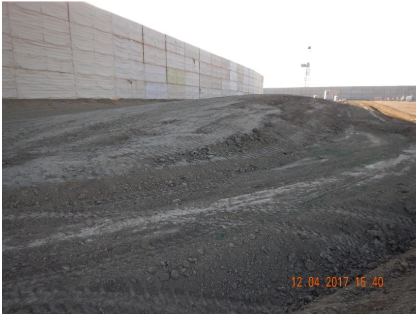
Photo 7. Photo taken from the northeast location of the east pad, facing West. See comments under Photo 2. Appears topsoil has been salvaged and stored along the northern perimeter of the location.