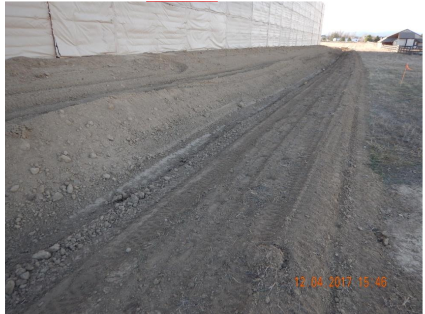
Photo 14. Photo taken from the northern location of the west pad, facing West. See comments under Photo 2.