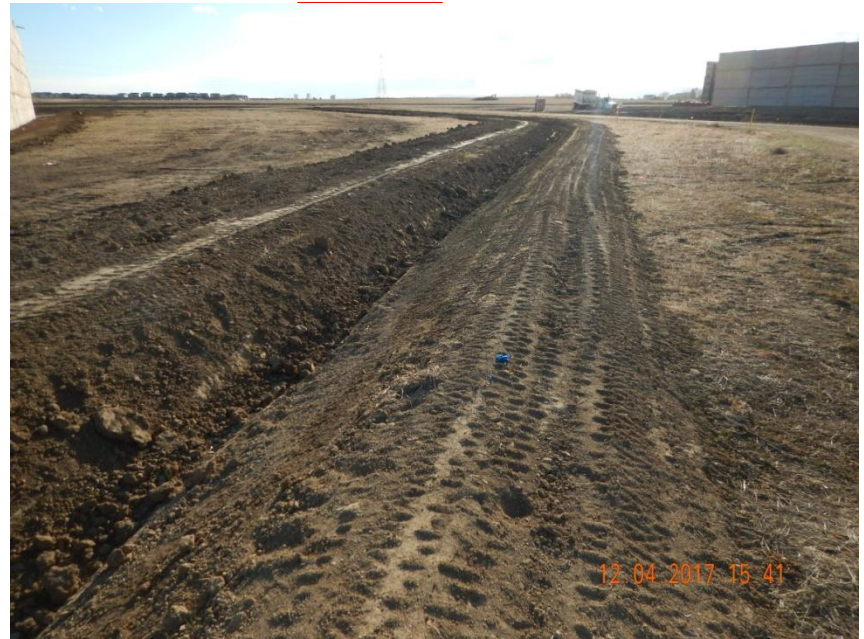
Photo 10. Photo taken from the northwest location of the east pad, facing Southwest. See comments under Photo 2.