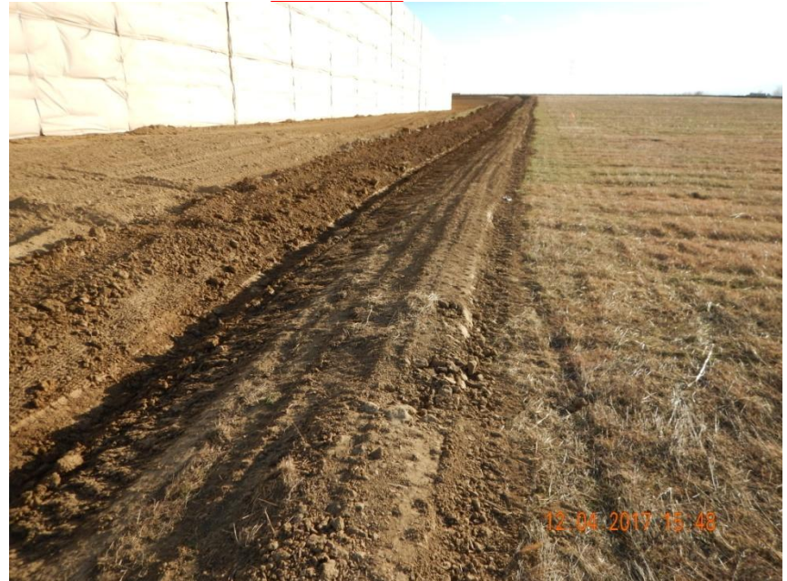
Photo 16. Photo taken from the western location of the west pad, facing South. See comments under Photo 2.