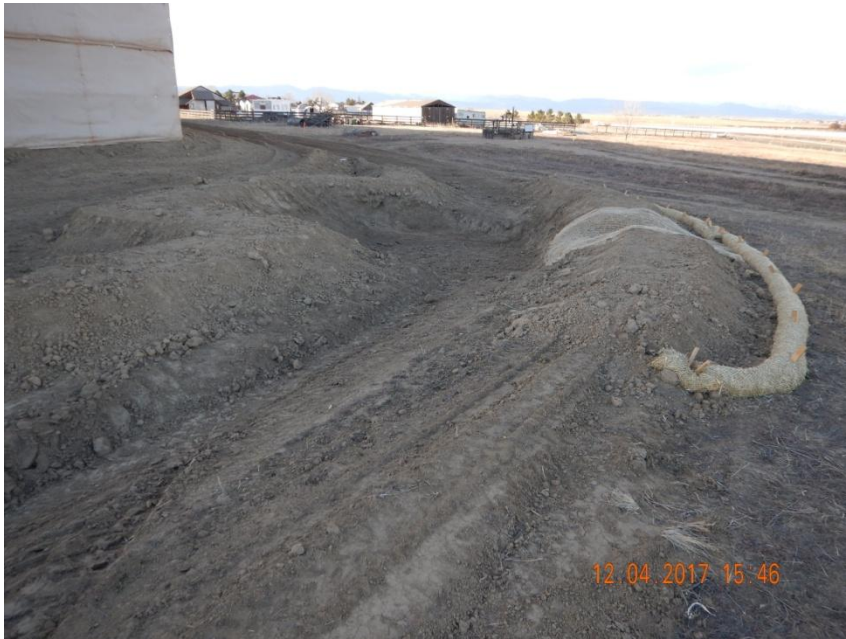
Photo 13. Photo taken from the northeast location of the west pad, facing Northwest. See comments under Photo 5.