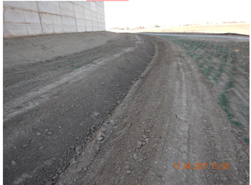
Photo 6. Photo taken from the southeastern location of the east pad, facing North. See comments under Photo 2.