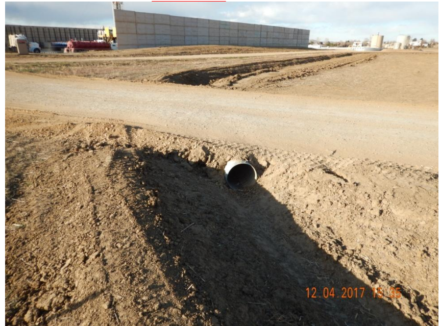
Photo 2. Photo taken from the southwest location of the east pad, facing North. Ditch and berm BMP installed around the perimeter of the location.