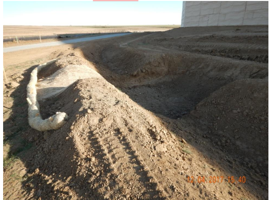
Photo 8. Photo taken from the northeast location of the east pad, facing Southeast. See comments under Photo 5.