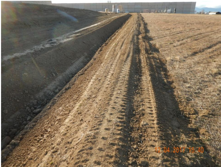
Photo 9. Photo taken from the northern location of the east pad, facing West. See comments under Photo 2.