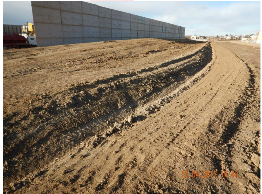
Photo 12. Photo taken from the southeast location of the west pad, facing North. See comments under Photo 2. Appears topsoil has been salvaged and stored along the eastern perimeter of the location.