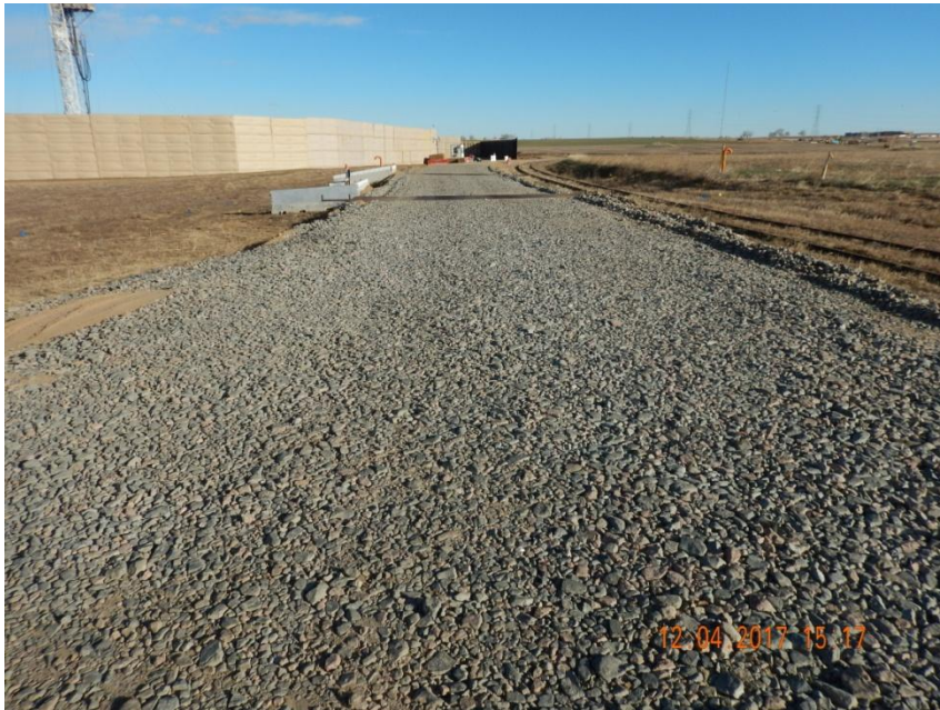
Photo 1. Photo taken from the entrance of the location, facing East. Tracking pad device has been installed.