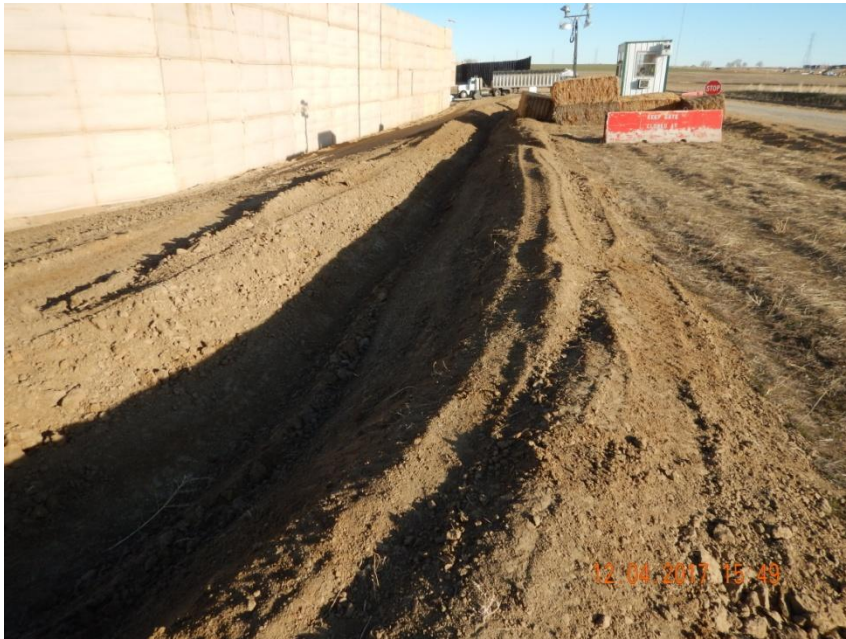
Photo 17. Photo taken from the southwest location of the west pad, facing East. See comments under Photo 2.