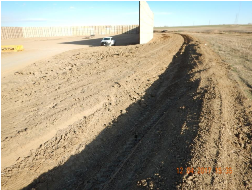
Photo 3. Photo taken from the southwest location of the east pad, facing East. See comments under Photo 2.