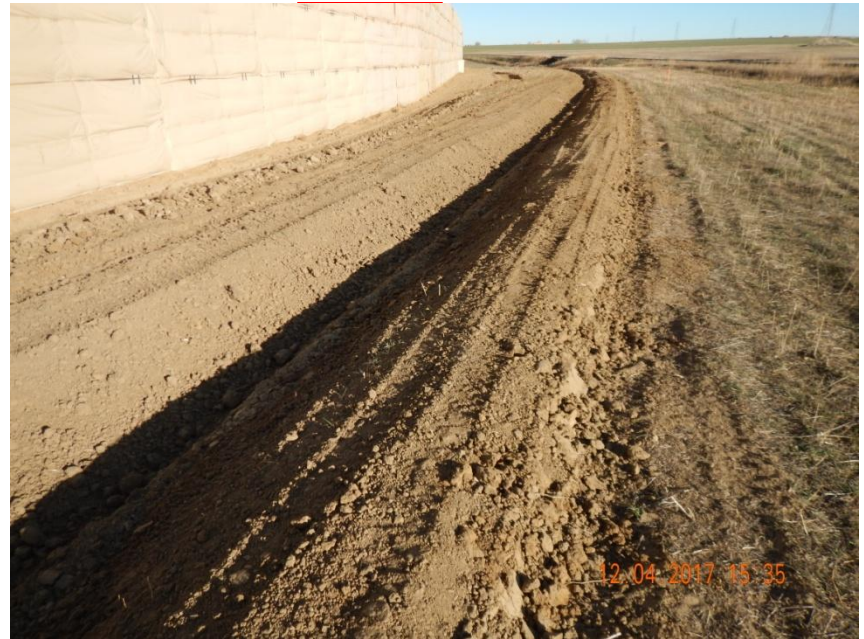
Photo 4. Photo taken from the southern location of the east pad, facing East. See comments under Photo 2.