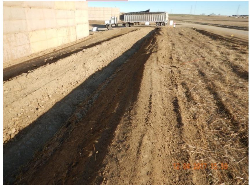
Photo 18. Photo taken from the southern location of the west pad, facing East. See comments under Photo 2.