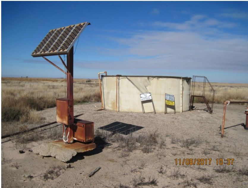
7. Water tank with no berms or labeling