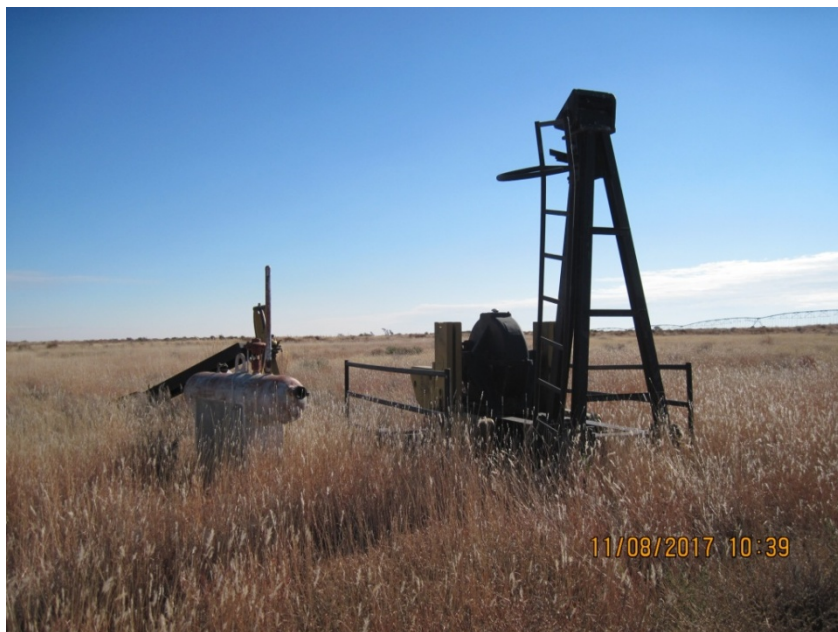
5. Unused equipment