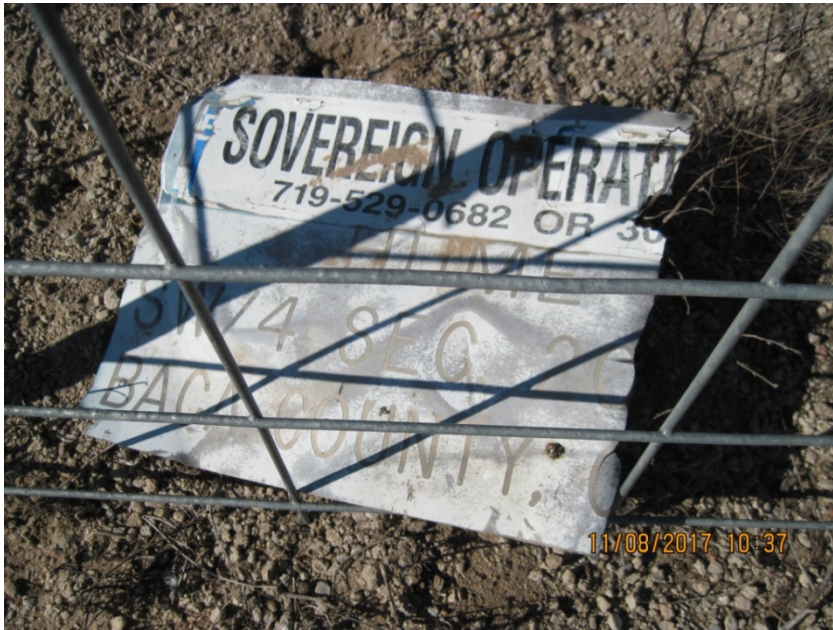
1. Inadequate lease sign