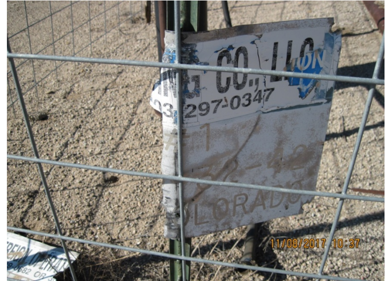
2. Other half of Inadequate lease sign