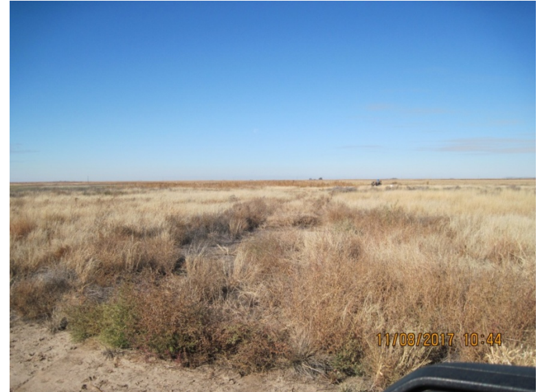
4. Access covered with weeds