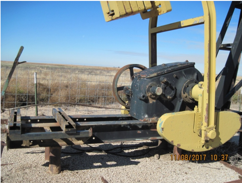
3. Unit without a prime mover