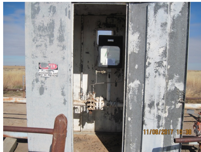
6. Meter shed