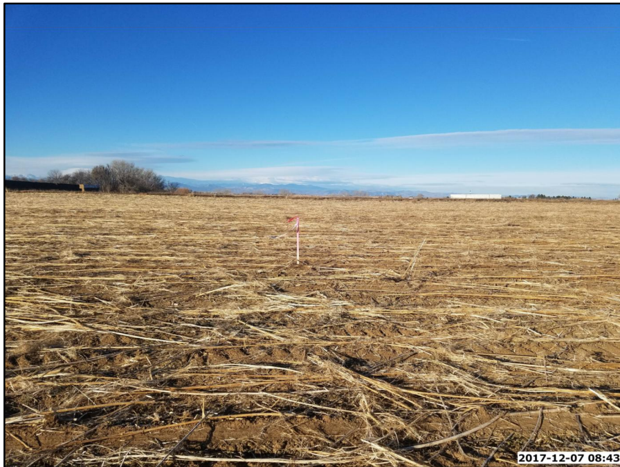
PICTURE OF HARVESTERS STATE 7-15 PAD FACILITY PAD LOCATION - CAMERA ANGLE WEST

FACILITY PAD LOCATION PICTURES LOCATED IN SECTION 15 T6N, R66W, 6TH P.M. WELD COUNTY, COLORADO