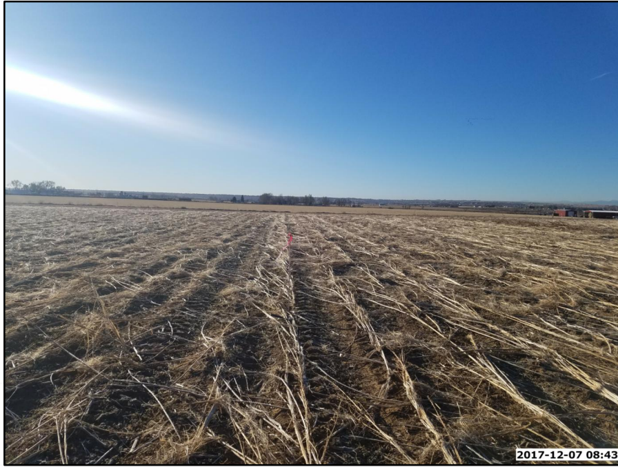
PICTURE OF HARVESTERS STATE 7-15 PAD FACILITY PAD LOCATION - CAMERA ANGLE SOUTH