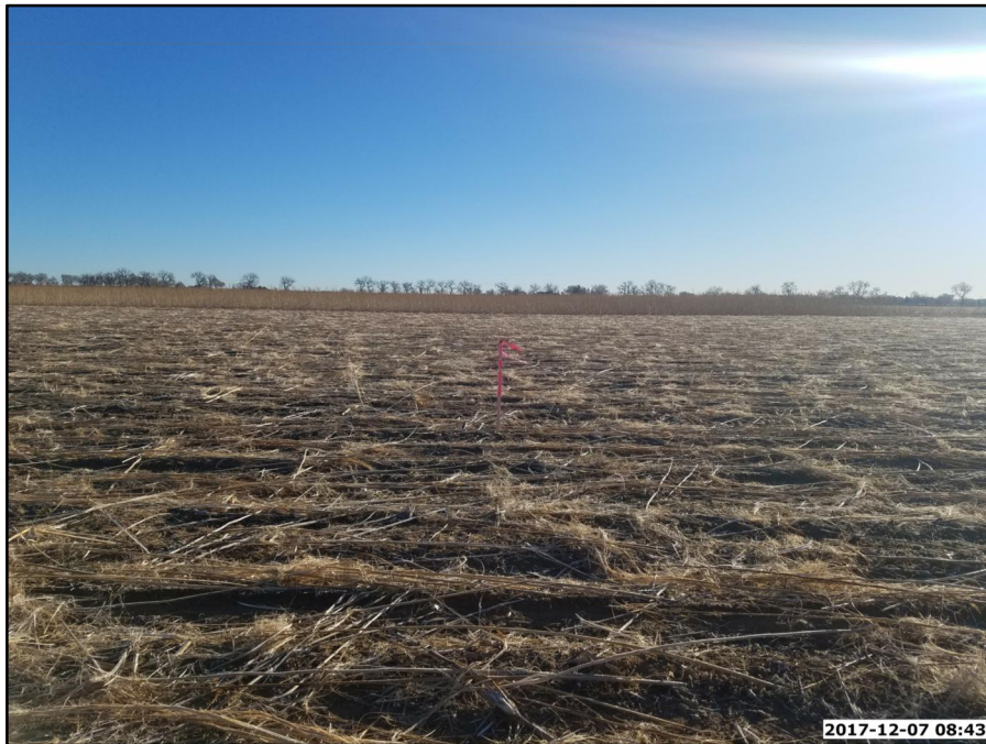
PICTURE OF HARVESTERS STATE 7-15 PAD FACILITY PAD LOCATION - CAMERA ANGLE EAST

FACILITY PAD LOCATION PICTURES LOCATED IN SECTION 15 T6N, R66W, 6TH P.M. WELD COUNTY, COLORADO