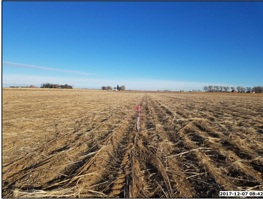
PICTURE OF HARVESTERS STATE 7-15 PAD FACILITY PAD LOCATION - CAMERA ANGLE NORTH