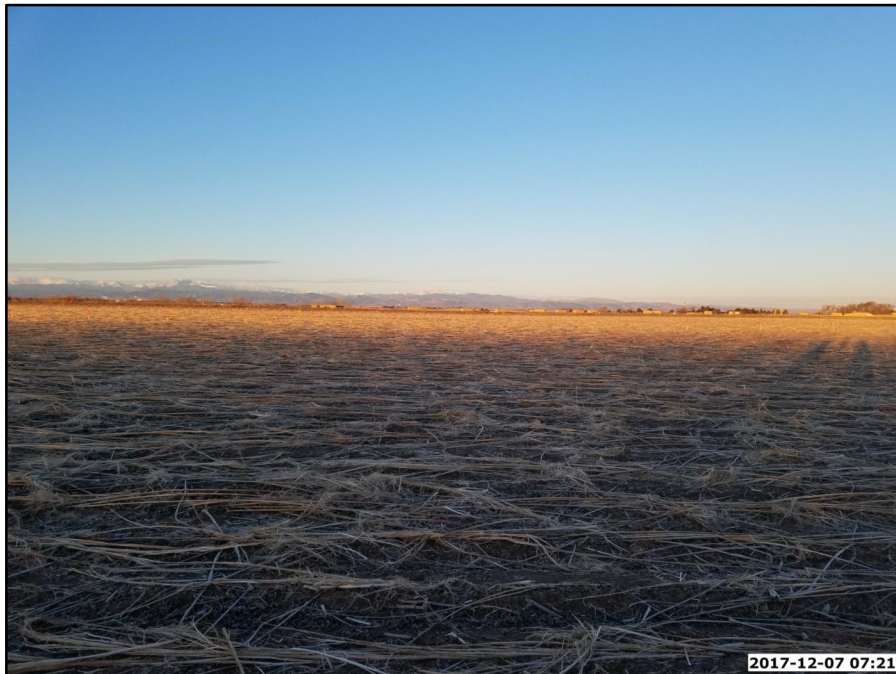
PICTURE OF HARVESTERS STATE 7-15 PAD WELL PAD LOCATION - CAMERA ANGLE WEST