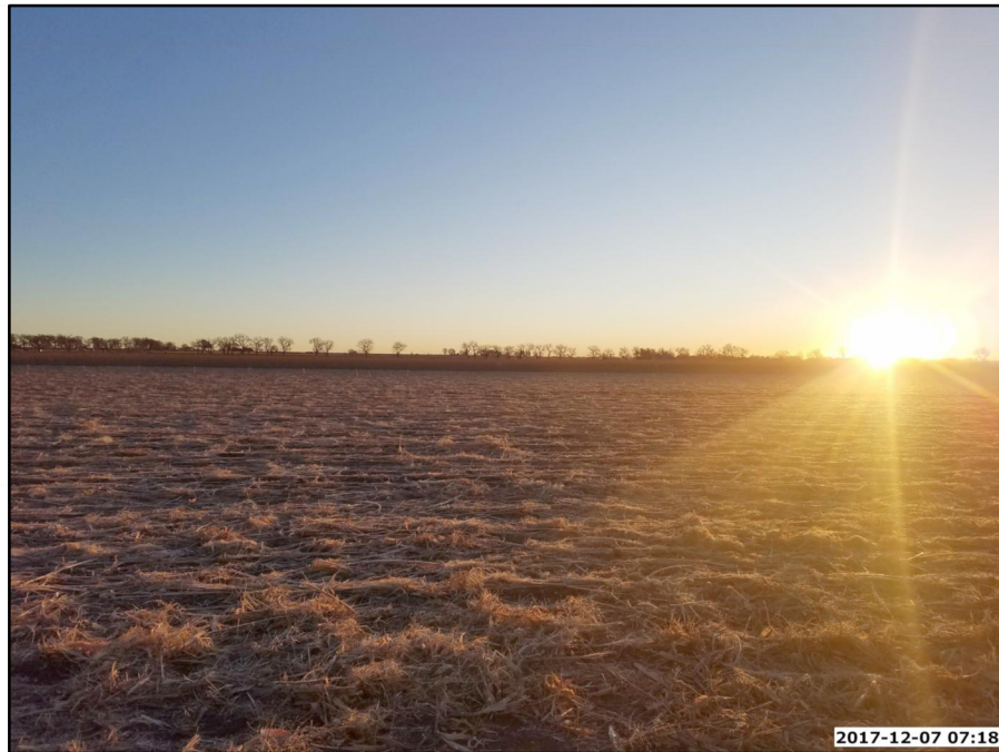
PICTURE OF HARVESTERS STATE 7-15 PAD WELL PAD LOCATION - CAMERA ANGLE EAST