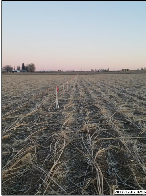
PICTURE OF HARVESTERS STATE 7-15 PAD WELL PAD LOCATION - CAMERA ANGLE NORTH