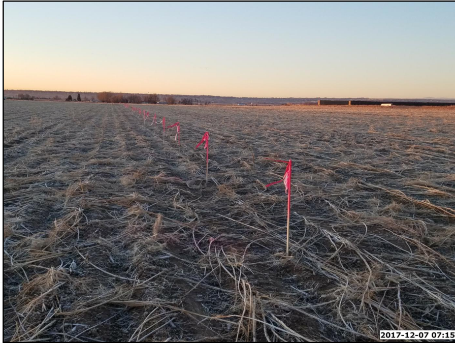
PICTURE OF HARVESTERS STATE 7-15 PAD WELL PAD LOCATION - CAMERA ANGLE SOUTH