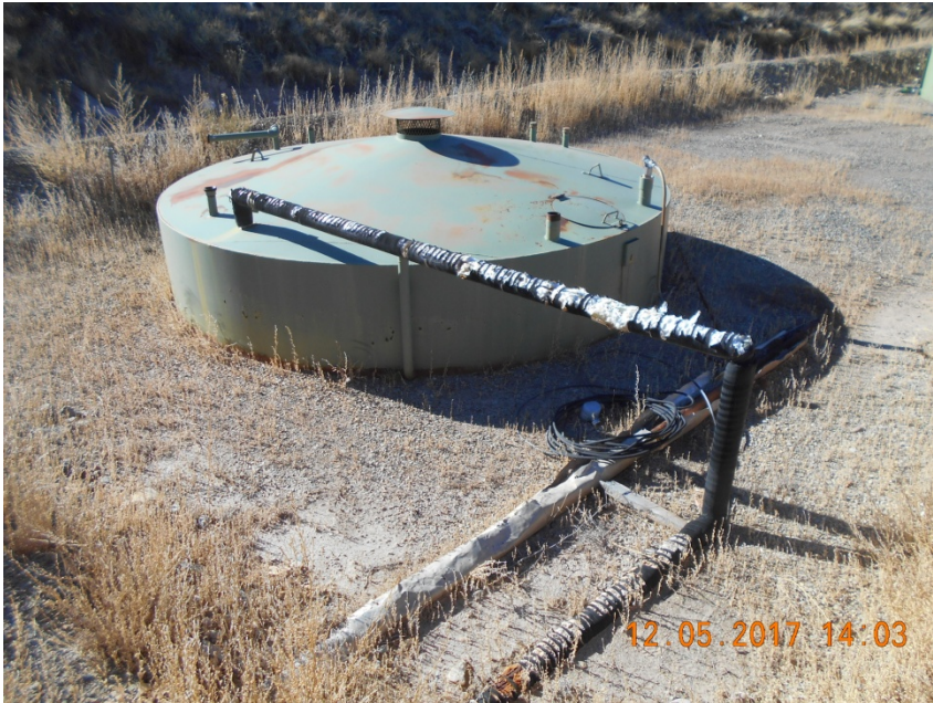
Condensate tank with no labels/placards. Inlet ports without plugs