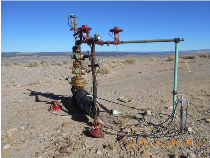
FOSSIL FEDERAL #5-19 Wellhead with junk equipment.