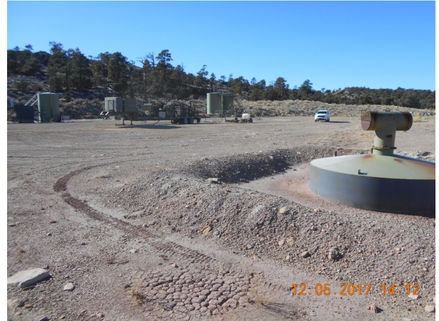
Overview of location looking SW.