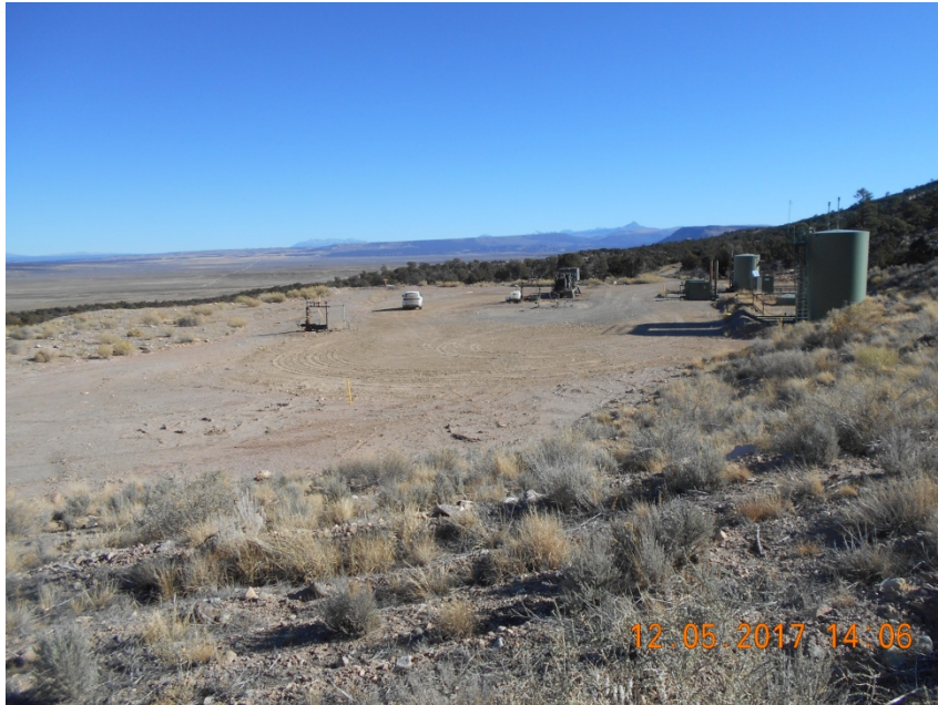
Overview of location looking E.

PARADOX UPSTREAM LLC - 10453 API # 05-113-06069 FOSSIL FEDERAL #5 API # 05-113-06120 FOSSIL FEDERAL #5-19 Inspection Date : 12/05/2017