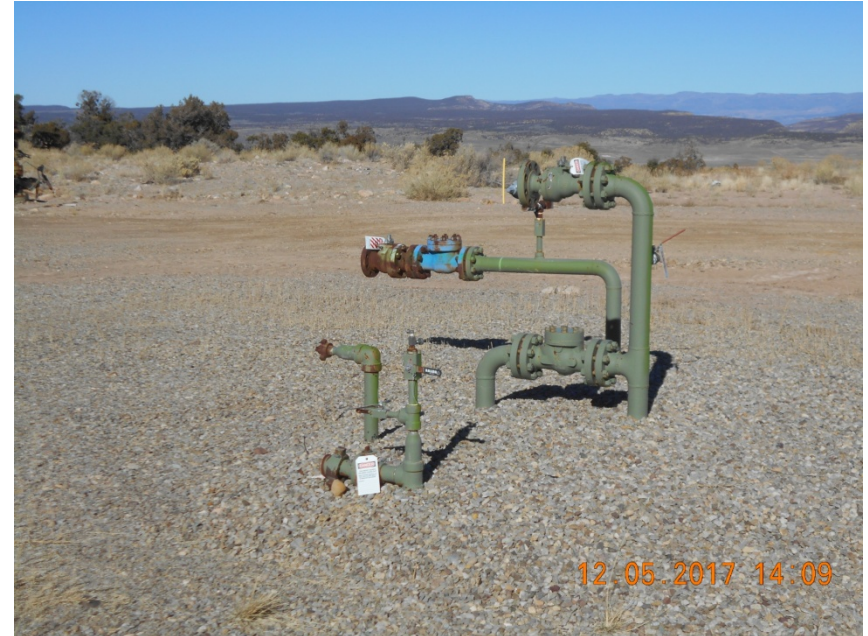
2" & 3" riser cluster. Locked out/Tagged out.