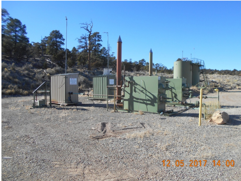
Separators and meter housings.