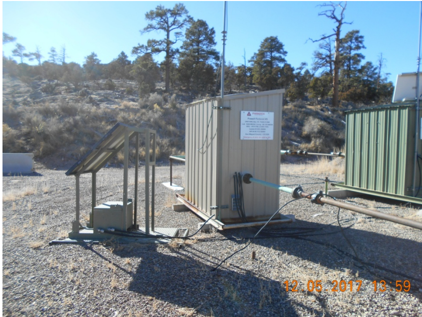
Sign on meter housing