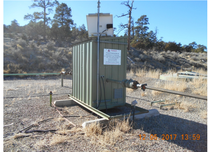
Sign on meter housing