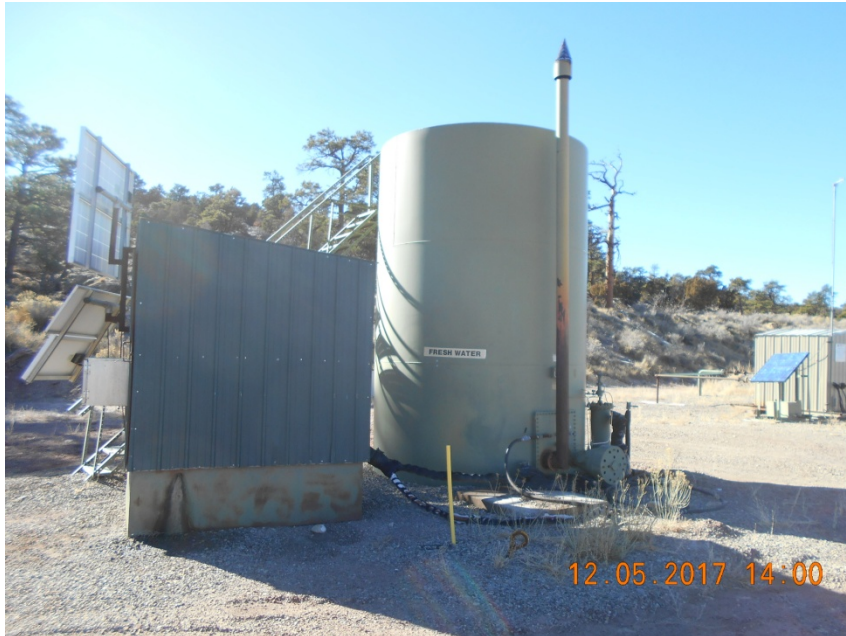
Heated freshwater tank.