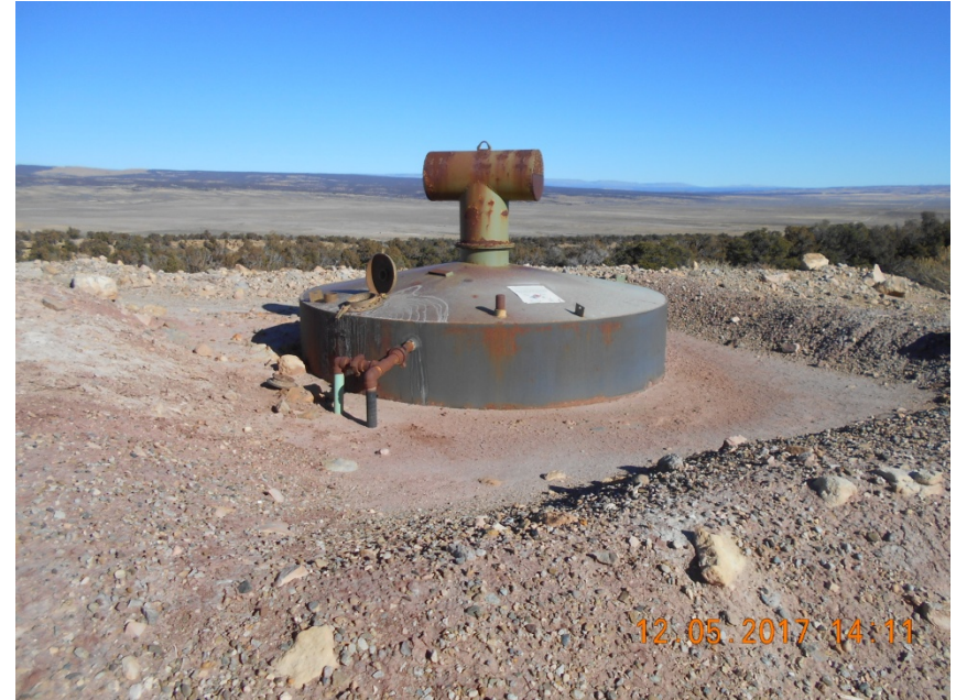
Condensate tank with gauge hatch open and inlet port unplugged.