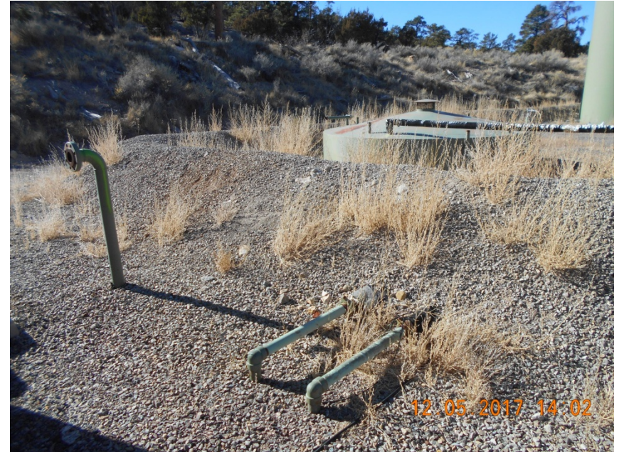
Unused/unmarked riser on E side of tank berms.