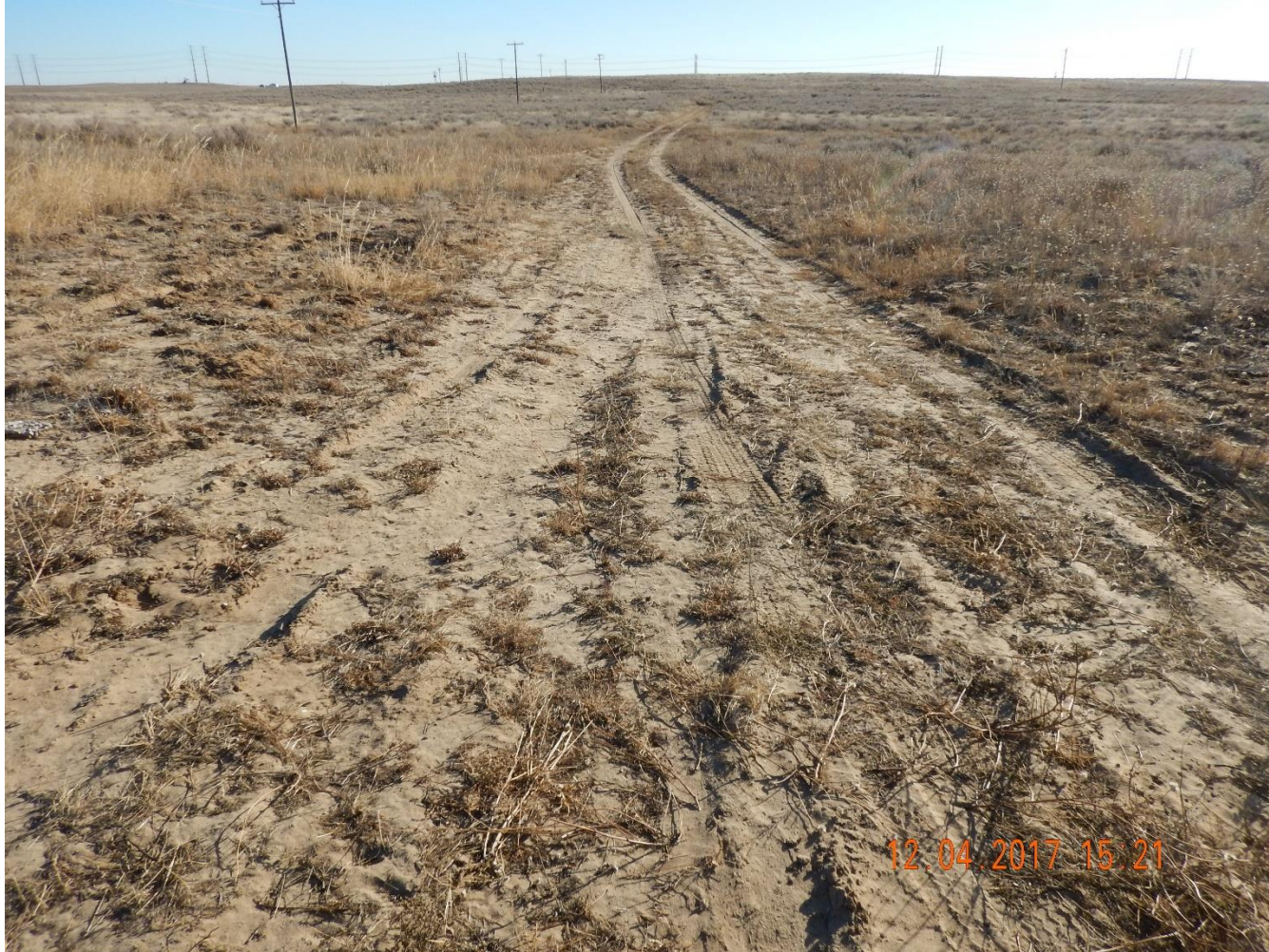
Photo 3: Photo taken from the well location facing south. Previous inspection required operator to perform reclamation on the access road. Photo shows no reclamation activities have been conducted on access road.