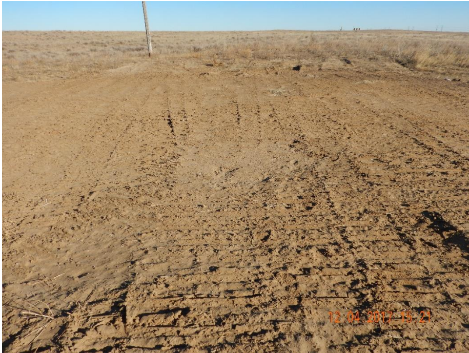
Photo 1: Photo taken from the well location, facing east. Photo shows pump unit has been removed per corrective actions. Previous inspections also required operator to perform revegetation activities and ensure seeded soil is stabilized. Unable to find evidence that reseeded or additional reclamation activities have been conducted.