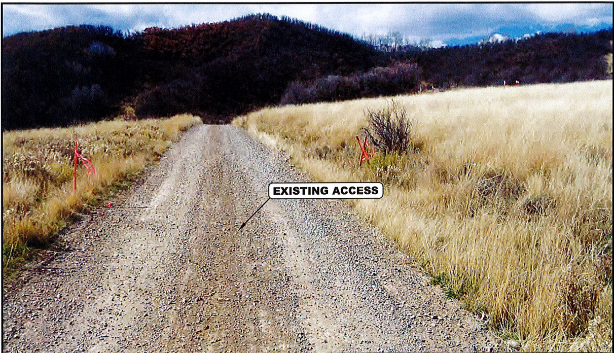
PHOTO: VIEW OF EXISTING ACCESS