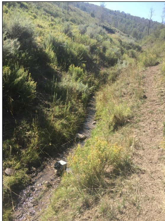
Photo 2. Getty Spring 6D Sampling Location; view downstream (Getty 6D)