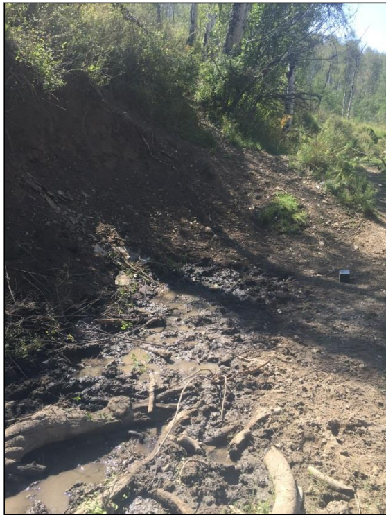
Photo 4. Getty Spring 6E Sampling Location; view downstream (Getty 6E)