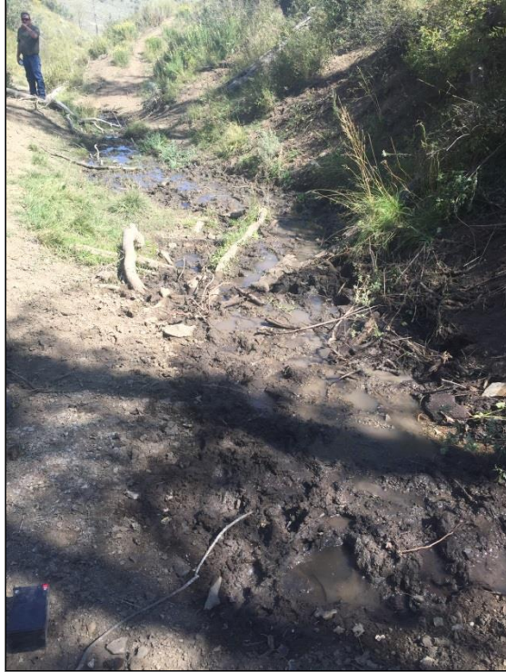
Photo 3. Getty Spring 6E Sampling Location; view upstream (Getty 6E)