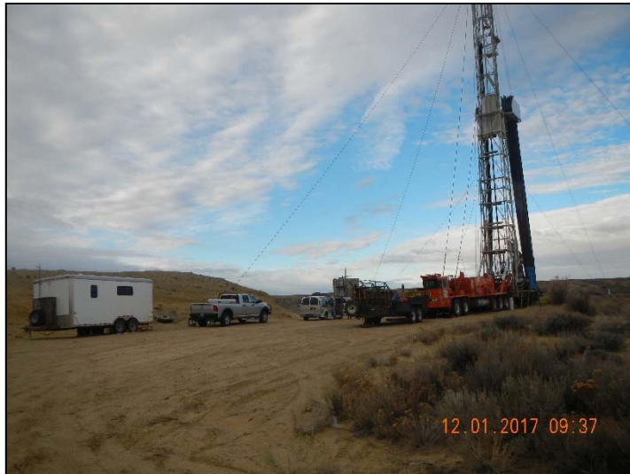
Photo 1. Overview of location taken at entrance facing southwest.