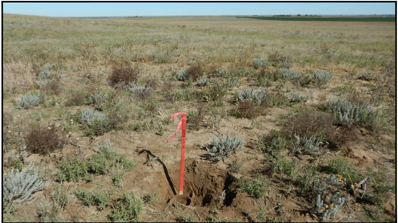
PHOTO: VIEW OF DRILLED AND ABANDONED LOCATION