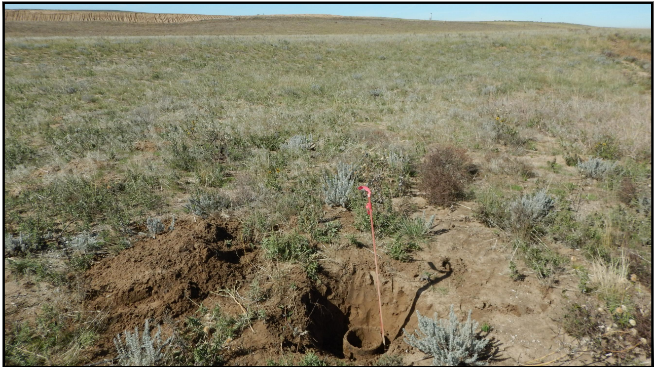
PHOTO: VIEW OF DRILLED AND ABANDONED LOCATION