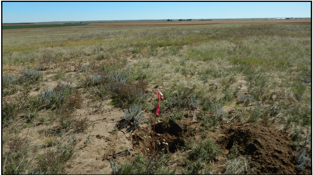
PHOTO: VIEW OF DRILLED AND ABANDONED LOCATION