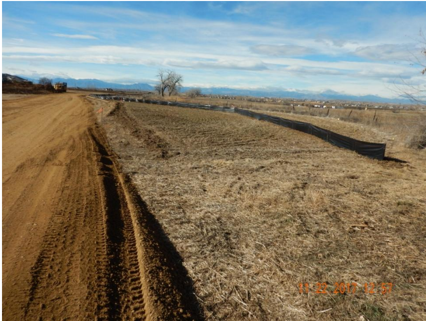
Photo 11. Photo taken from the northeast location, facing West. Operator has installed silt fence BMP, except along the southeastern and southwest portion, in conjunction with a ditch around the perimeter of the location.