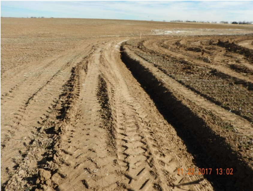
Photo 13. Photo taken from the southeastern location, facing East. The southeastern perimeter of the location only has a ditch BMP.