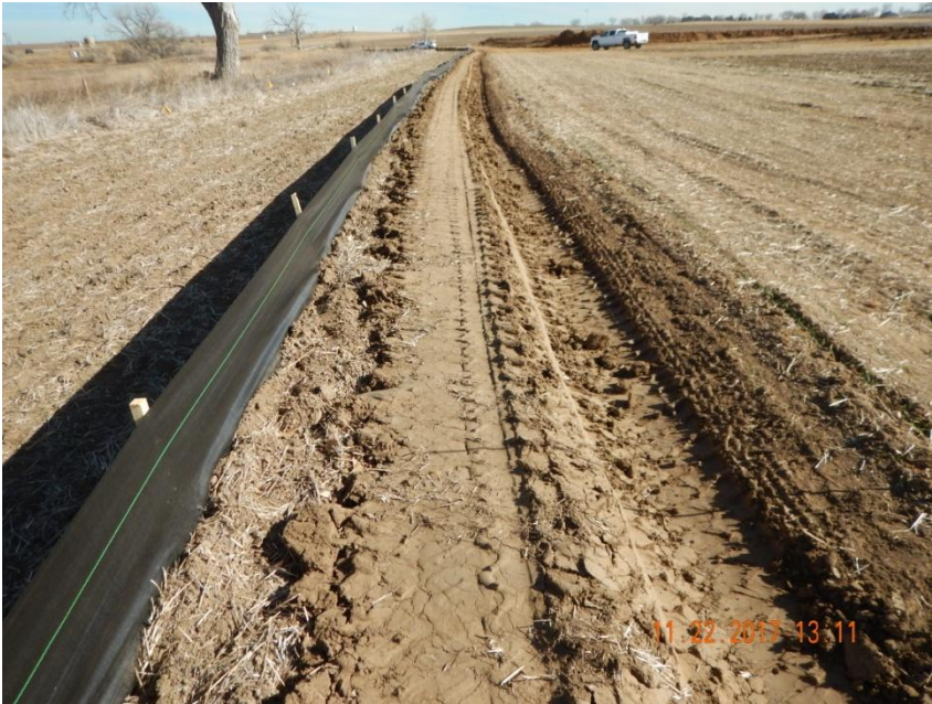
Photo 19. Photo taken from the northwestern location, facing East. See comments under Photo 11.