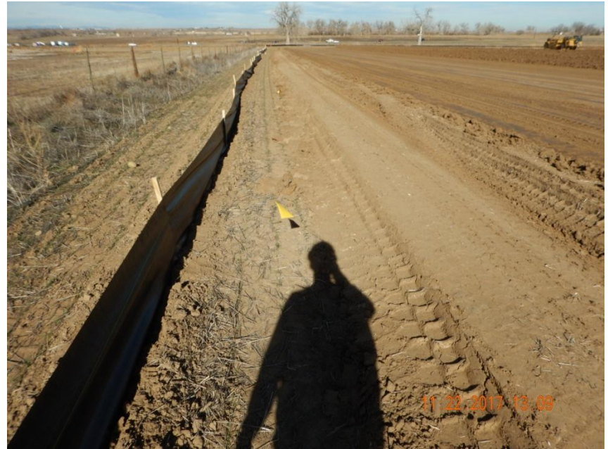
Photo 18. Photo taken from the western location, facing North. See comments under Photo 11.