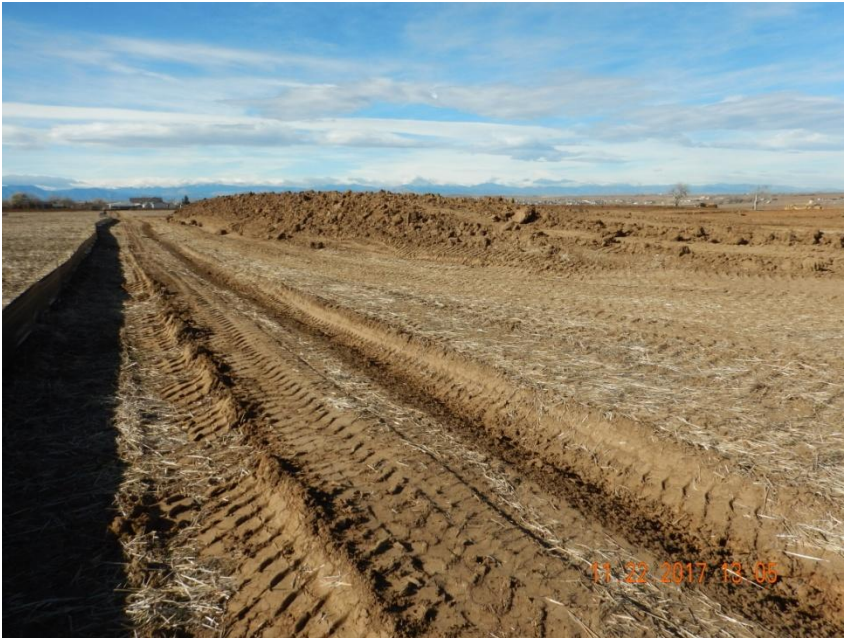
Photo 15. to taken from the southern location, facing West. See comments under Photo 11.