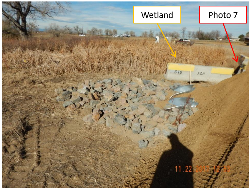
Photo 5. Photo taken from the north culvert along the west-side of the access road, facing North. Operator installed an outlet device (rip-rap). Operator needs additional BMPs to protect sediment discharge into the wetland along the western access road.