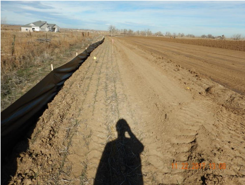
Photo 17. Photo taken from the southwest location, facing North. See comments under Photo 11.