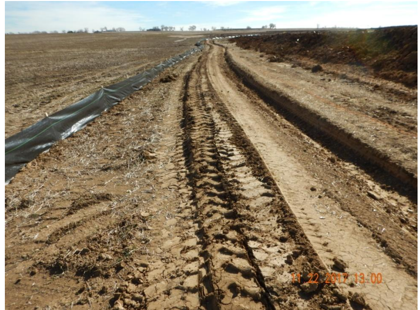
Photo 12. Photo taken from the northeast location, facing South. See comments under Photo 11.