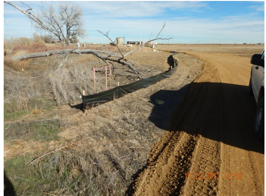
Photo 8. Photo taken along the southern portion of the access road, facing Northeast. Operator has installed silt fence along portions of the downgradient slope of the access road. Operator may need to install more silt fence or additional BMPs along portions where there is no BMP along the downgradient slope.