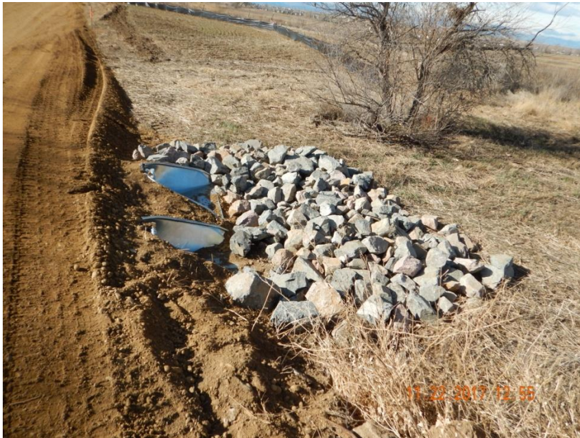
Photo 9. Photo taken from the south culvert along the west-side of the access road, facing West. Operator installed an outlet device (rip-rap).