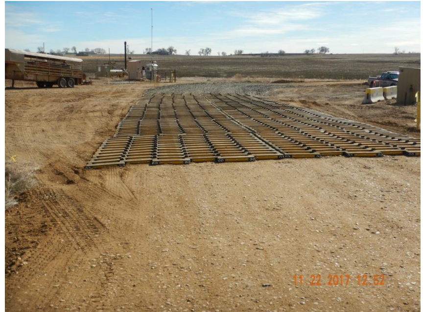
Photo 4. Photo taken from the entrance of the location off East 160 th Ave., facing South. Operator installed vehicle tracking devices.