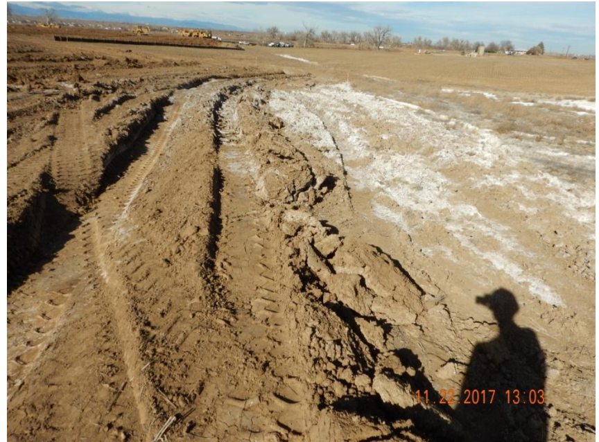
Photo 14. Photo taken from the southeast location, facing Northwest. Operator needs to improve and implement BMPs along this portion of the perimeter.