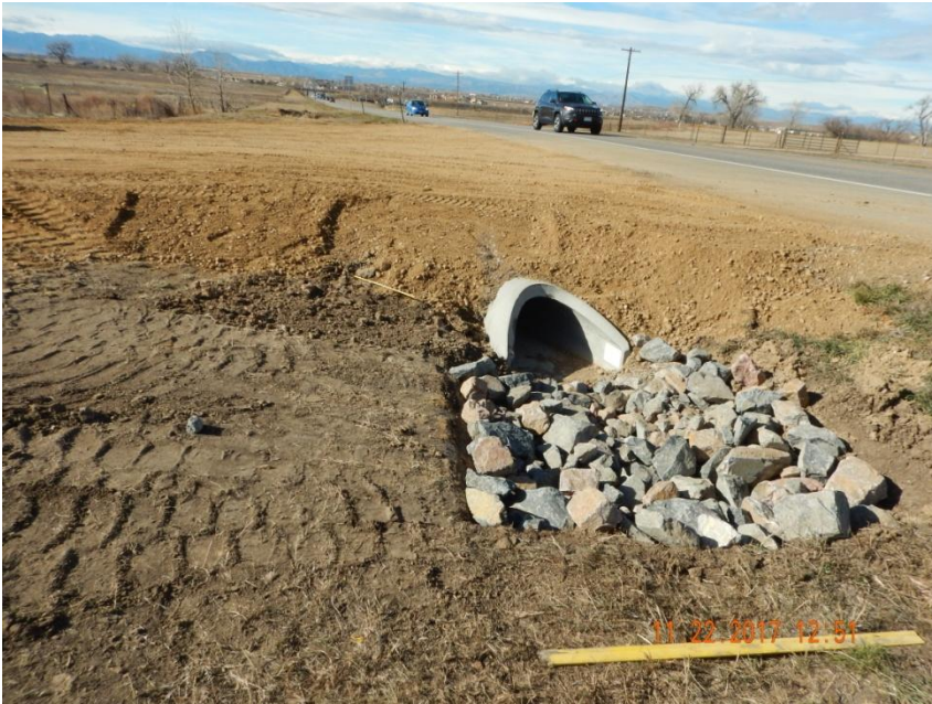
Photo 3. Photo taken from the entrance of the location off East 160 th Ave., facing West. Operator installed culvert along roadside ditch with both inlet and outlet protection.