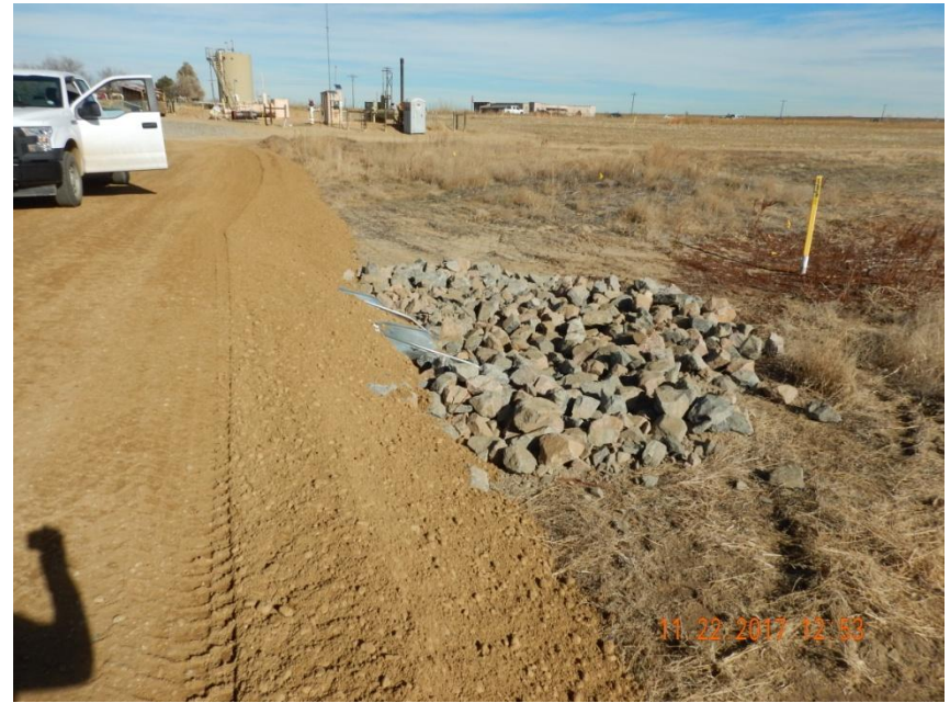
Photo 6. Photo taken from the north culvert along the east-side of the access road, facing North. Operator installed an inlet device (rip-rap).