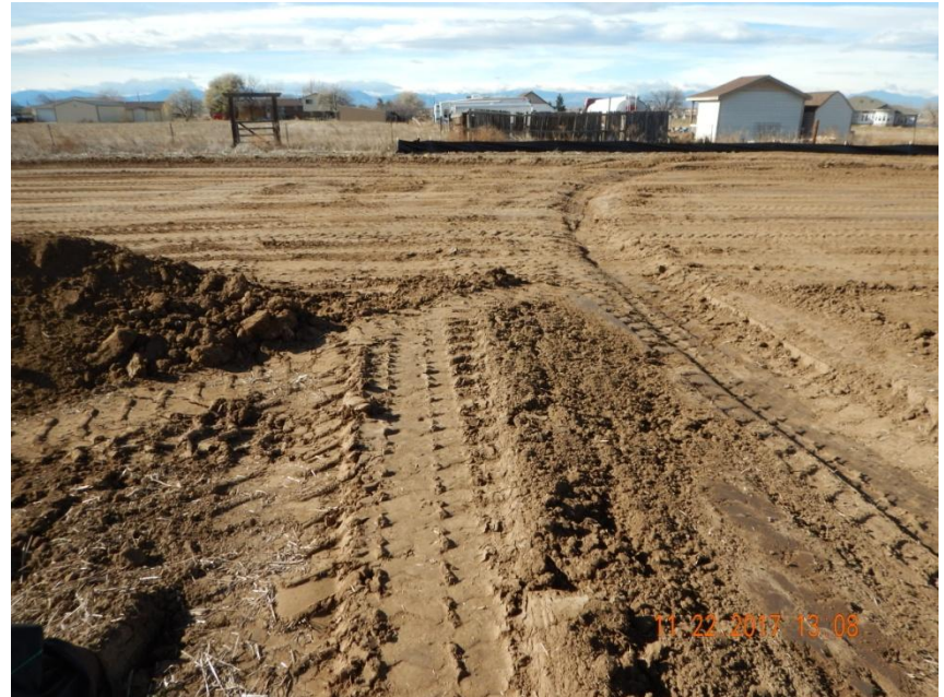
Photo 16. Photo taken from the southwest location, facing West. Evidence of the ditch BMP but appears to be additional disturbance, maybe a flowline, where no BMPs are in place.