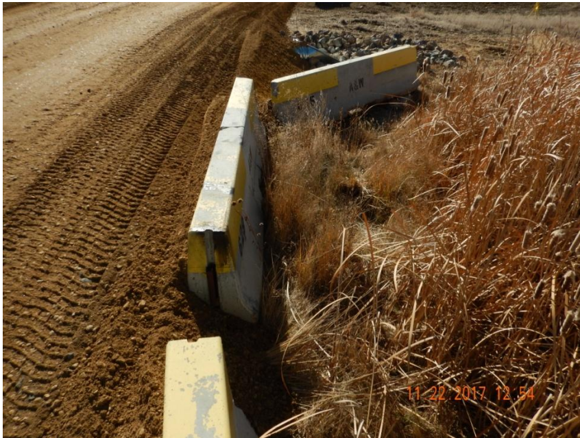
Photo 7. Photo taken from the north culvert along the west-side of the access road, facing North. Operator needs additional BMPs to protect sediment discharge into the wetland along the western access road.