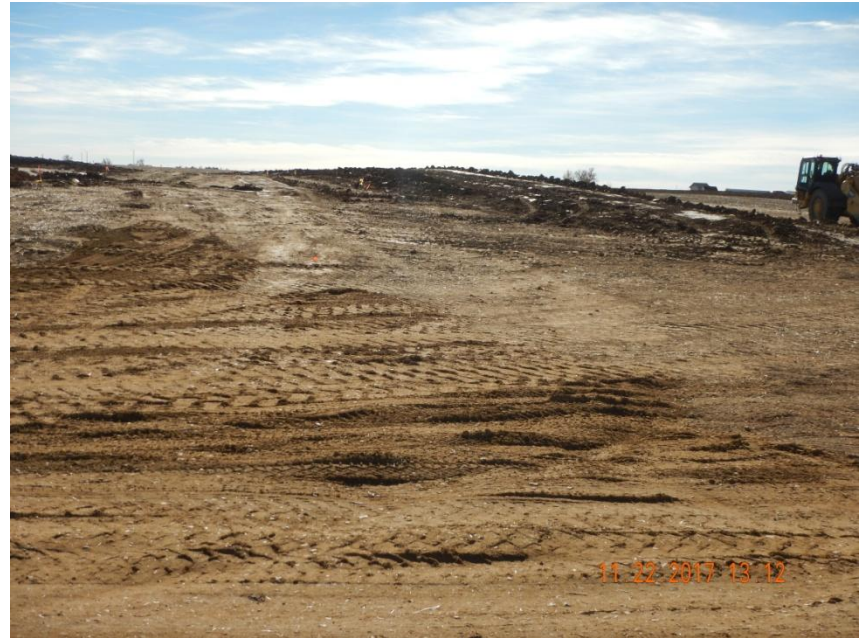
Photo 20. Photo taken from the northwestern location, facing South. Appears to be the start off constructing the berm for visual mitigation.