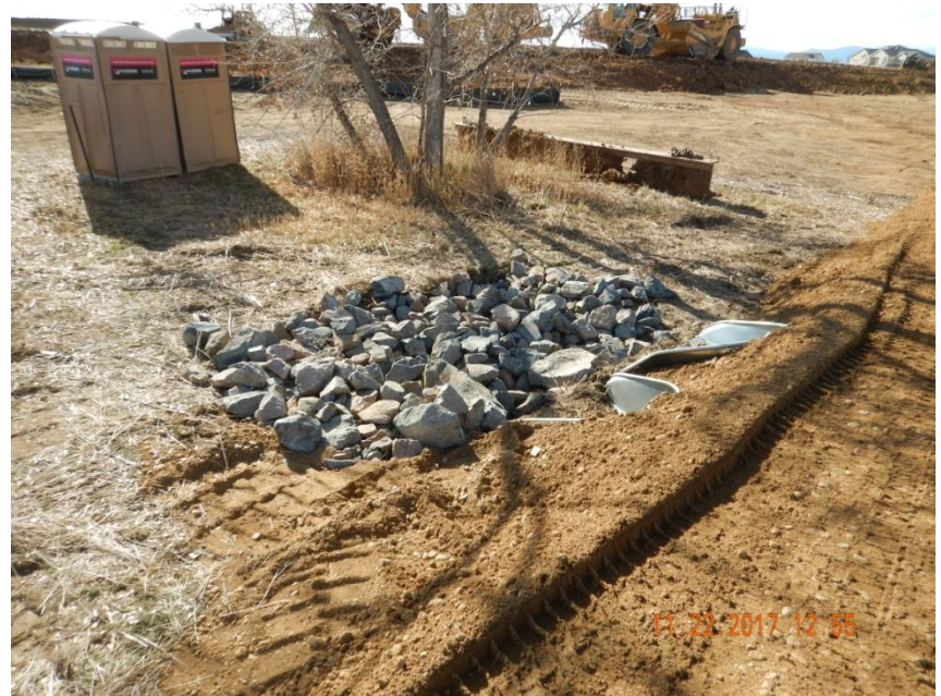
Photo 10. Photo taken from the south culvert along the east-side of the access road, facing Southwest. See comments under Photo 9.