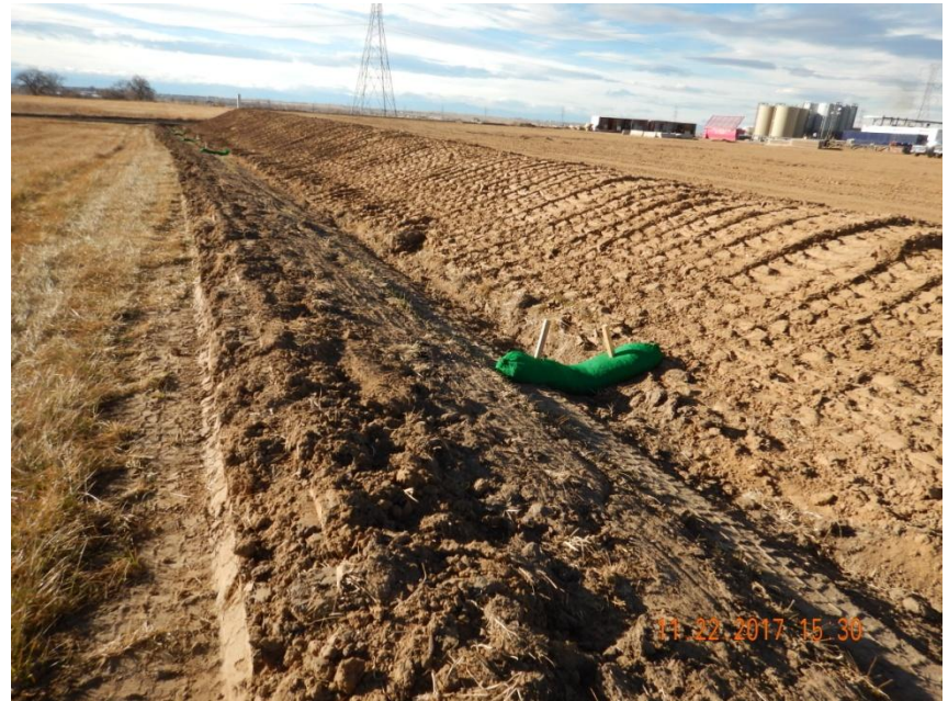
Photo 10. Photo taken from the southern location, facing West. See comments under Photo 2. Check dam BMPs have been installed along portions of the southern ditch and berm BMP.