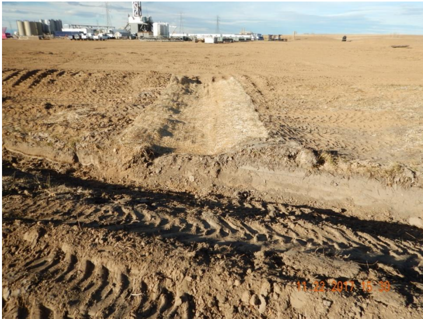
Photo 9. Photo taken from the southern location, facing North. Operator has installed a stabilized outlet which is directed to the perimeter berm and ditch BMP.