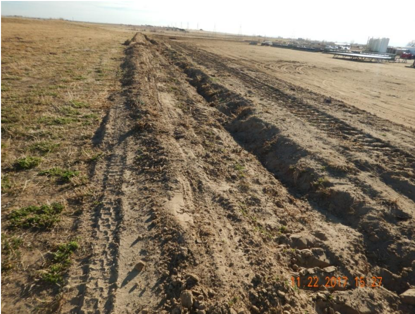
Photo 7. Photo taken from the southeastern location, facing South. Berm BMP has not been properly stabilized and has been left unconsolidated.