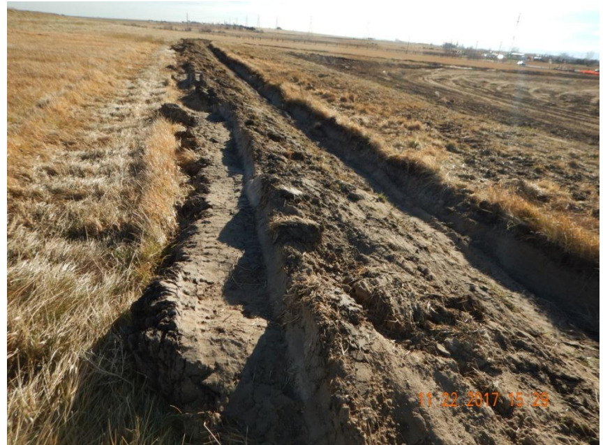
Photo 8. Photo taken from the southeastern location, facing South. See comments under Photo 7.