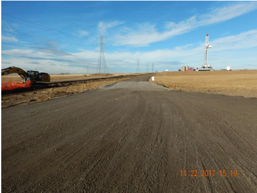
Photo 1. Photo taken from the entrance of the location, facing North. Tracking pad devices installed at the entrance off County Road 2.