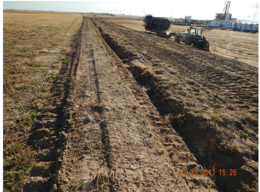
Photo 6. Photo taken from the eastern location, facing South. See comments under Photo 2.