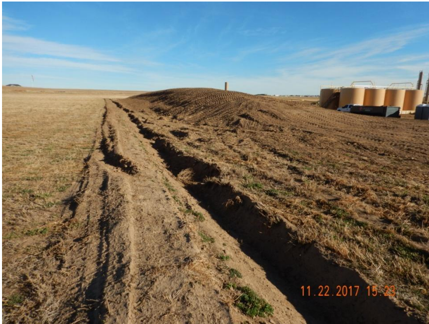
Photo 3. Photo taken from the northwest location, facing East. See comments under Photo 2.