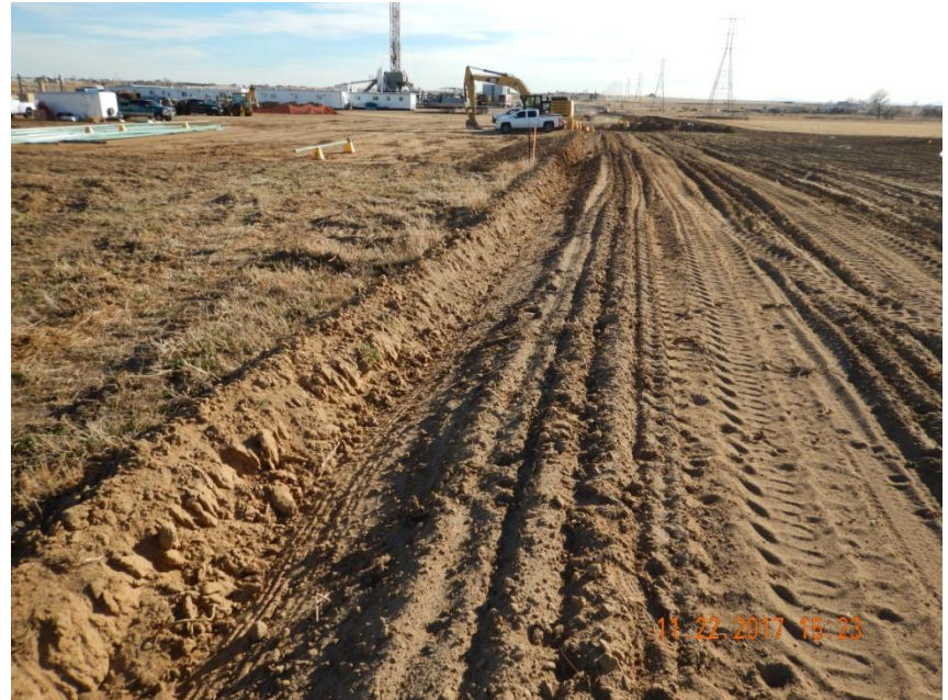
Photo 2. Photo taken from the northwest location, facing South. Ditch and berm BMP installed around the perimeter of the location. Appears portions of the berm have been tracked with equipment for temporary stabilization but portions have been left unconsolidated.