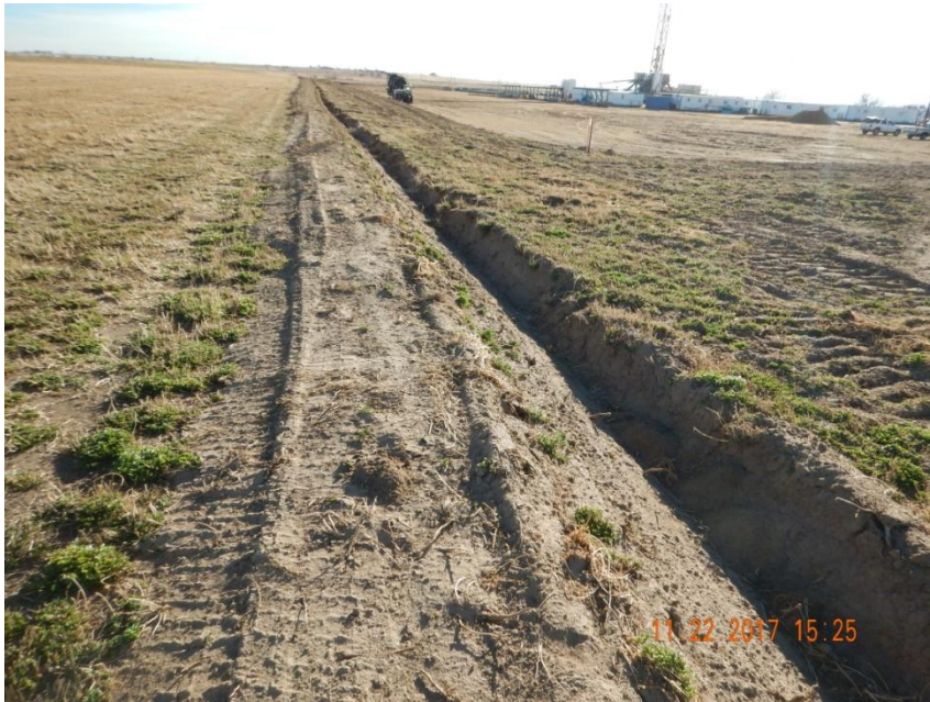
Photo 5. Photo taken from the northeast location, facing South. See comments under Photo 2.