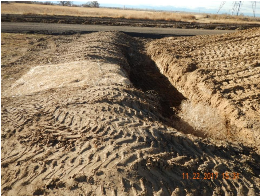
Photo 11. Photo taken from the southwest location, facing West. Sediment trap has been installed with a stabilized outlet; however, the sediment trap does not appear to be properly sized for 17 acres of disturbance.