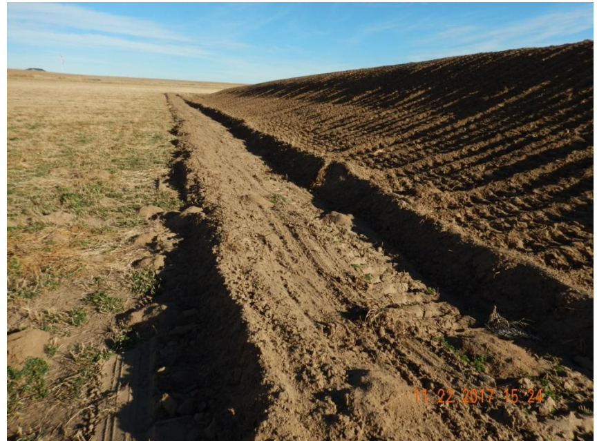
Photo 4. Photo taken from the northern location, facing East. Appears topsoil has been salvaged and stored along the northern perimeter. Topsoil has been temporarily stabilized by equipment tracking. See comments under Photo 2.