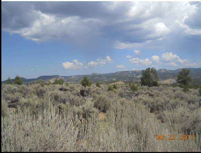
Jimmy Gulch Federal 397-3K Looking North