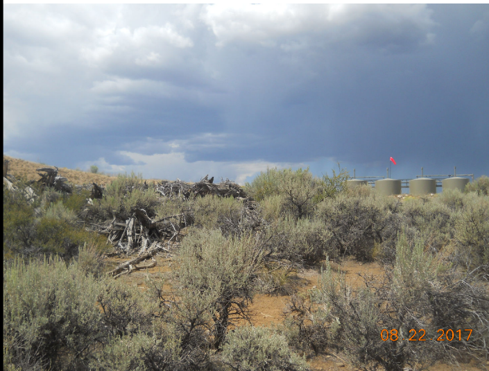
Jimmy Gulch Federal 397-3K Looking West