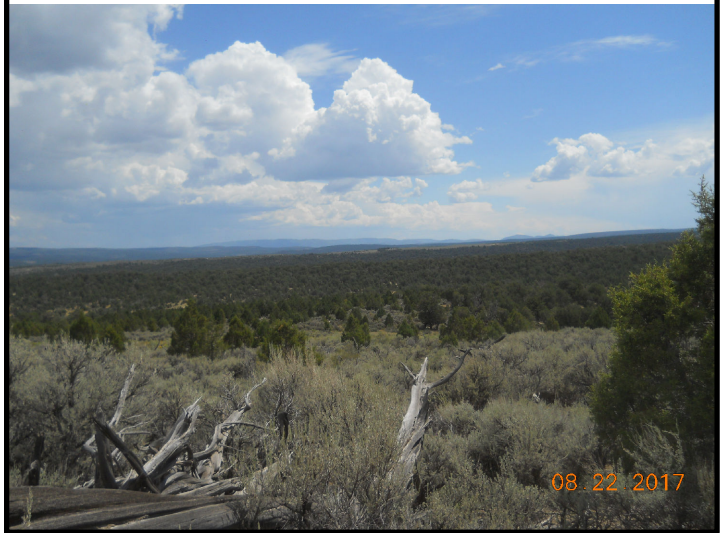
Jimmy Gulch Federal 397-3K Looking East