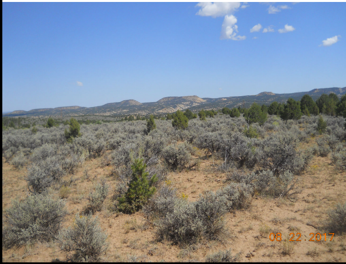
Jimmy Gulch Federal 397-3G Looking North