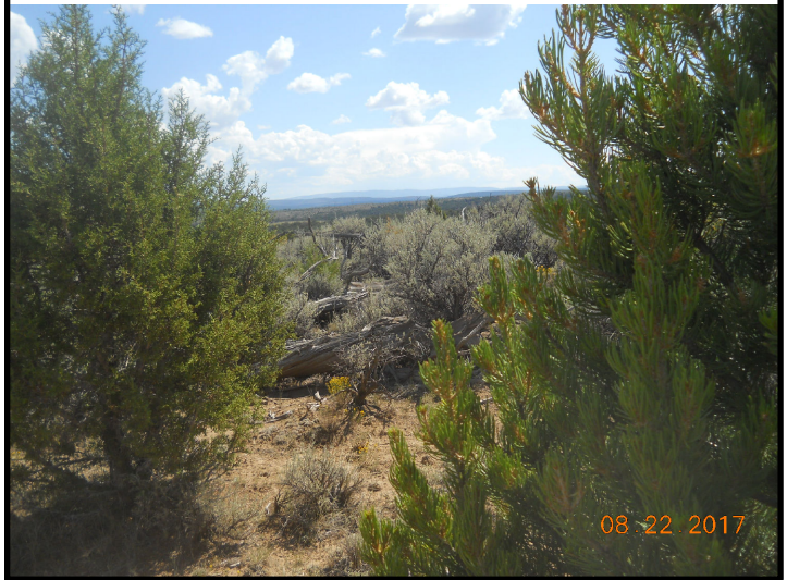
Jimmy Gulch Federal 397-3G Looking East