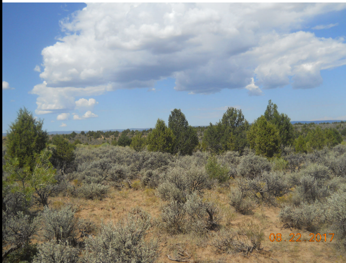
Jimmy Gulch Federal 397-3G Looking West