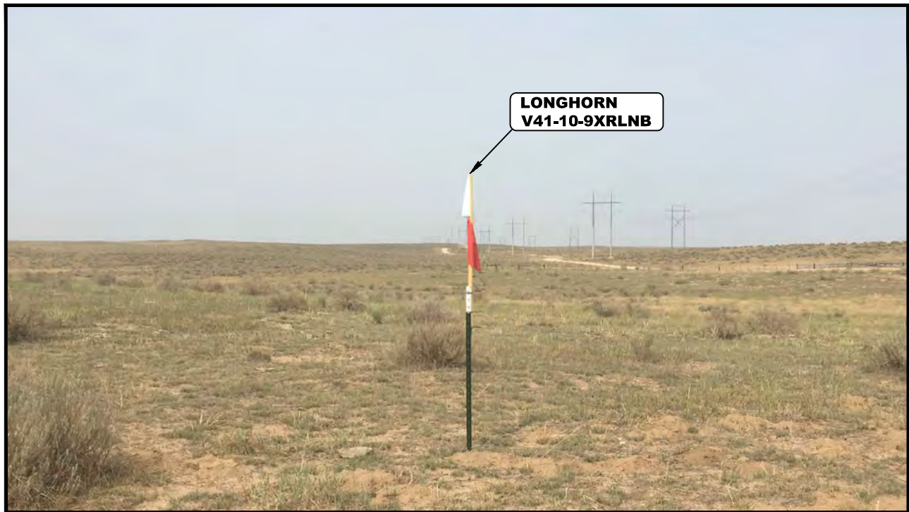
VIEW OF LOCATION STAKE