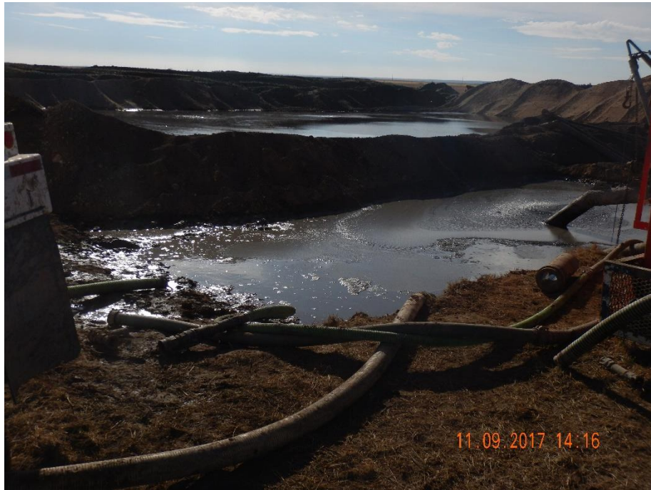
Photo 19: Photo taken from the northeast corner of the pits, facing southwest