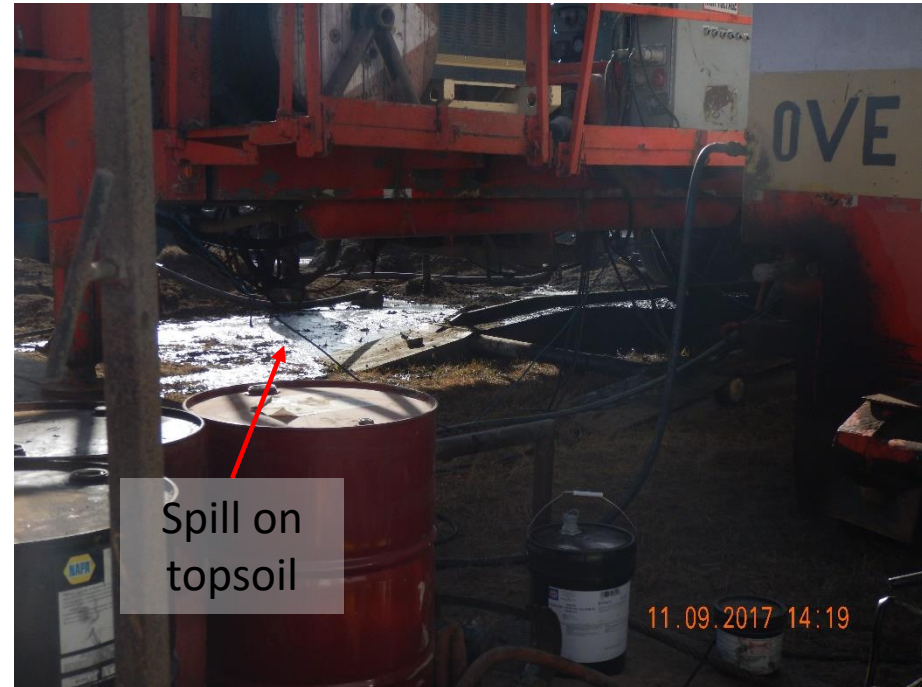
Photo 20: Photo taken from the northeast end of the drill rig, facing southwest. Photo drill rig has been set up and operated directly upon the topsoil. Photo also shows what appears to be drilling mud has spilled onto the topsoil from either the pit, or the rig.