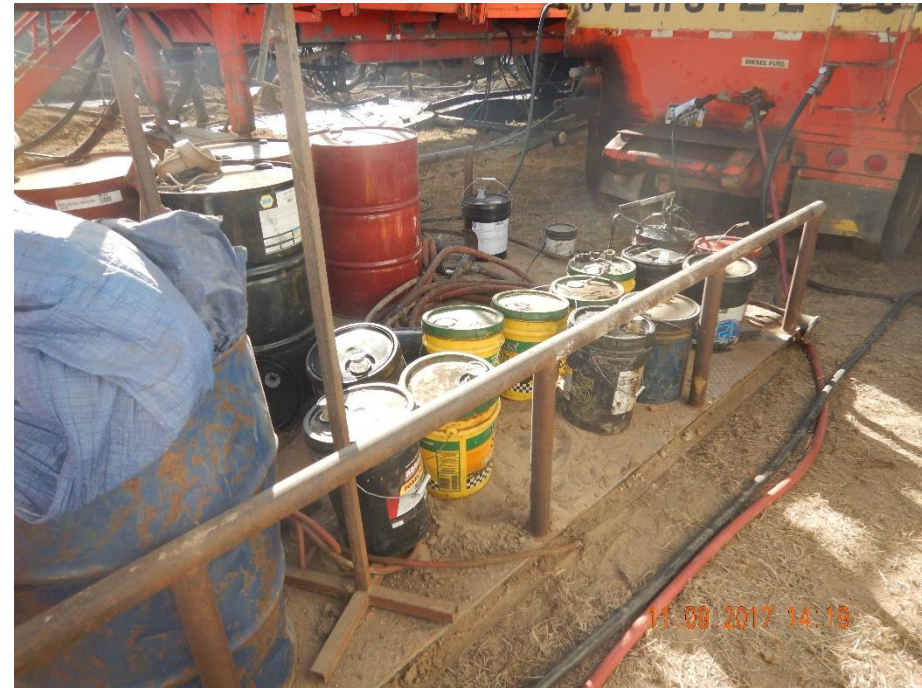
Photo 18: Photo shows materials appear to be stored appropriately.