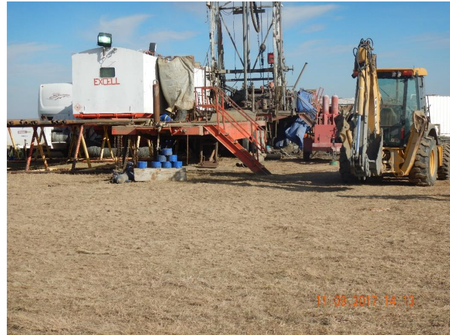
Photo 10: Photo taken from the west end of the location, facing east. Photo shows that with exception to the pit, no topsoil salvage has been conducted on the location. Photo shows drill rig has been set up and in operation.