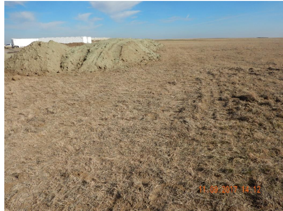
Photo 8: Photo taken from the southwest end of the location, facing east. Photo shows operator has implemented hydro mulch on the southern portion of the soil stockpile