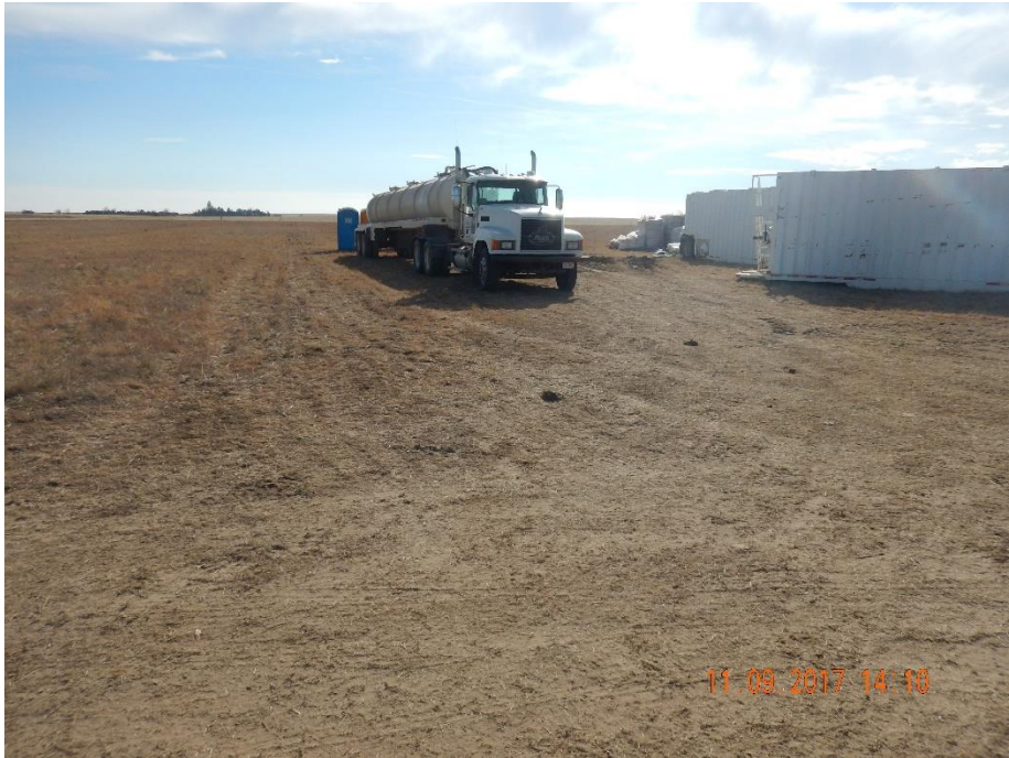
Photo 1: Photo taken from the east end of the location, facing south. Photos 1-3 provide a “panoramic” overview of the location. Photo shows that, with exception to the pit, no topsoil salvage has been conducted on the location. All equipment has been stored directly upon the soil surface/topsoil.