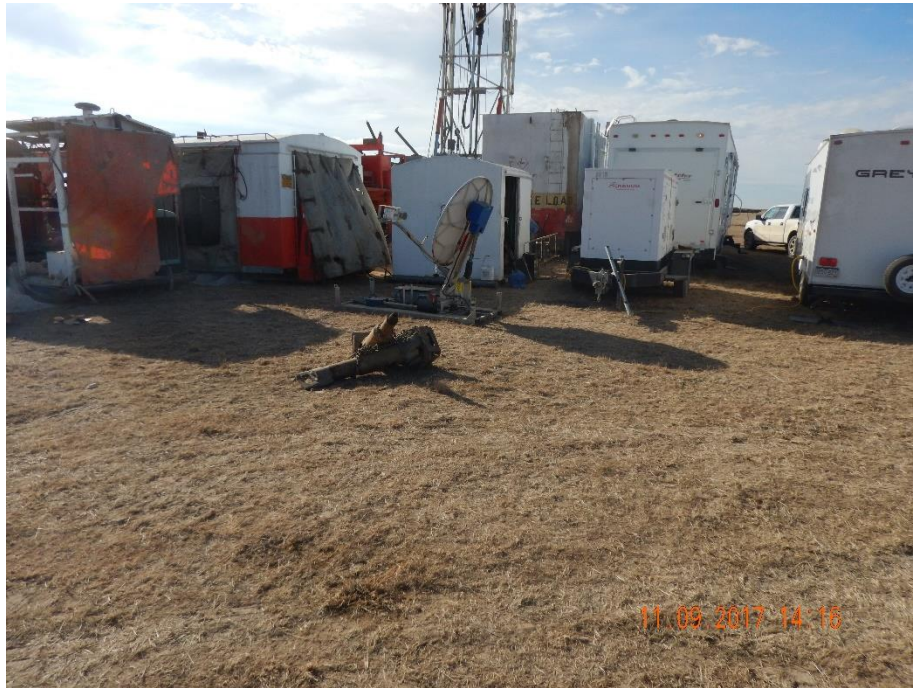
Photo 17: Photo taken from the east end of the location, facing west. See Comments under photo 11