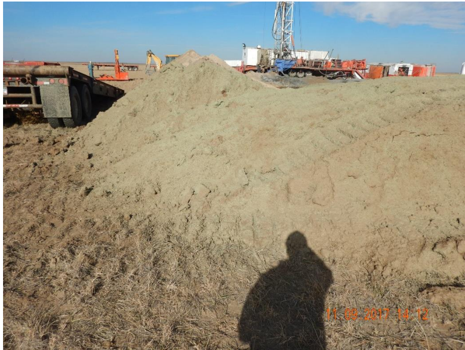
Photo 7: Photo taken from the southwest end of the location, facing northeast. Photo shows operator has implemented hydro mulch on the southern portion of the soil stockpile