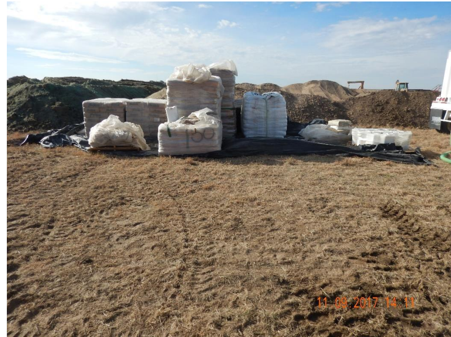
Photo 4: Photo taken from the east side of the pit. Photo shows materials have been placed onto a tarp.