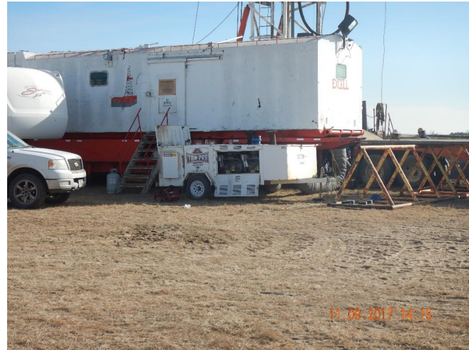
Photo 14: Photo taken from the north end of the location, facing south. See Comments under photo 11