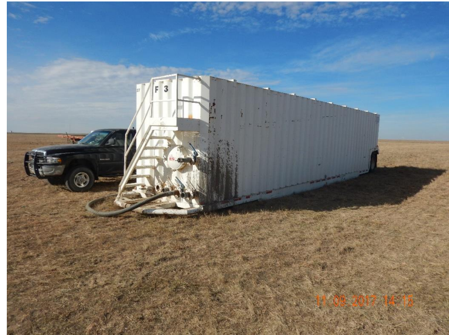
Photo 16: Photo taken from the north end of the location, facing north. See Comments under photo 11