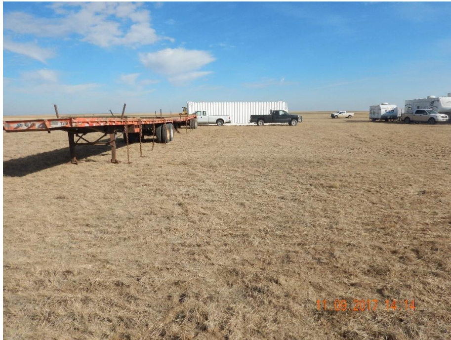
Photo 11: Photo taken from the northwest end of the location, facing east. Photos 11-13 provide a “panoramic” overview of the location. Photo shows that, with exception to the pit, no topsoil salvage has been conducted on the location. All equipment has been stored directly upon the soil surface/topsoil.