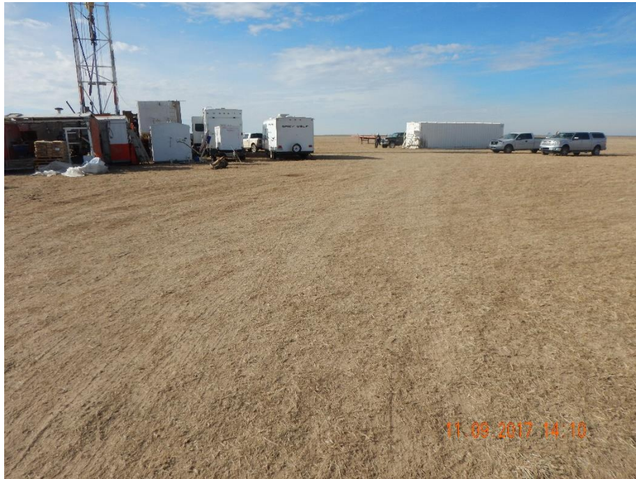
Photo 3: Photo taken from the east end of the location, facing west. See comments under photo 1.