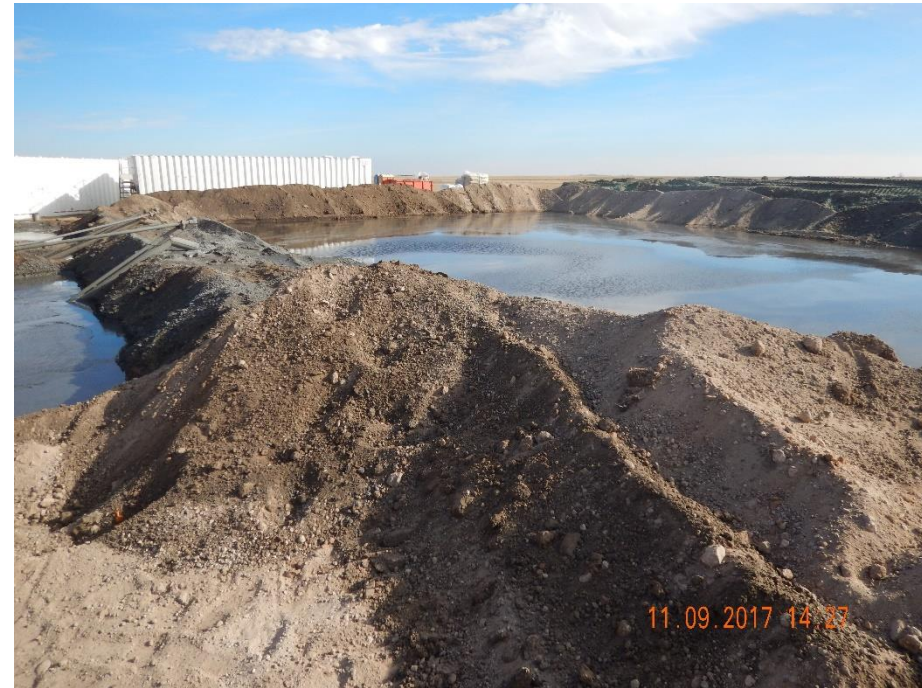
Photo 22: Photo taken from the northwest corner of the pit, facing southeast.