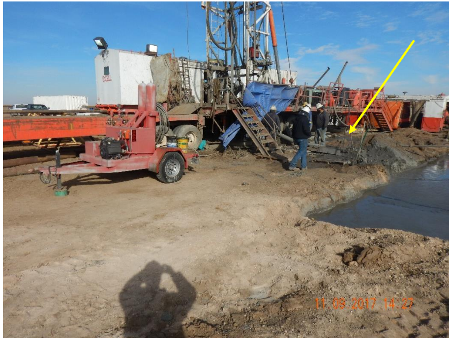
Photo 21: Photo taken from the southeast end of the drill rig, facing northeast. Photo shows drill rig has been set up and operated directly upon the topsoil. Photo also shows area where, what appeared to be drilling mud, has spilled onto the topsoil from either the pit, or the rig (see photo 20).