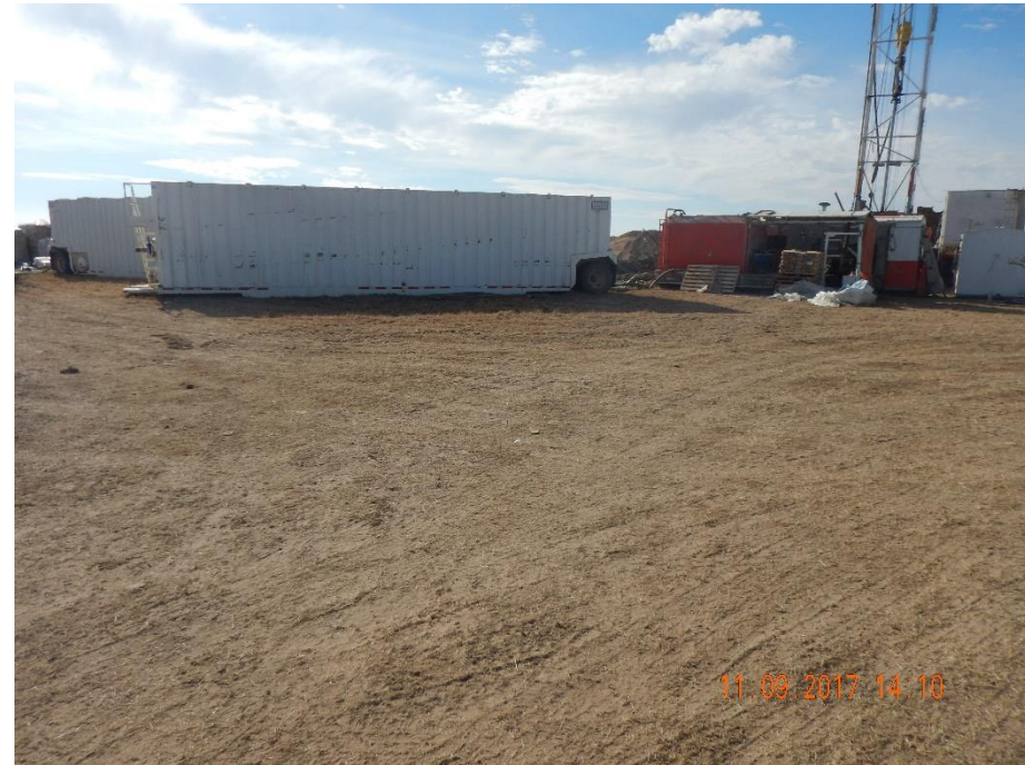
Photo 2: Photo taken from the east end of the location, facing southwest. See comments under photo 1.