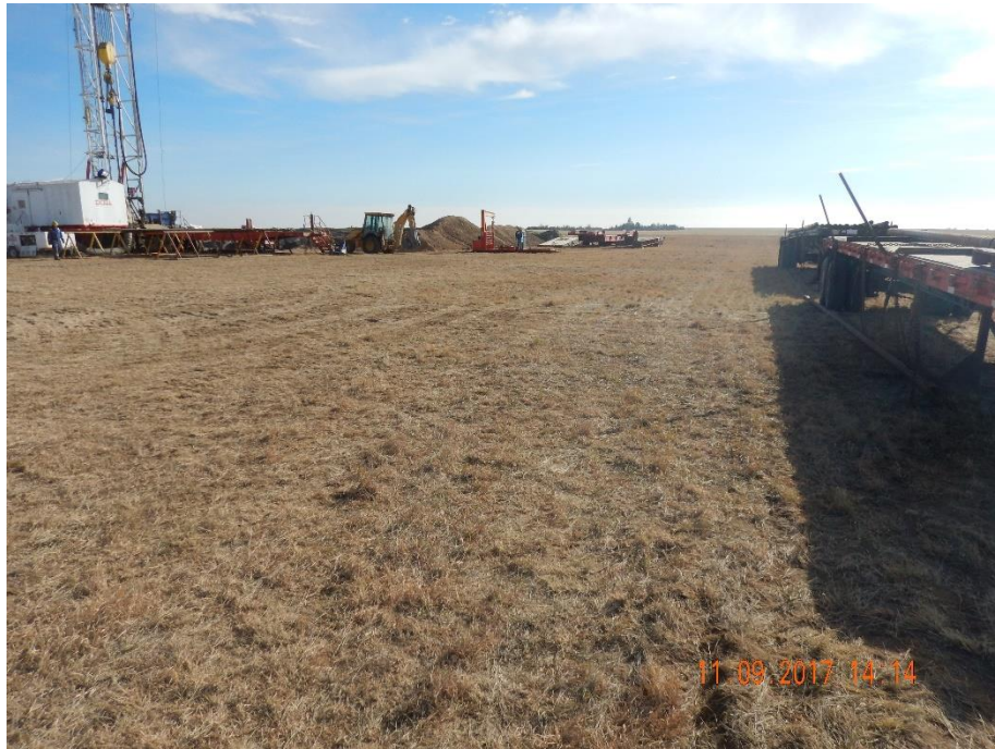
Photo 13: Photo taken from the northwest end of the location, facing south. See Comments under photo 11