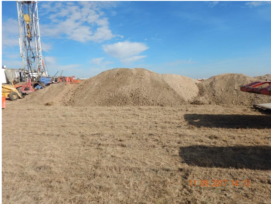
Photo 9: Photo taken from the west end of the location, facing east. Previous inspections documented that soil stockpiles around pit were loose materials and have not been stabilized. Inspection required operator to implement BMPs to stabilize soils. Photo shows soil stockpiles on the east end of the pit remains unstabilized.