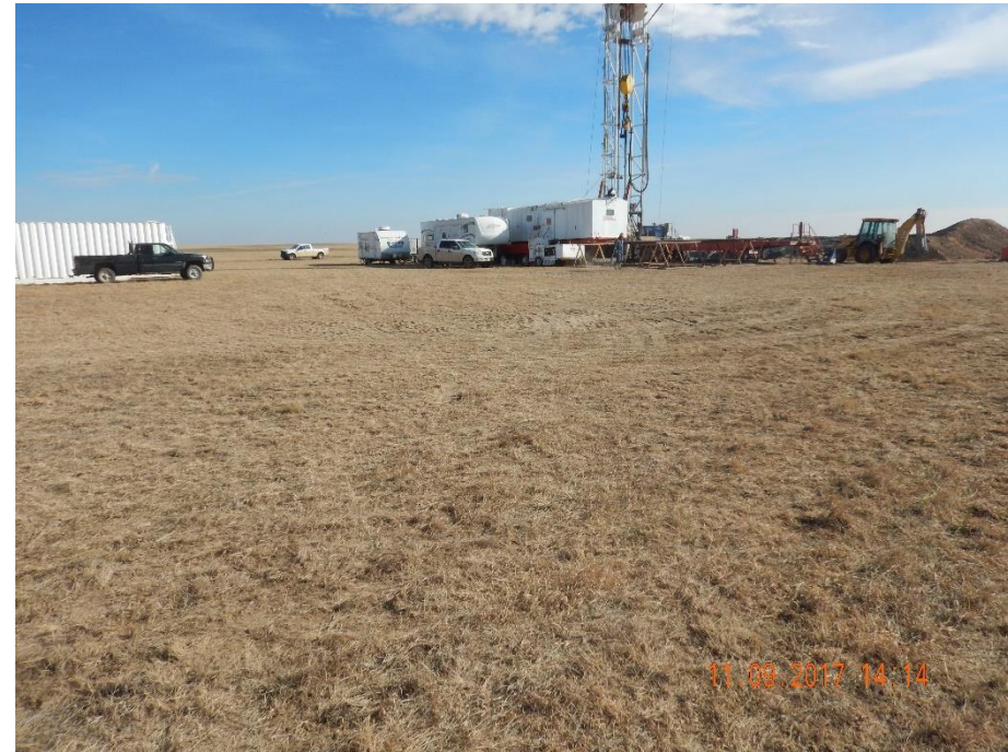
Photo 12: Photo taken from the northwest end of the location, facing southeast. See Comments under photo 11