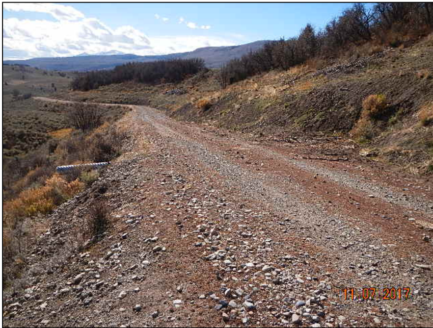
Photo 5. one of two culverts with silted in inlet.