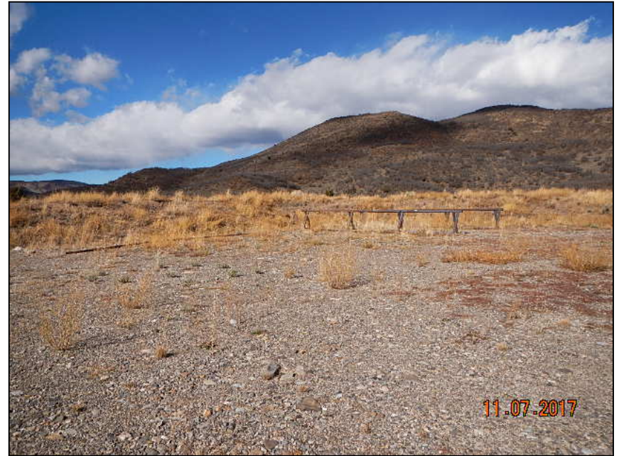
Photo 2. Pipe racks still on location.