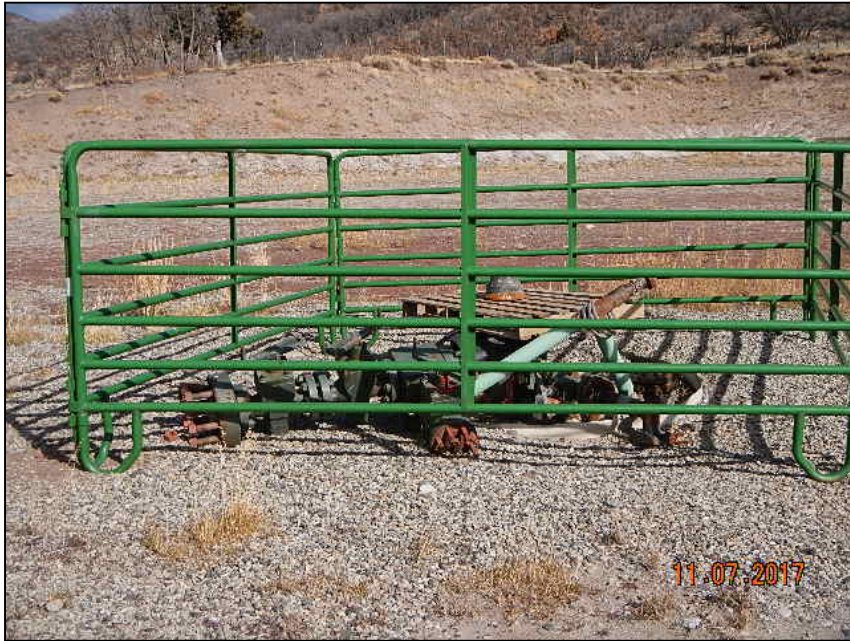
Photo 1. Wellhead.