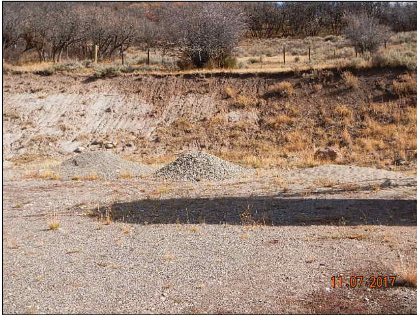
Photo 3. Stored gravel. Cut slope erosion.