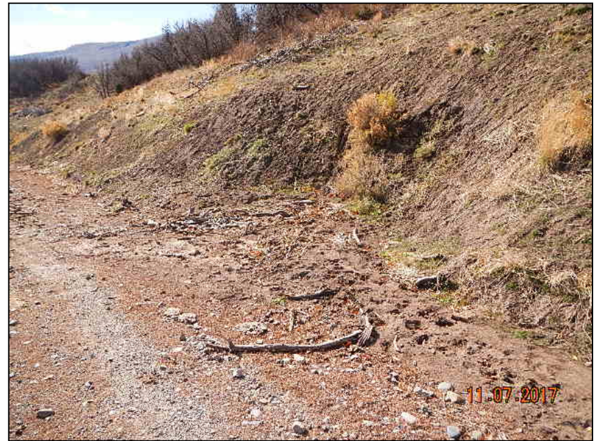
Photo 6. Silted in inlet to culvert