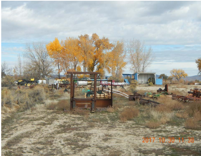
Landowner equipment on the perimeter of the pad