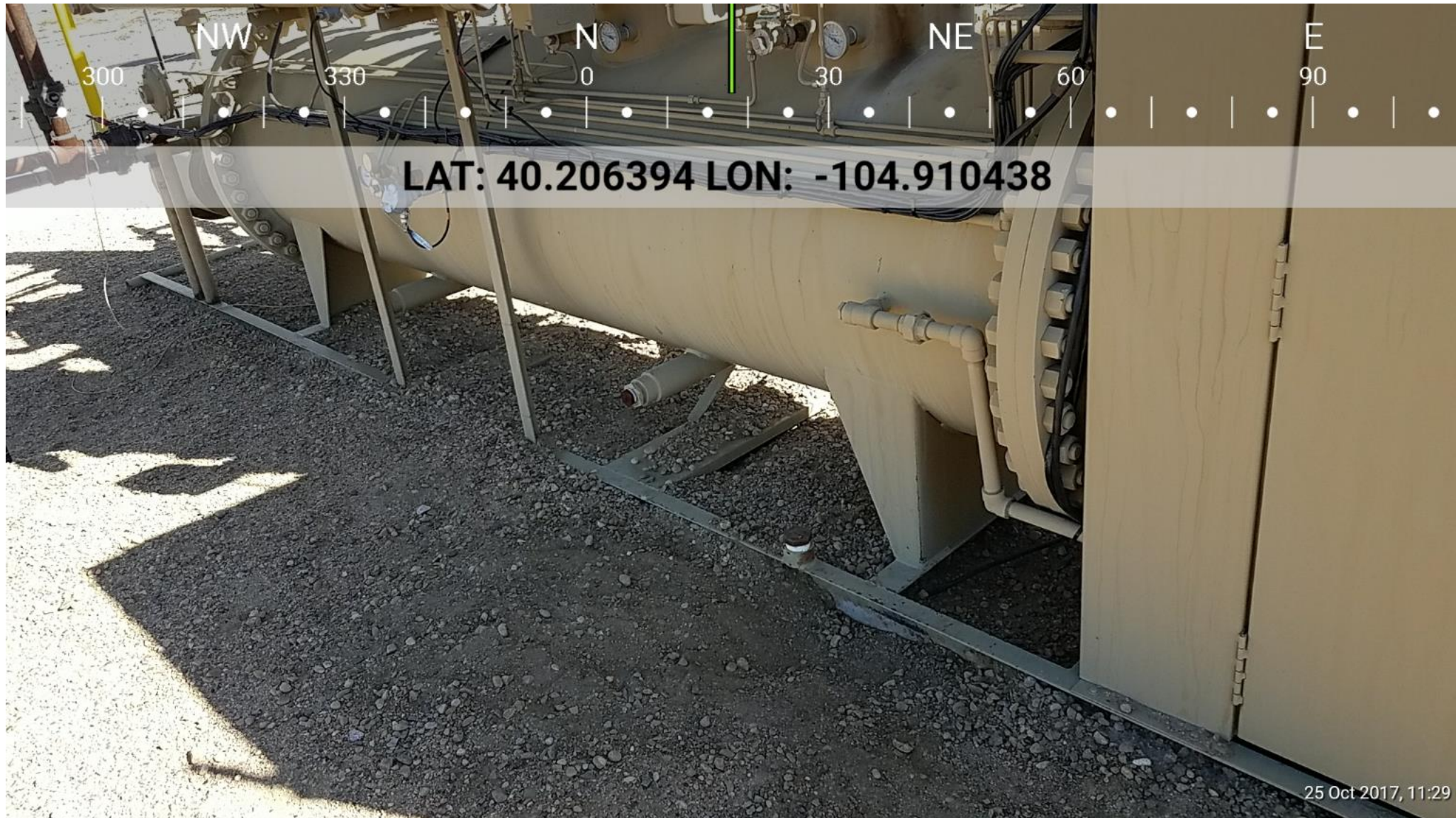
Skid on Separator Location Number: 319490