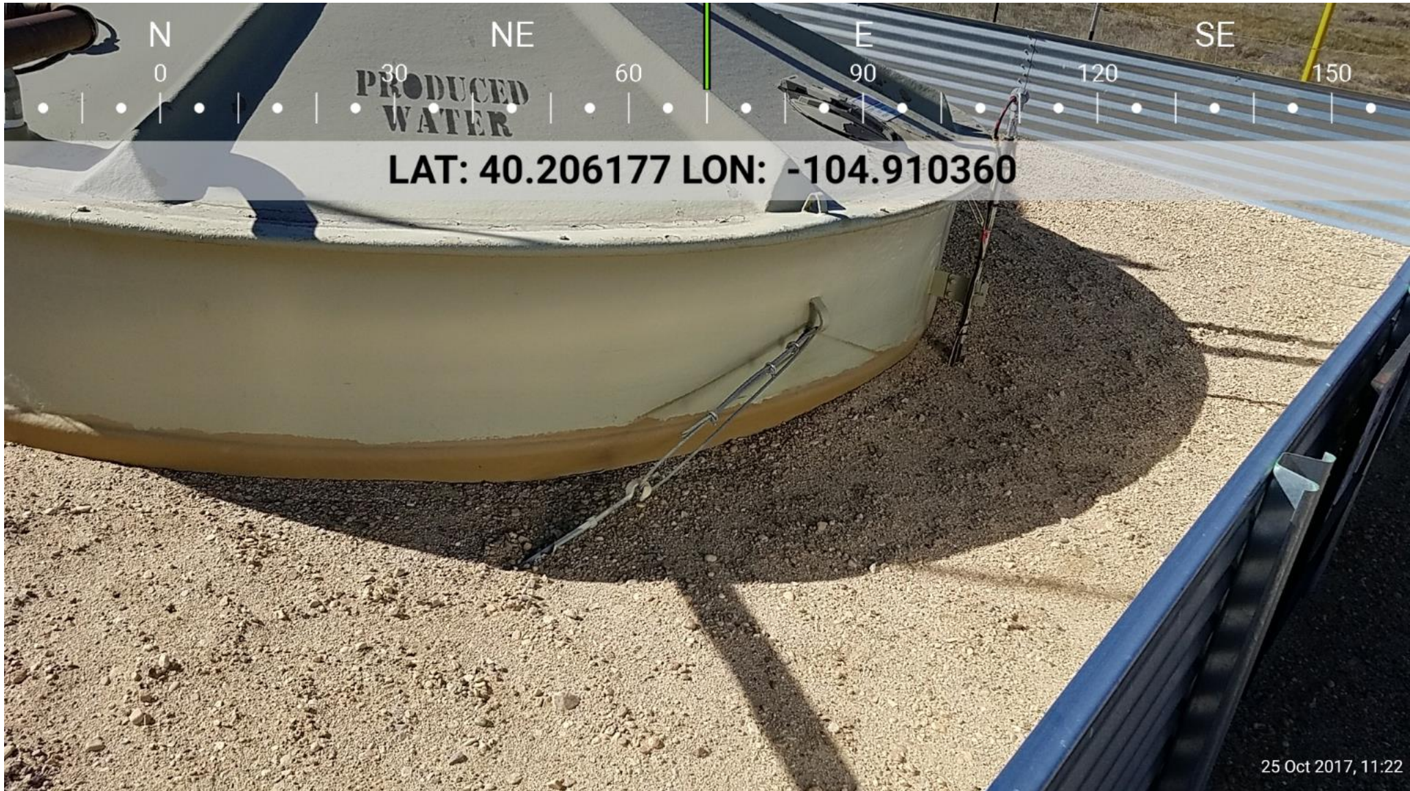
Flood Restraint on Produced Water Tank