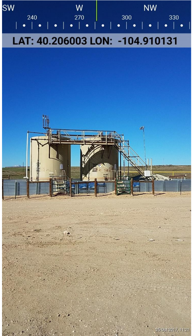
Tank Battery Location Number: 319490