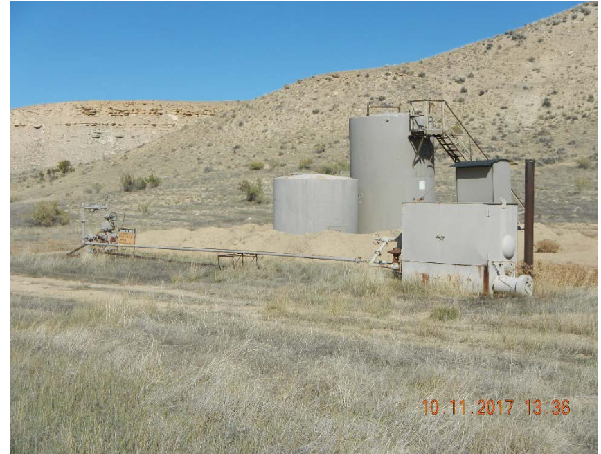
Location looking northeast