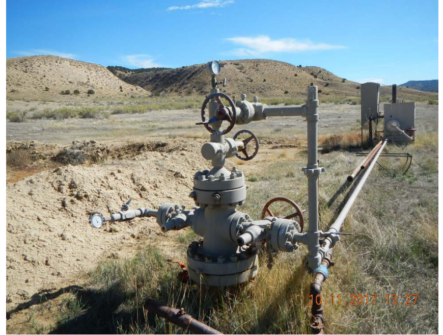
Wellhead separator and meter shed looking southeast