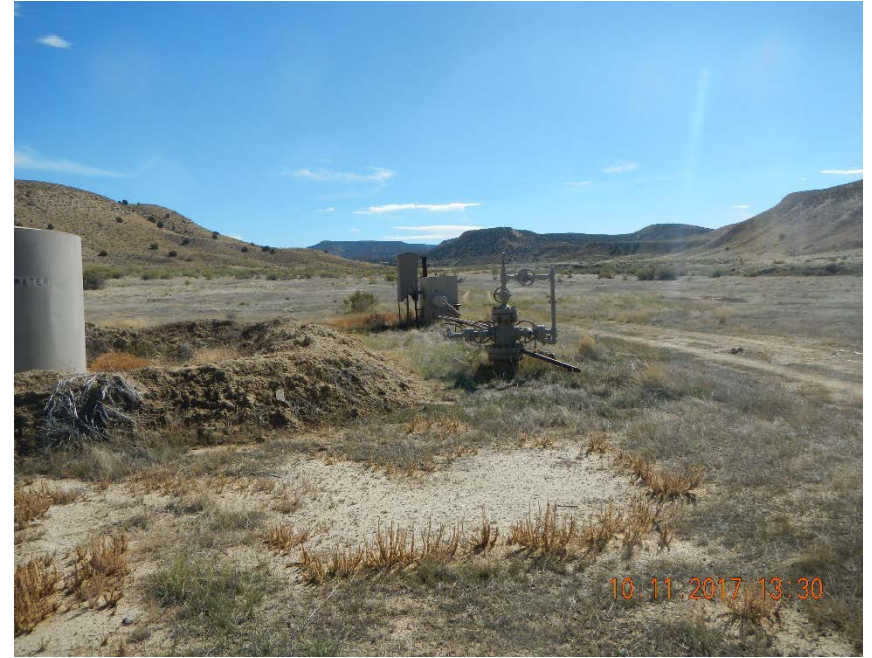
Location looking south