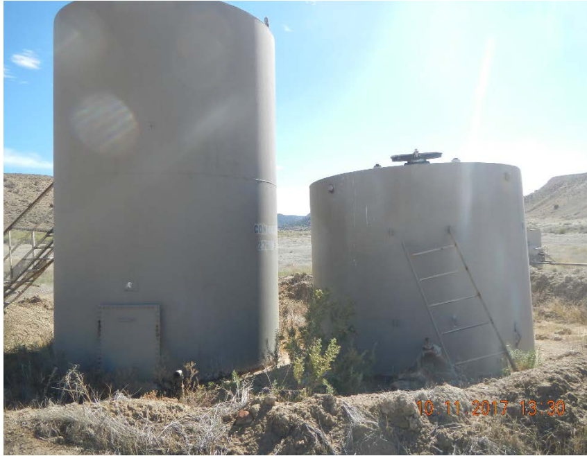
210bbl condensate and 100 bbl PW Tanks