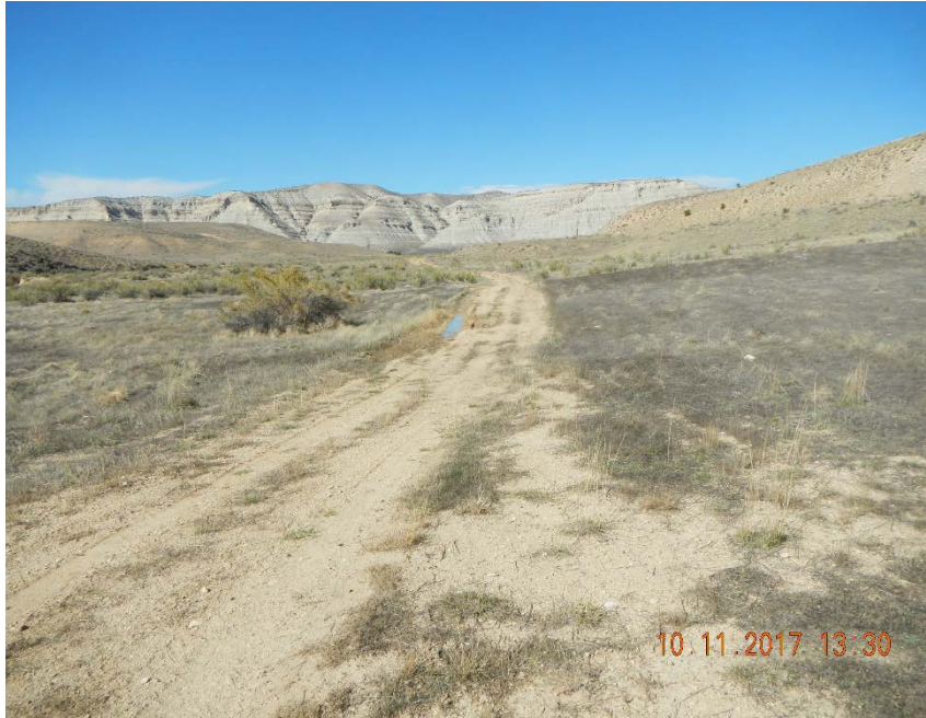
Access road looking north