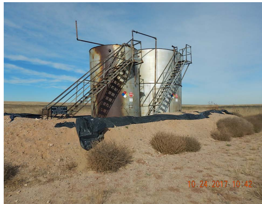
Photo 9: Labels on tanks, rusted production tank, weeds along berms