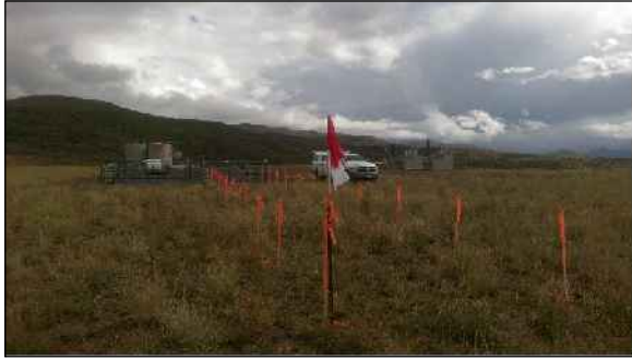
WELL LOCATION LOOKING NORTH 9/29/2017