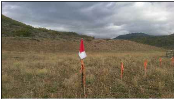
WELL LOCATION LOOKING EAST 9/29/2017