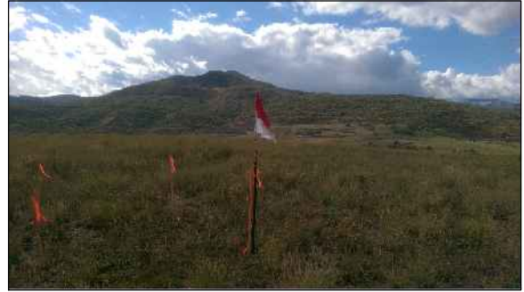
WELL LOCATION LOOKING SOUTH 9/29/2017