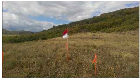
WELL LOCATION LOOKING WEST 9/29/2017