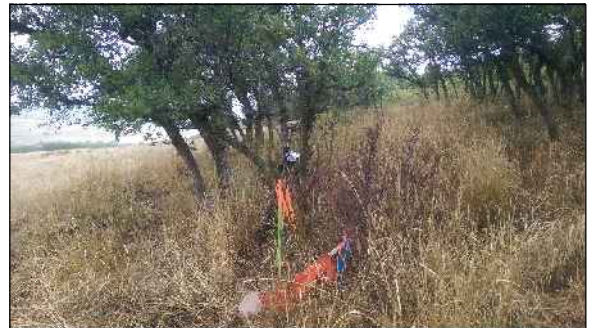
REFERENCE AREA LOOKING WEST 9/29/2017

REFERENCE AREA CENTER STAKE (DO NOT DISTURB) LATITUDE (NAD 83) NORTH 39.272656 DEG. LONGITUDE (NAD 83) WEST 107.835750 DEG.