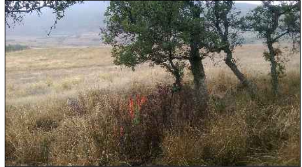
REFERENCE AREA LOOKING SOUTH 9/29/2017