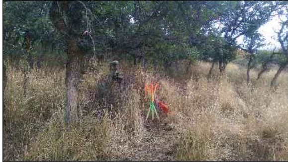
REFERENCE AREA LOOKING NORTH 9/29/2017