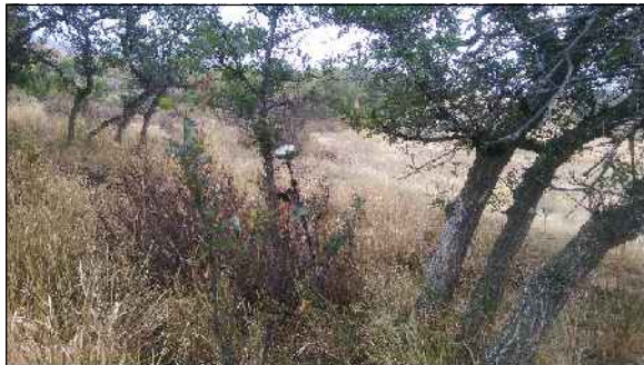
REFERENCE AREA LOOKING EAST 9/29/2017