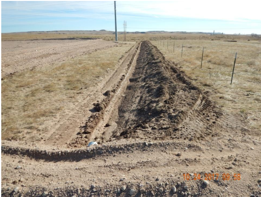
Photo 1. Photo taken from the entrance of location, facing East. Ditch and berm BMP installed around the entire perimeter of location. Berm BMP has been left unconsolidated which is not a proper functioning BMP, as unconsolidated material would be susceptible to wind and water erosion.