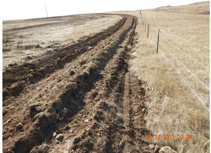
Photo 8. Photo taken from the western location, facing South. See comments under Photo 1.