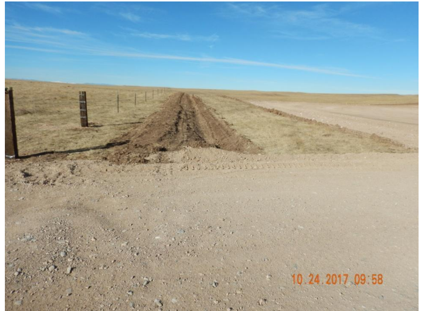
Photo 2. Photo taken from the entrance of location, facing West. See comments under Photo 1.