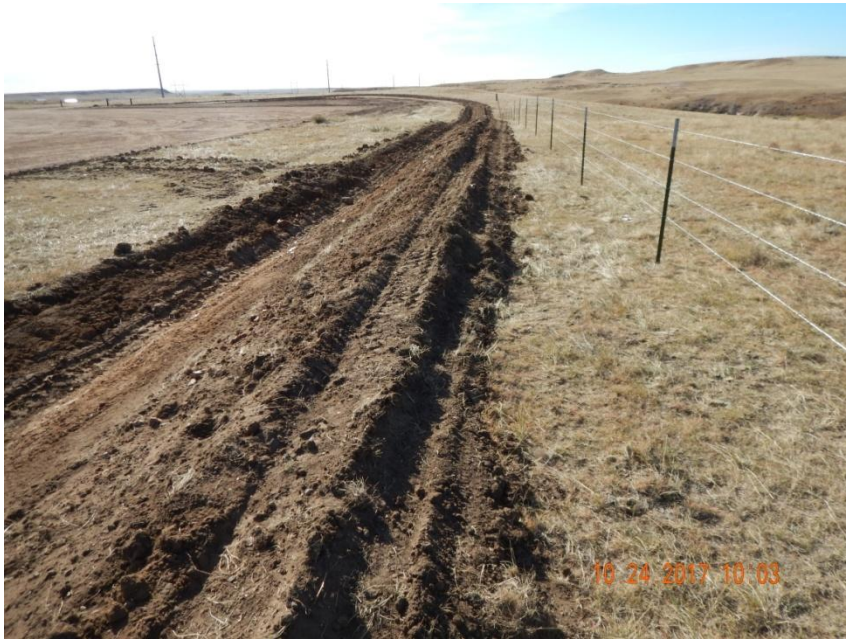
Photo 7. Photo taken from the northwest location, facing South. See comments under Photo 1.