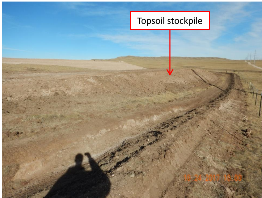
Photo 5. Photo taken from the eastern location, facing North. Appears topsoil has been salvaged and stored along the eastern perimeter of the location.