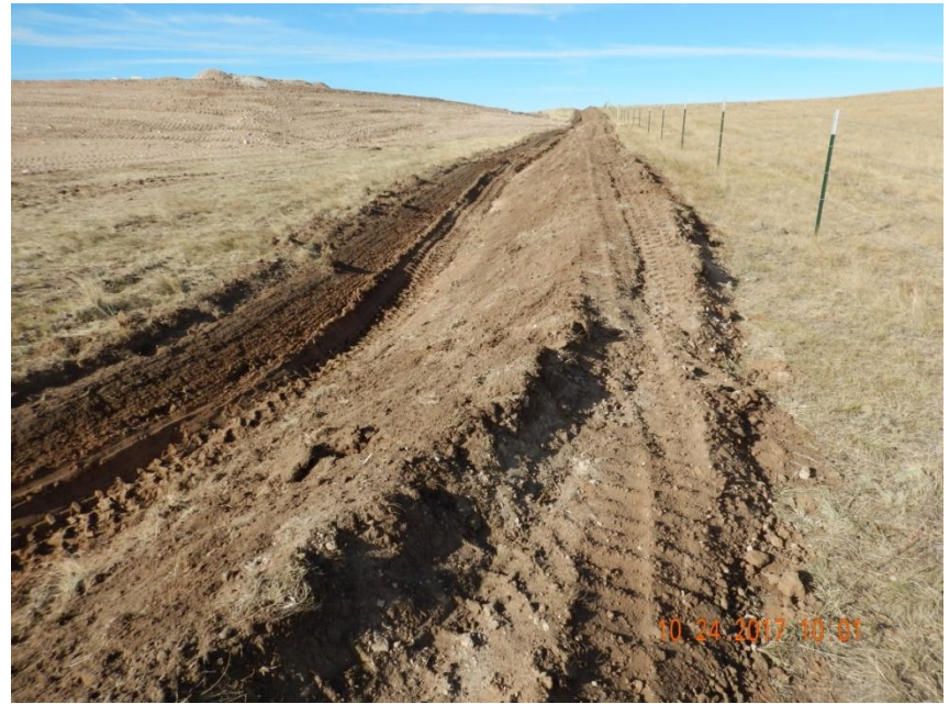
Photo 6. Photo taken from the northeast location, facing West. See comments under Photo 1.