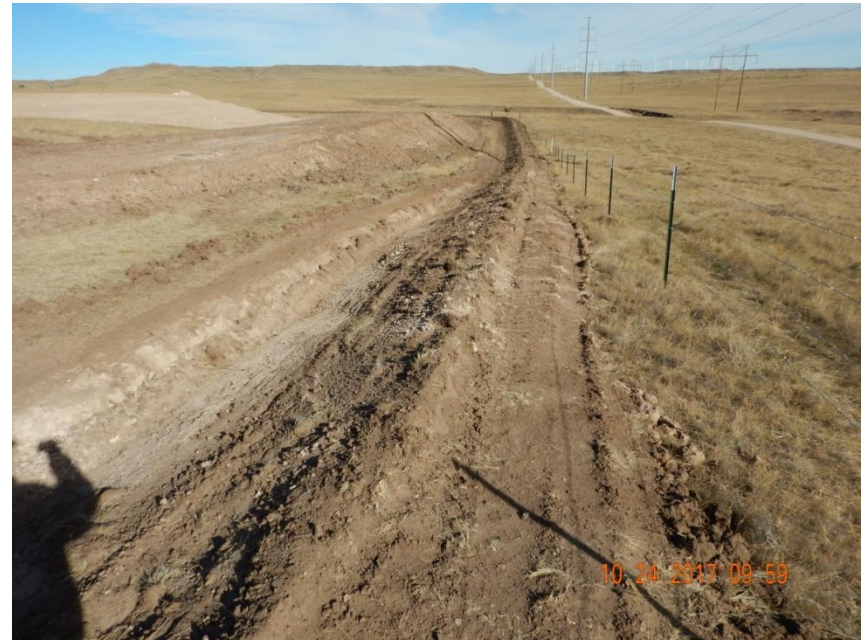
Photo 4. Photo taken from the southeast location, facing North. See comments under Photo 1.