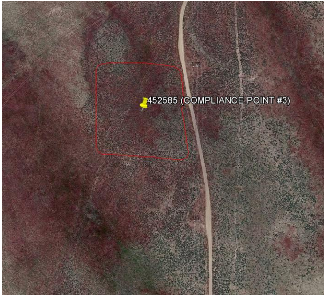
Photo 1. Google Earth aerial imagery taken on June 14, 2016. Operator has constructed a pad in the northeast of Section 34, Township 4N, Range 63W without an approved 2A- see Photo 2. The approximate center of the pad is at the following Latitude/Longitude: 40.271549/-104.416259. A disturbance area of 4.47 acres was mapped on 10/12/2017 using a Trimble Juno 3B handheld device (red line).