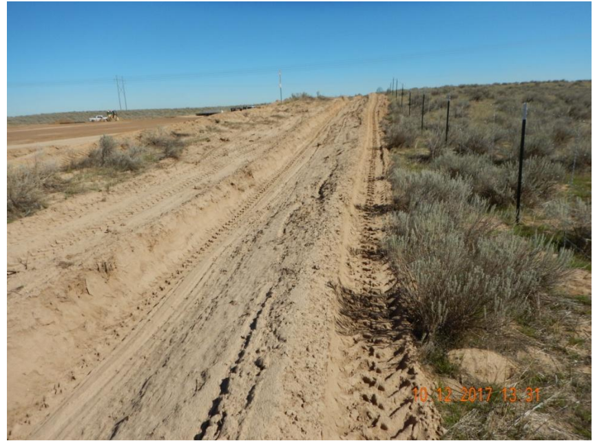
Photo 6. Photo taken from the southwestern location, facing East. See comments under Photo 3.