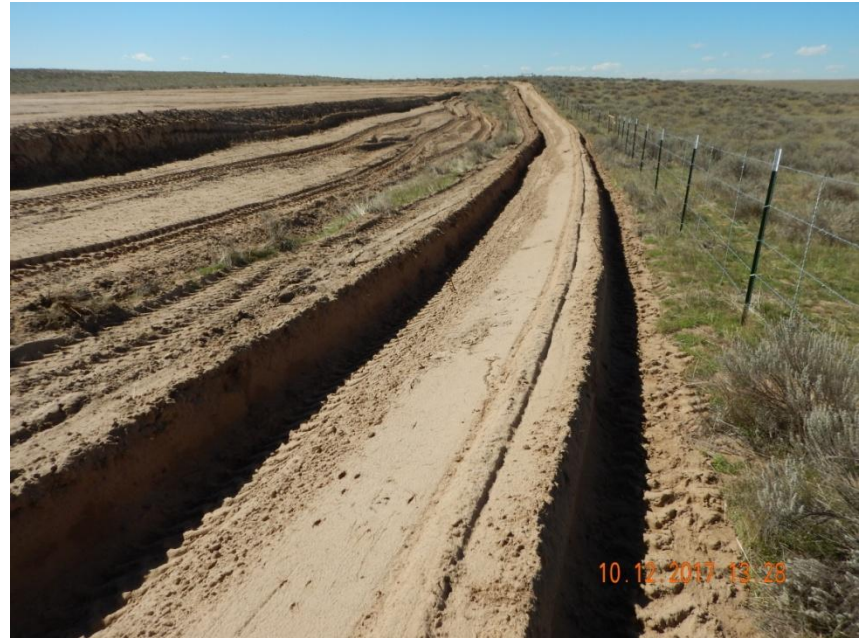
Photo 4. Photo taken from the northeastern location, facing West. See comments under Photo 3.