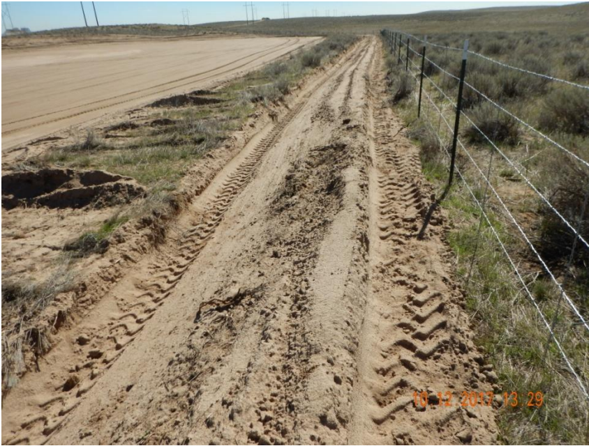
Photo 5. Photo taken from the northwestern location, facing South. See comments under Photo 3.