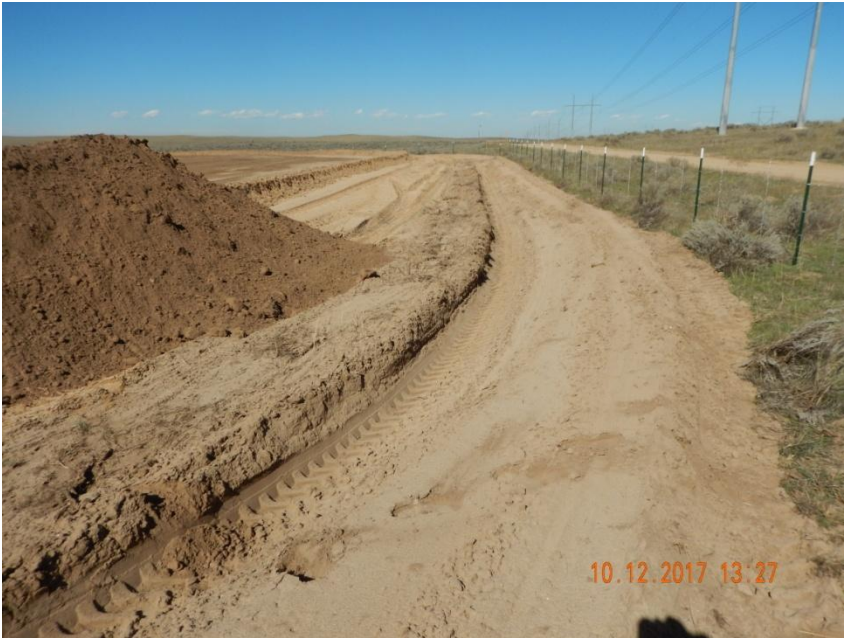
Photo 3. Photo taken from the eastern location, facing North. Operator has installed a ditch and berm around the entire location perimeter. The berm BMP has been left unconsolidated which would not be considered in proper functioning condition.