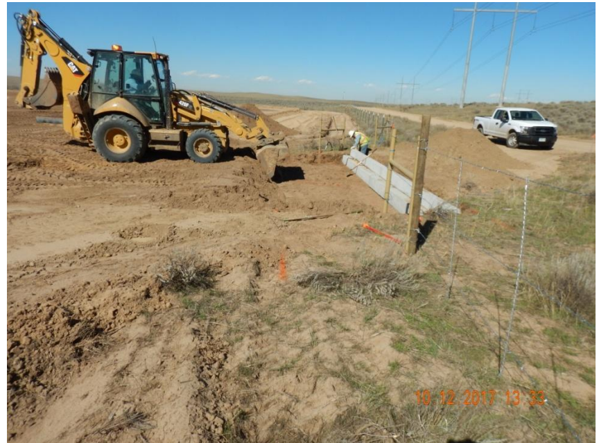
Photo 8. Photo taken from the entrance of the location, facing South. Operator in-process of installing a cattle guard tracking device.