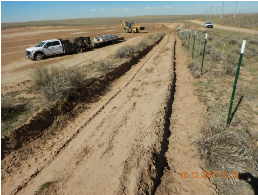
Photo 7. Photo taken from the southeastern location, facing North. See comments under Photo 3.