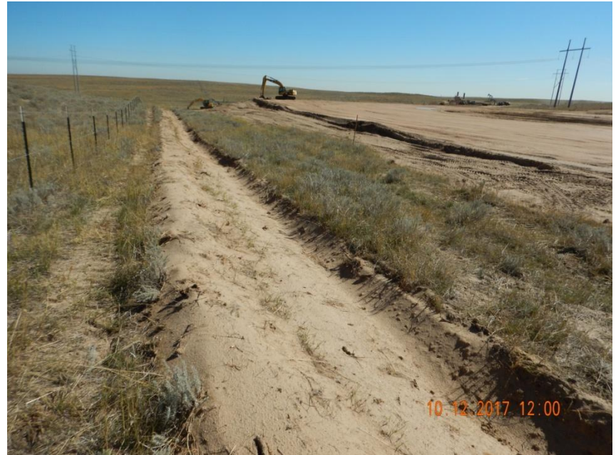
Photo 8. Photo taken from the northeastern location, facing East. See comments under Photo 3.