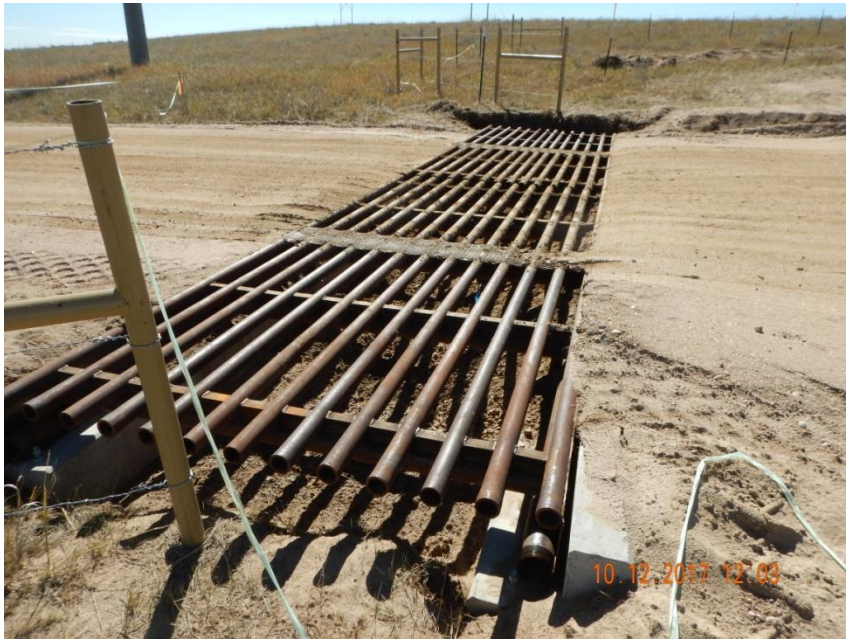
Photo 11. Photo taken from the entrance of the location, facing South. Operator has installed a cattle guard tracking device.