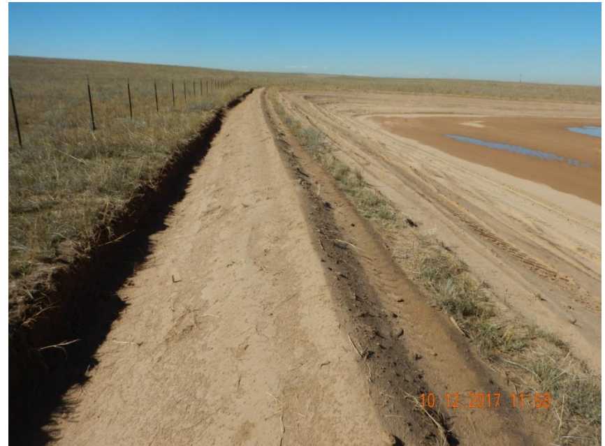
Photo 6. Photo taken from the southern location, facing West. See comments under Photo 3.