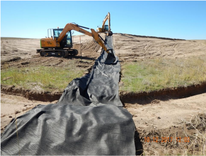
Photo 9. Photo taken from the northeastern location, facing Southwest. Operator in-process of installing an armored ditch.