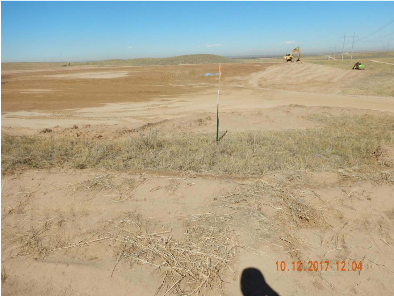
Photo 3. Photo taken from the southeast location, facing North. Photo taken includes most of the location, minus the western and southern location. Photo illustrates that no topsoil stockpile was observed at location, indicating that no topsoil was salvaged during operations.