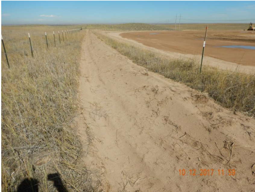
Photo 7. Photo taken from the southwestern location, facing North. See comments under Photo 3.