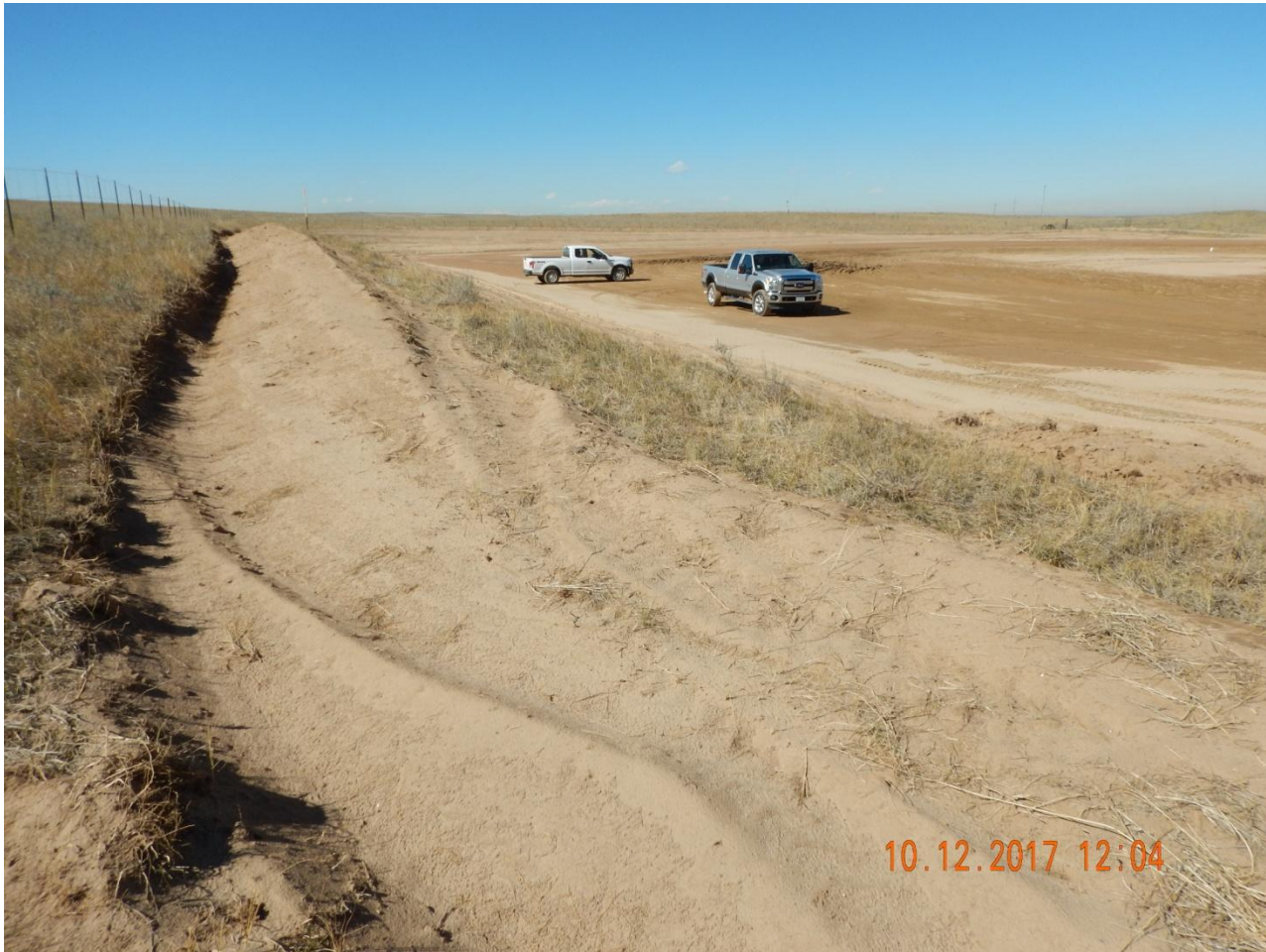
Photo 4. Photo taken from the southeast location, facing North. Photo taken includes the remainder of the western and southern location. See comments under Photo 3.