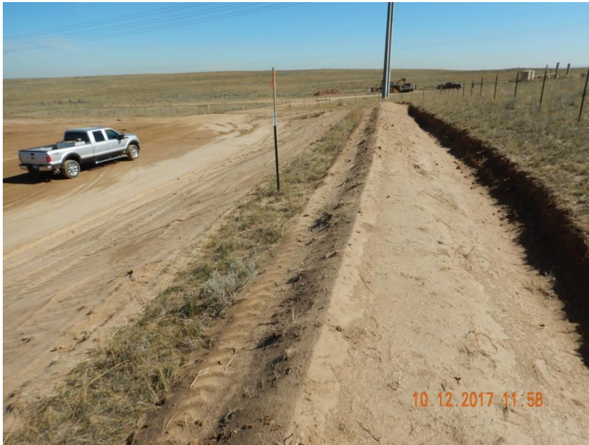
Photo 5. Photo taken from the southern location, facing East. Operator has installed a ditch and berm around the entire location perimeter. The berm BMP has been left unconsolidated which would not be considered in proper functioning condition.