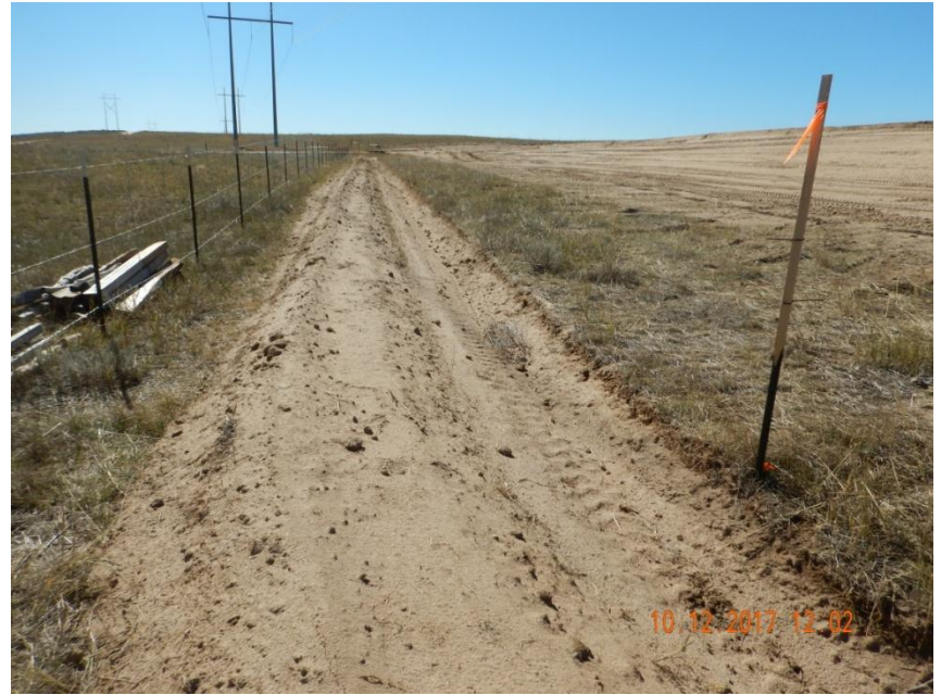
Photo 10. Photo taken from the northeastern location, facing South. See comments under Photo 3.