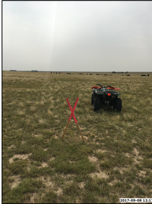
PICTURE OF SALT RANCH FEE 202-1015H REFERENCE AREA - CAMERA ANGLE SOUTH