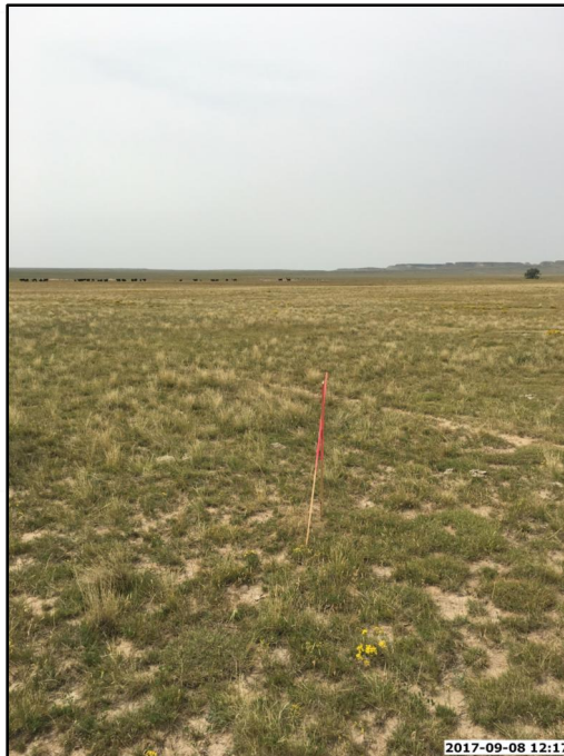
PICTURE OF SALT RANCH FEE 202-1015H REFERENCE AREA - CAMERA ANGLE WEST

REFERENCE AREA PICTURES SALT RANCH FEE 502-1015H, SALT RANCH FEE 202-1015H, SALT RANCH FEE 501-1015H & SALT RANCH FEE 201-1015H LOCATED IN SECTION 10, T11N, R64W, 6TH P.M. WELD COUNTY, COLORADO