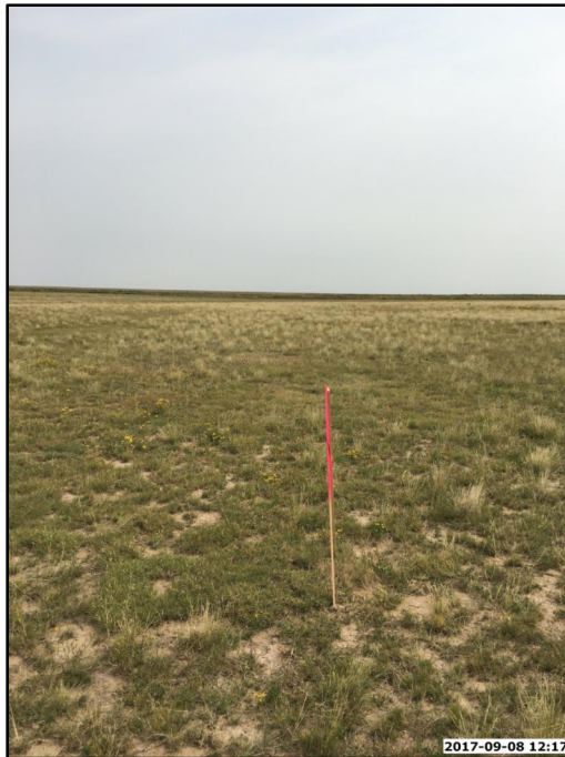
PICTURE OF SALT RANCH FEE 202-1015H REFERENCE AREA - CAMERA ANGLE EAST

REFERENCE AREA PICTURES SALT RANCH FEE 502-1015H, SALT RANCH FEE 202-1015H, SALT RANCH FEE 501-1015H & SALT RANCH FEE 201-1015H LOCATED IN SECTION 10, T11N, R64W, 6TH P.M. WELD COUNTY, COLORADO