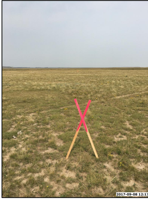
PICTURE OF SALT RANCH FEE 202-1015H REFERENCE AREA - CAMERA ANGLE NORTH