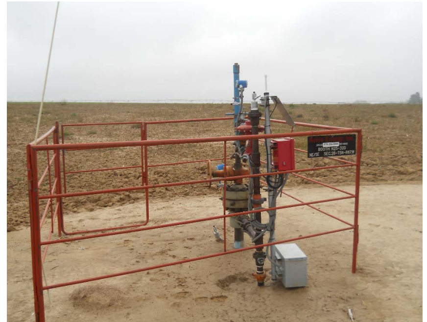
Booth N 25-32D wellhead looking east