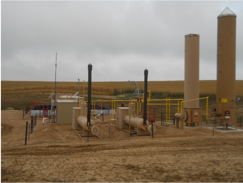
Battery looking west