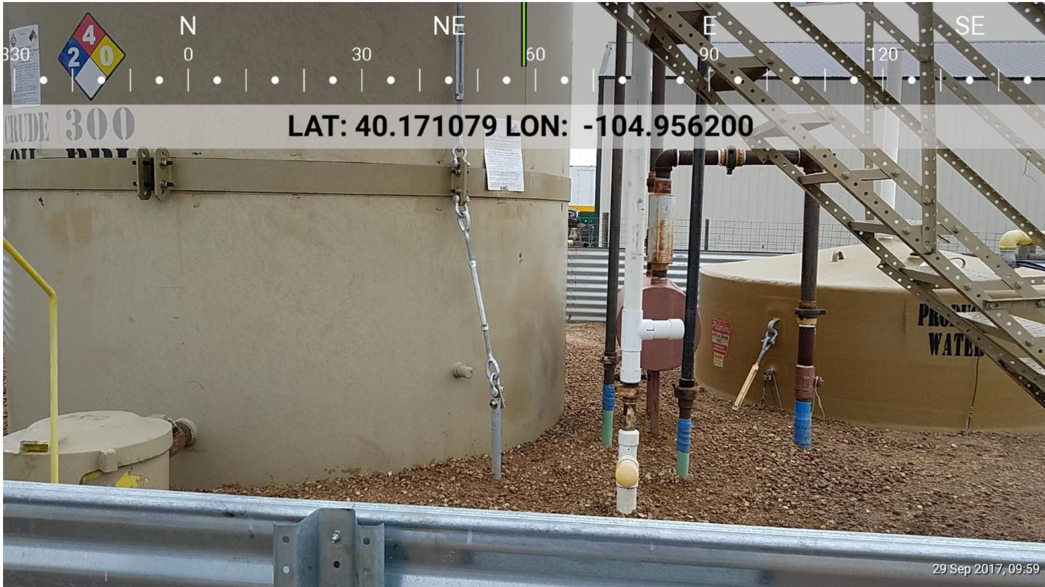
Flood Anchor on crude oil tank