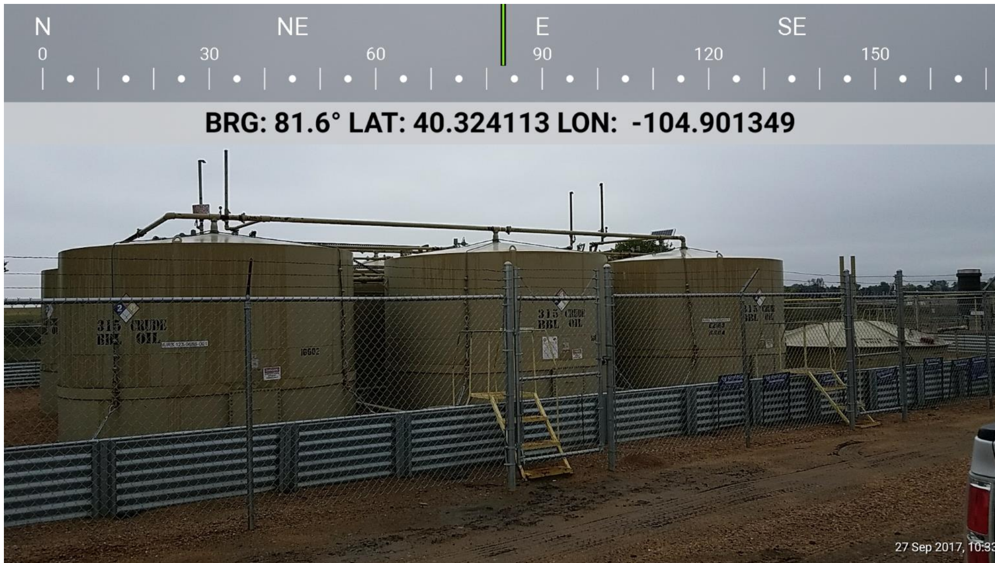
Tank Battery Location Number: 422751