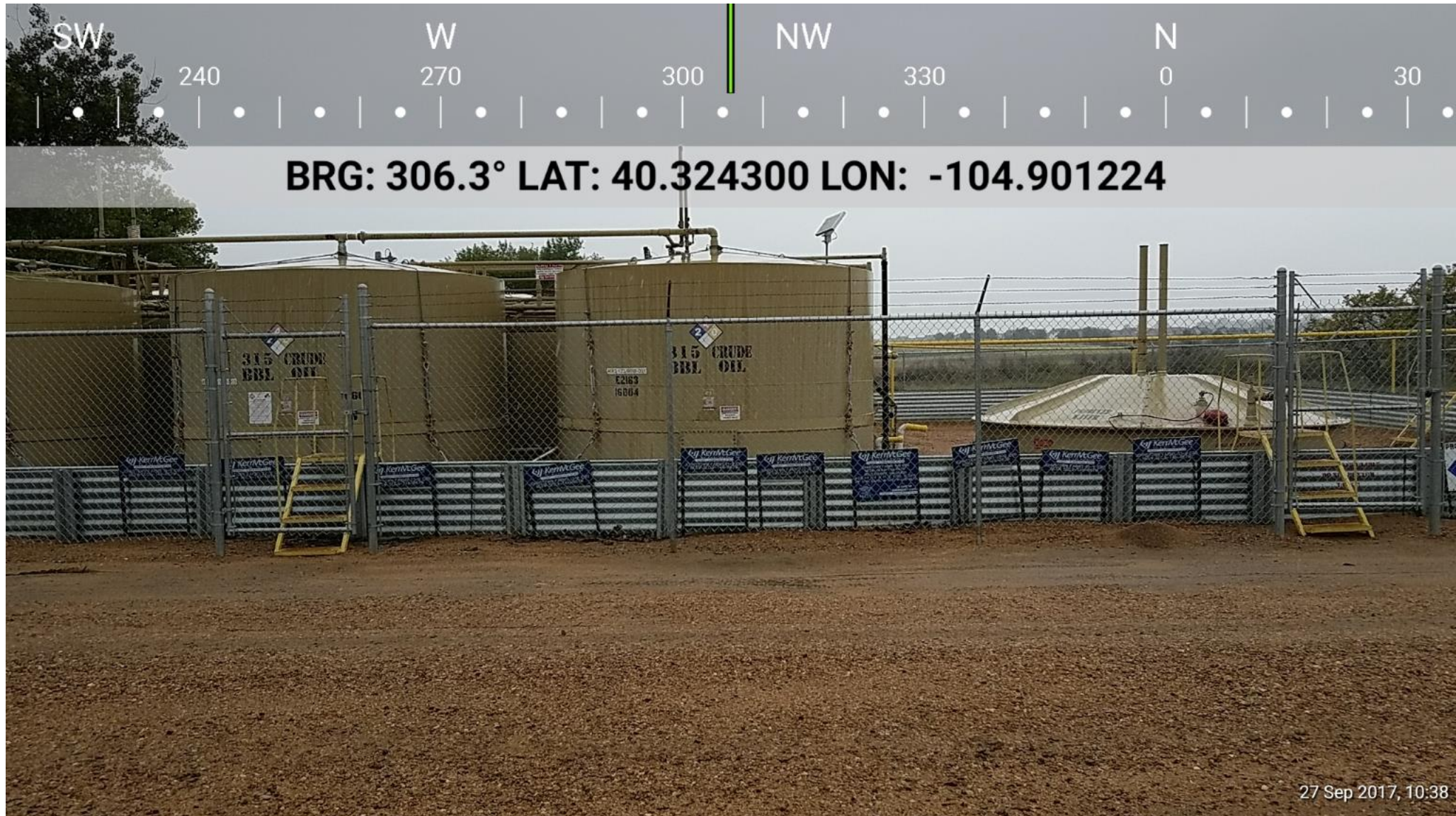
Signage at Battery Location Number: 422751