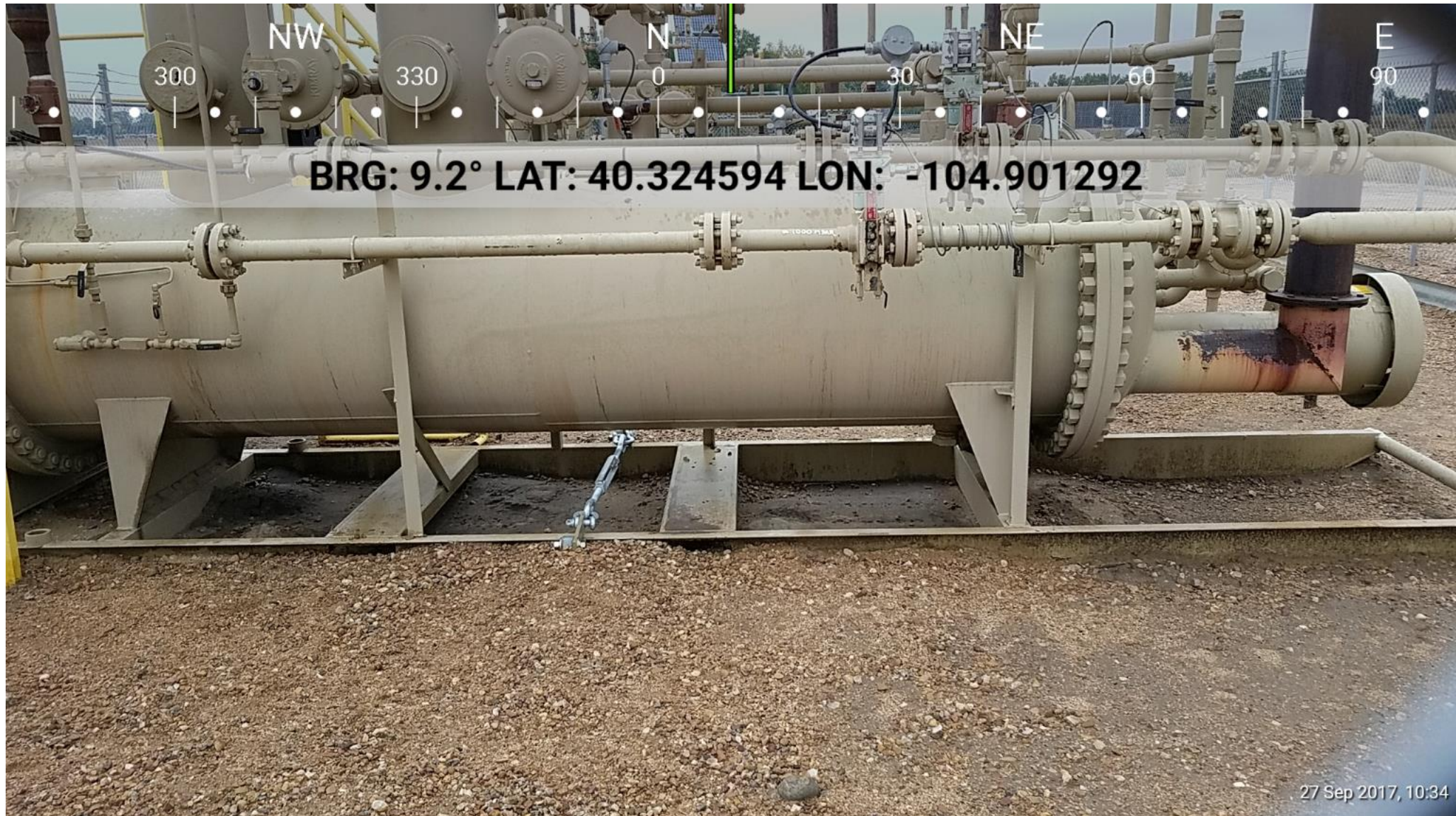
Flood Anchor on Separator Location Number: 422751