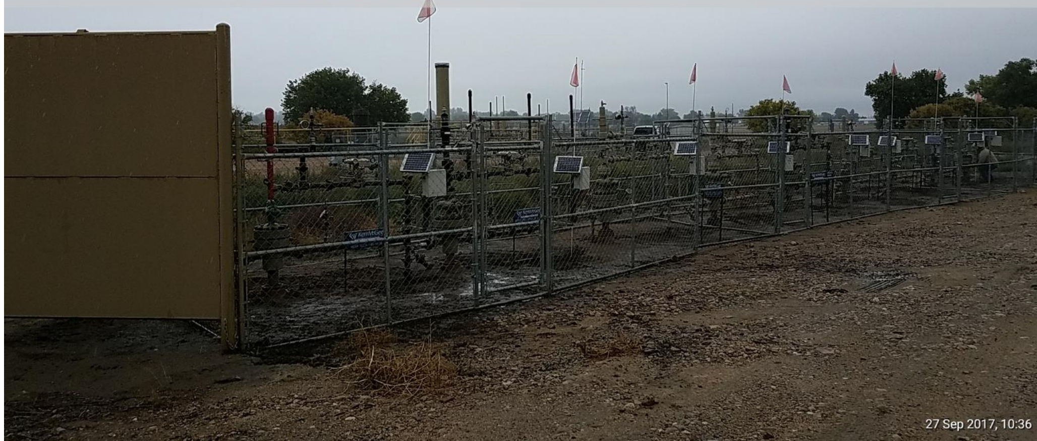
Wellheads Location Number: 422751

BRG: 58.6° LAT: 40.324238 LON: -104.900940