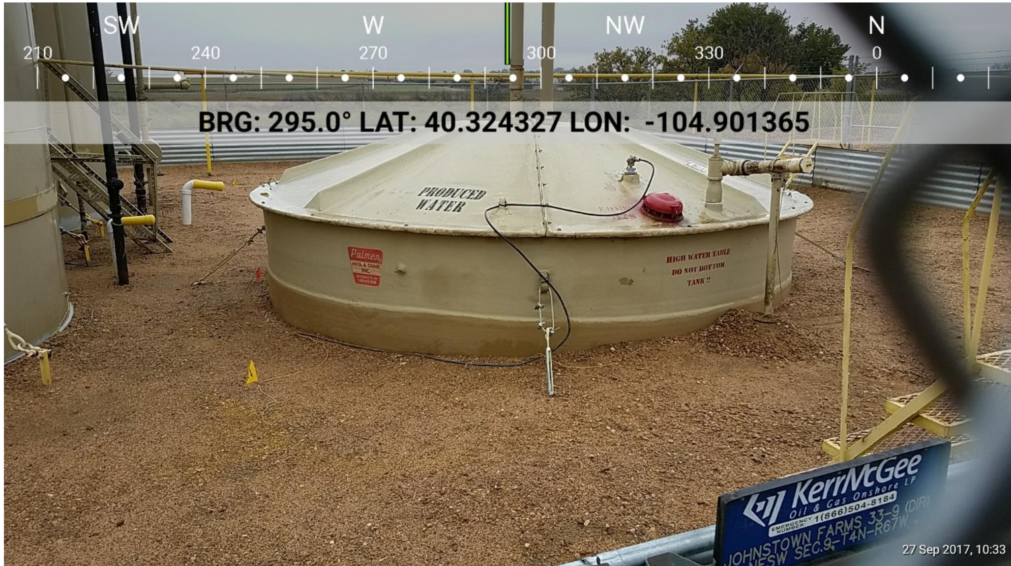
Flood Anchor on Produced Water Tank