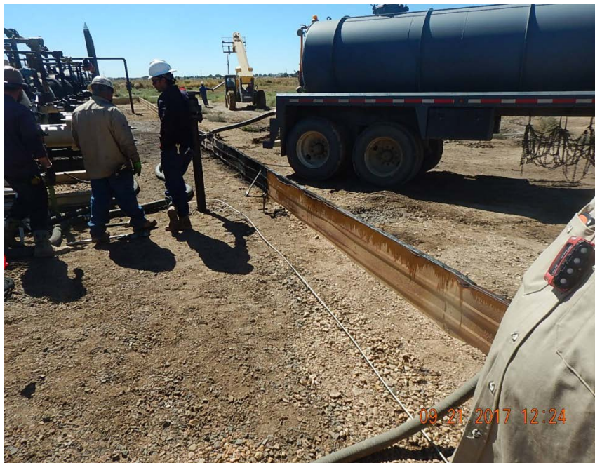
Fire damage photo