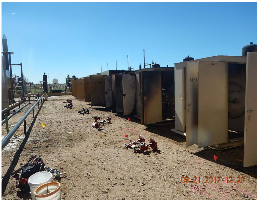
Fire damage photo