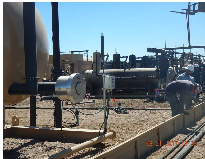
Fire damage photo