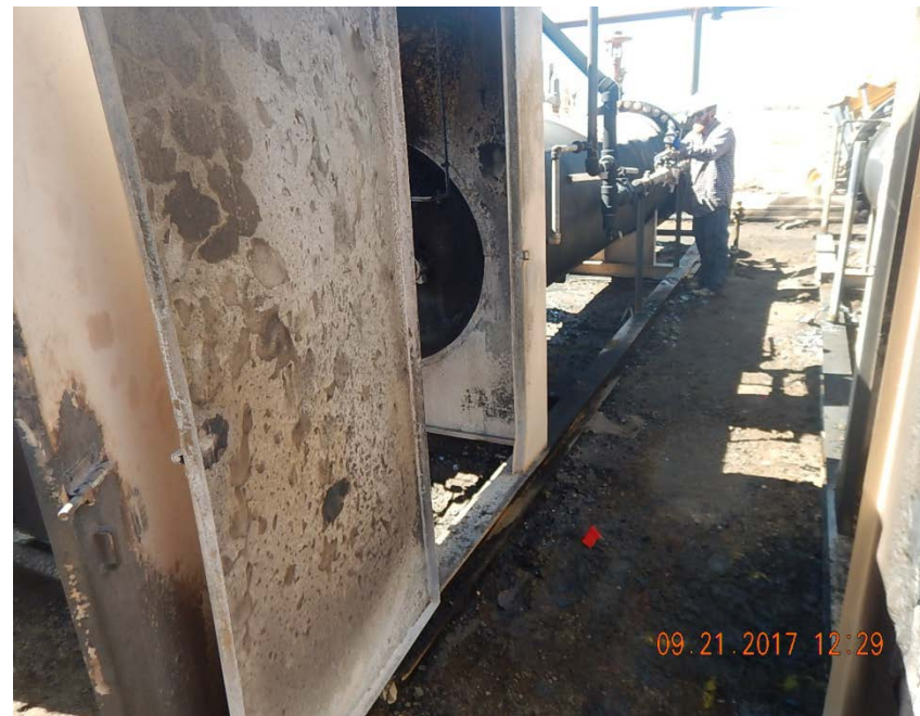
Fire damage photo