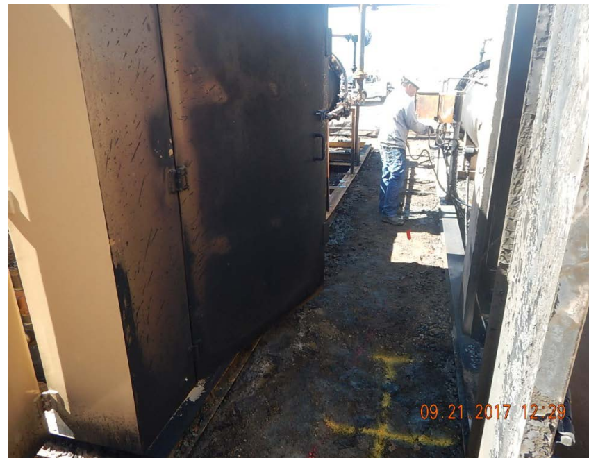
Fire damage photo