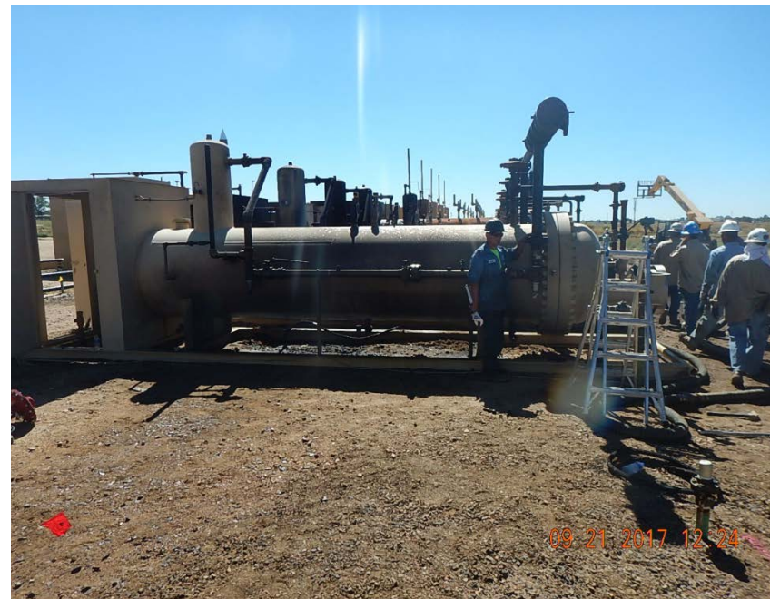
Fire damage photo