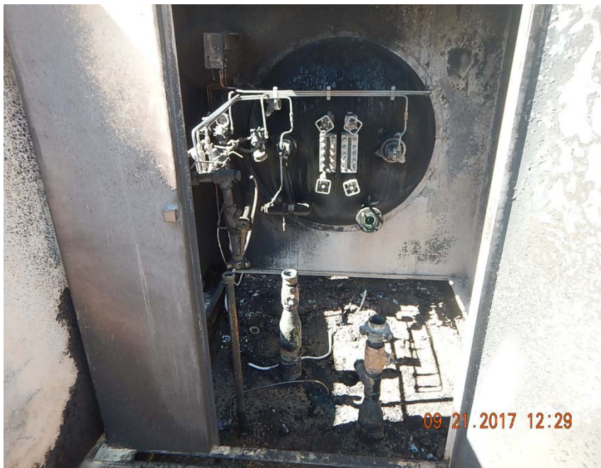
Fire damage photo