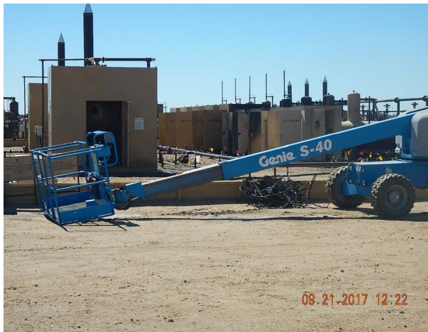
Fire damage photo