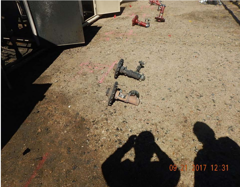
Fire damage photo